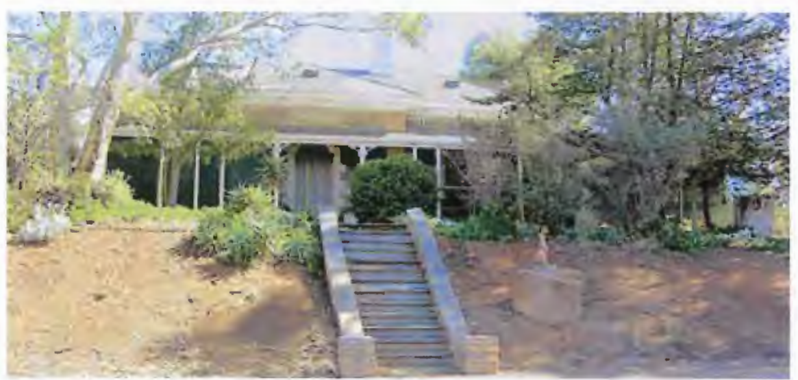
Former Police Station, 2005

Dwelling (former Mintaro Police Station) Burra Street, Mintaro SAHR 10205 – confirmed as a State Heritage Place 5 April 1984