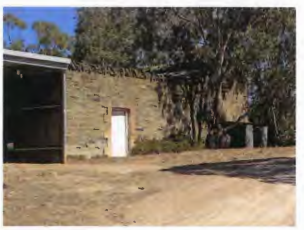
Cells at rear, 2005