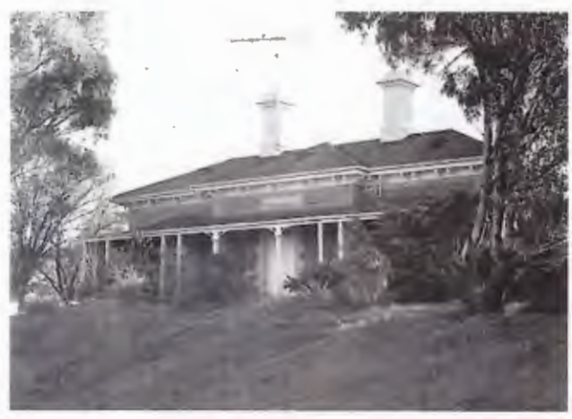
Mintaro Police Station, 1982

The slate building, erected by the Colonial Architect's Office to W. Hanson's design, is a sophisticated example of a police station for that period. It is one of three stations built to the same design (others being at Callington and Truro), but remains the most intact.