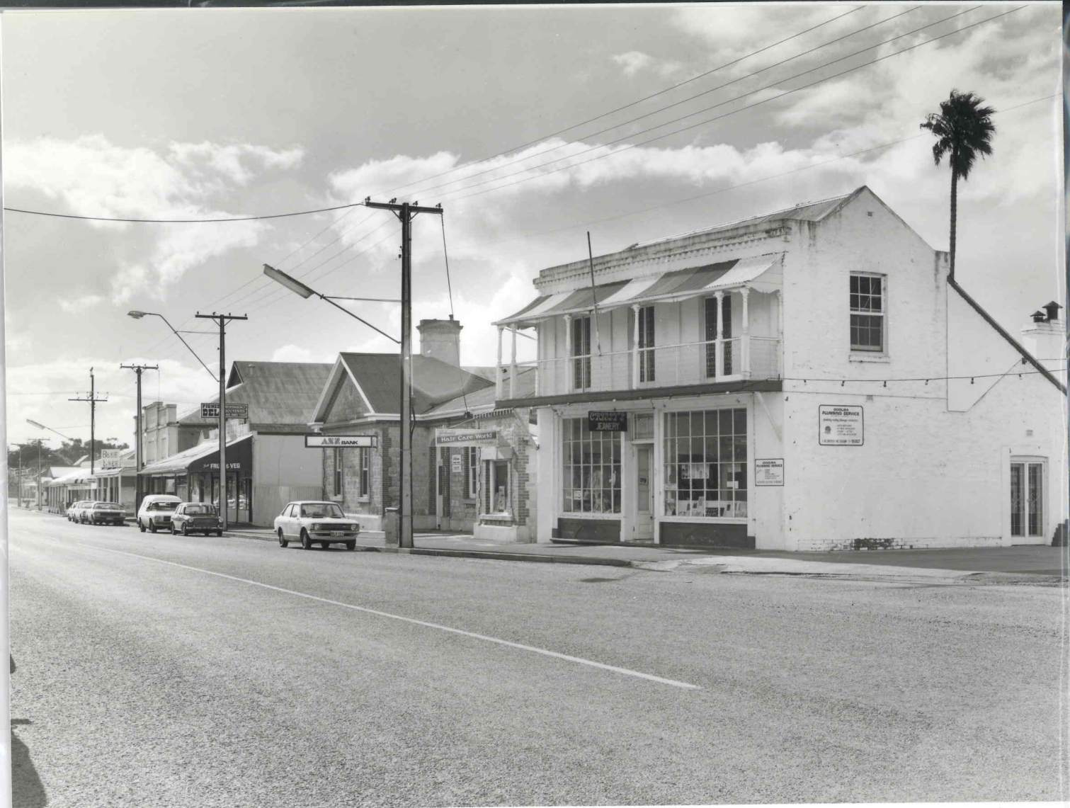
FILM 104 VIEW NORTH ALONG CADELL ST, WITH NO 7 - BOW FRONTED SHOP IN FOREGROUND