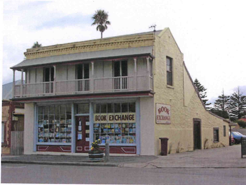
2 Cadell Street Goolwa, March 2005

SHR 10358 – confirmed as a State Heritage Place 24 July 1980