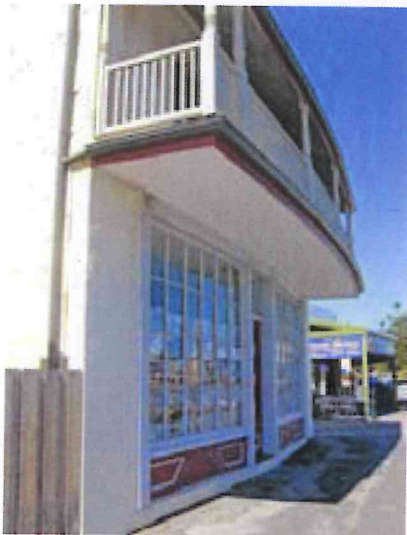
Curved front façade, March 2005

This attractive two-storey building, which combines residence and shop, is an integral part of Goolwa's streetscape and of the heritage of the area.