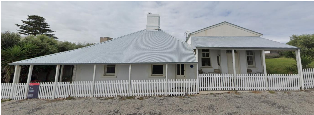
Front of the former post office and telegraph station, 2020.