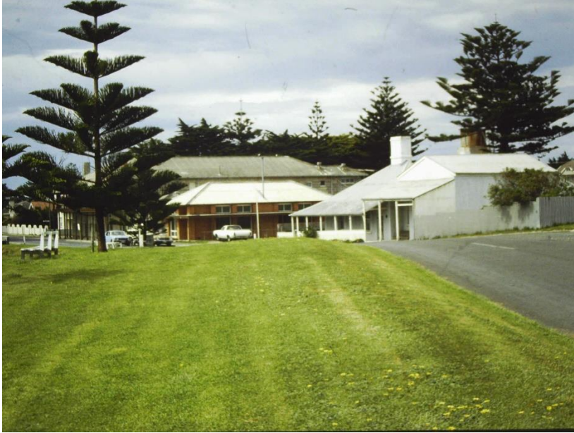
Western elevation of the former post office and telegraph station, c.1982.