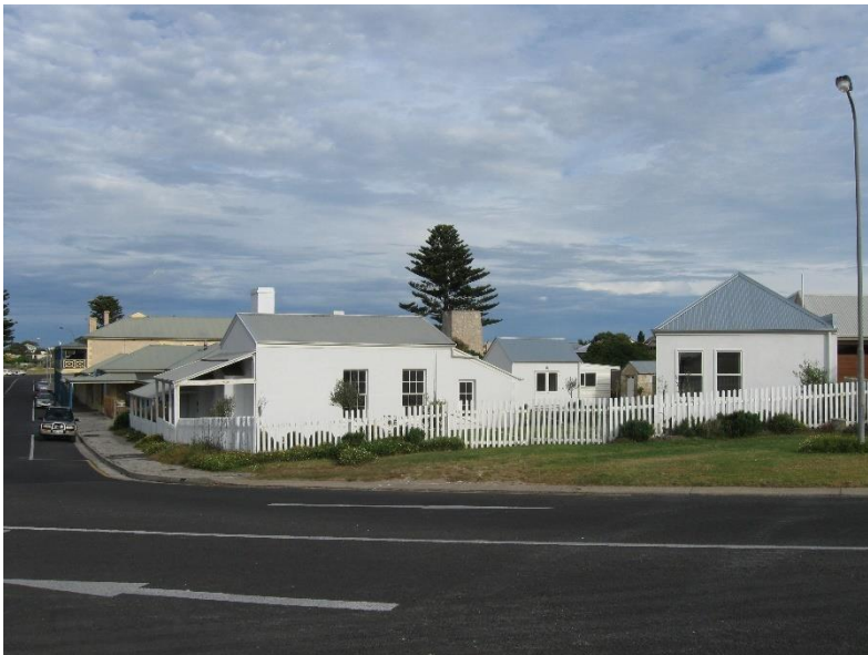
Western elevation of the former post office and telegraph station, 2011.