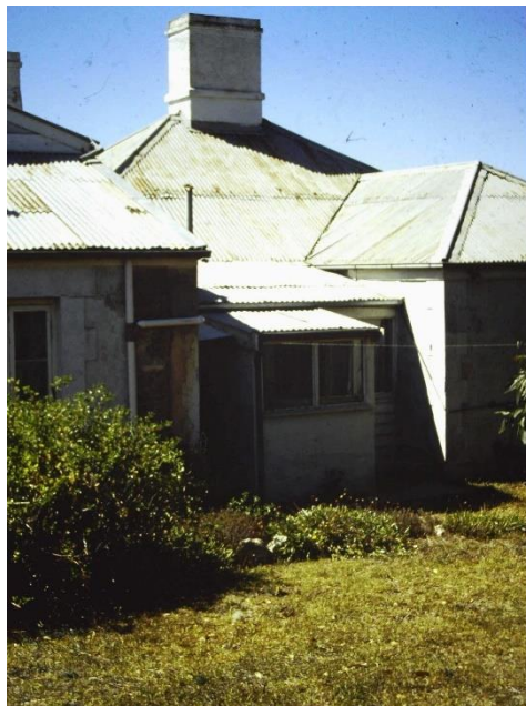
Rear of the former post office and telegraph station, c.1982.