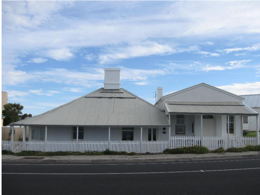
Front of the former post office and telegraph station, 2011.