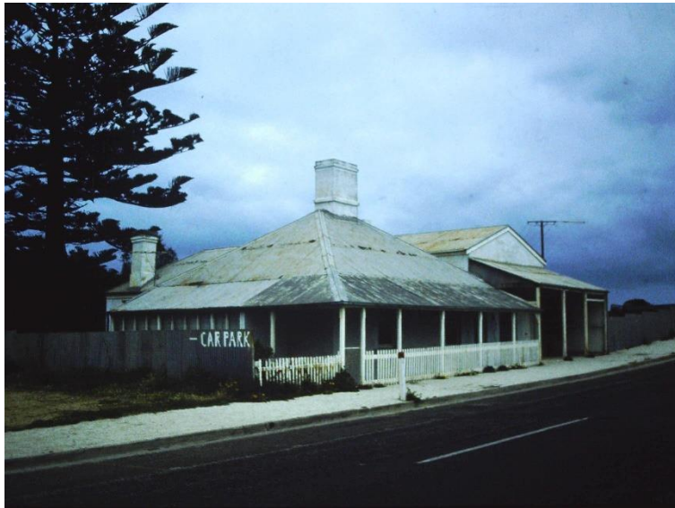
Eastern elevation of the former post office and telegraph station, c.1983.