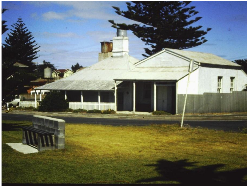
Front of the former post office and telegraph station, c.1982.