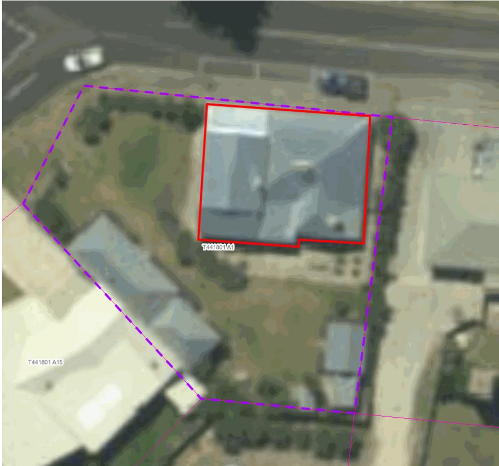
Former Telegraph Station and Robe Post Office, 2 Mundy Terrace, Robe 5276; CT 5546/229 T441801 A1, Hundred of Waterhouse.