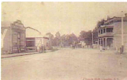
Old Bushman Inn 1905 Photo B 16621/11: State Library of SA

The original Bushman Inn, built by Robert Robertson in 1840, was the second hotel and one of the earliest buildings in Gawler. It was a wattle and daub structure, but had 10 rooms plus outbuildings. A second storey was added by the late 1850s, although the ceilings were only 10 feet high. The hotel's major source of income came from settlers passing through to the north, and later from increased patronage due to the through traffic associated with the Burra and Kapunda mines.