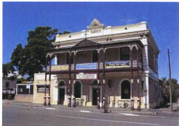
Old Bushman Inn, 2005

The licensee from 1867 to 1874 was the Hon James Howe, who joined State Parliament in 1881, becoming Minister for Crown Lands and Minister for Public Works. He was also a member of the 1897 Convention that framed the Federal Constitution.