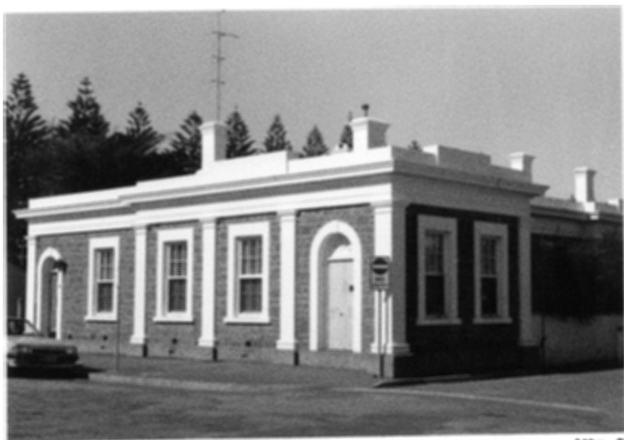
FORMER P.O. VICTOR HARBOR