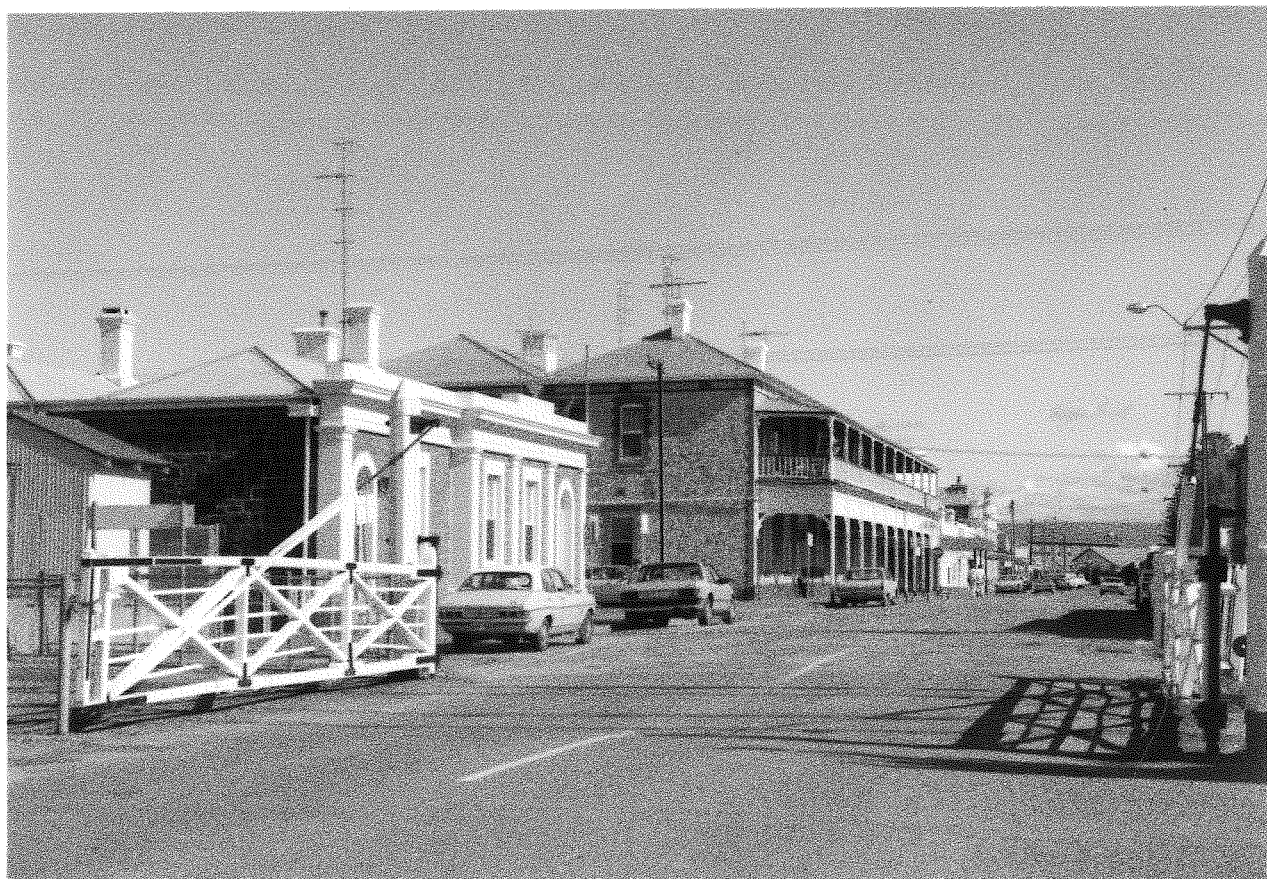
FORMER P.O., VICTOR HARBOR