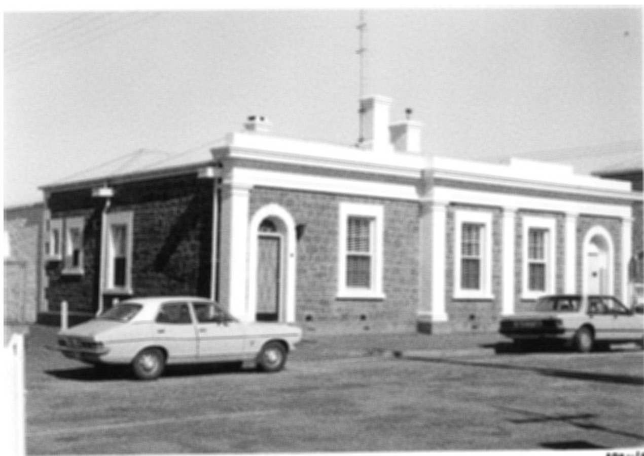
FORMER P.O., VICTOR HARBOR