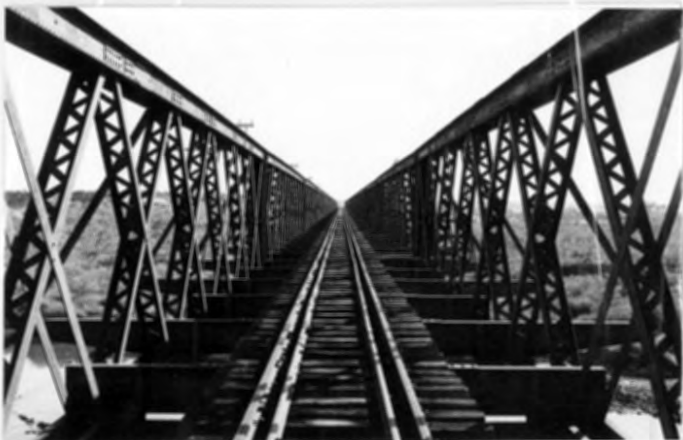
Film 1147 No 8