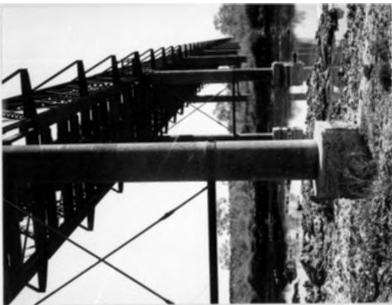
Film 1147 ALGEBOCKINNA BRIDGE July 185 No 4 Lohman