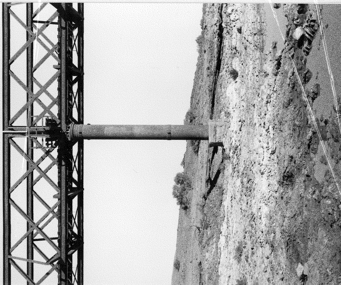
Film 1147 ALGEBUCKINNA BRIDGE JULY 85 No 3 JAW