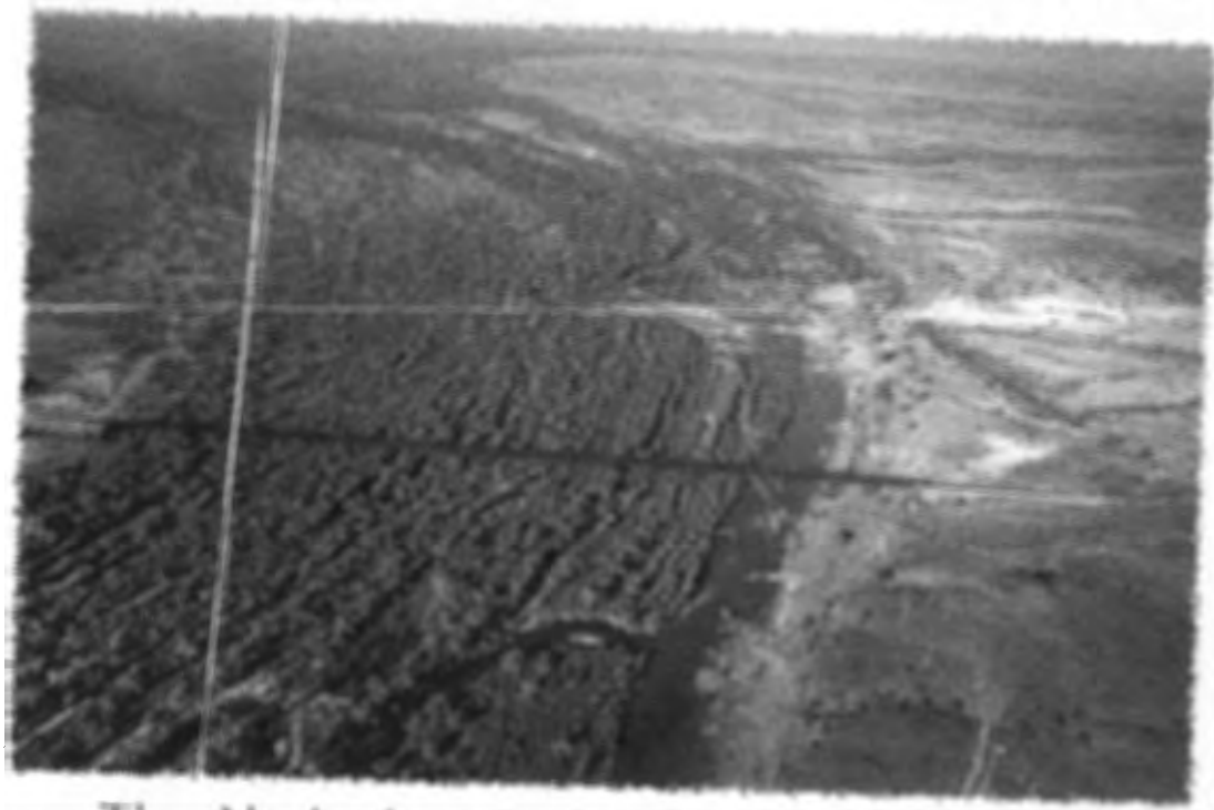
The Algebuckina Bridge - Oodnadatta Track