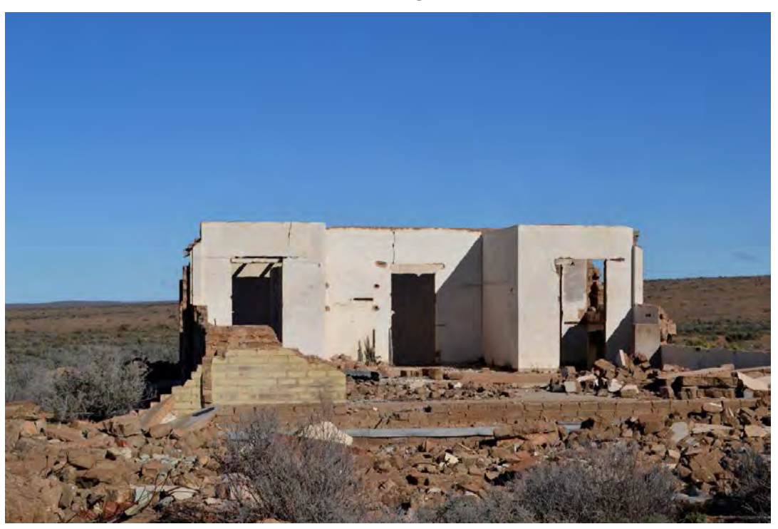
Remains of visitor's accommodation, 2016