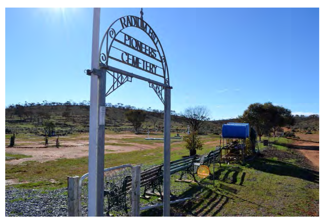
Radium Hill Pioneers Cemetery entrance, 2016

Radium Hill Townsite and Cemetery Maldorky Station, off the Barrier Highway, East of Olary