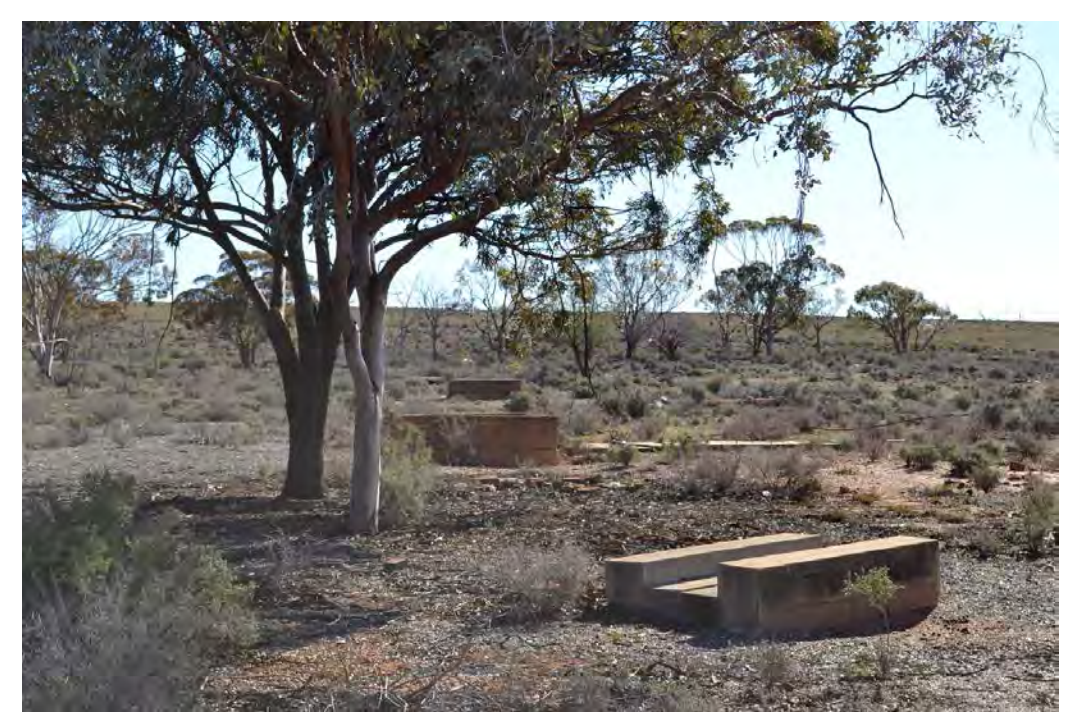
Water-tank stands associated with removed residential accommodation, 2016

Radium Hill Townsite and Cemetery Maldorky Station, off the Barrier Highway, East of Olary