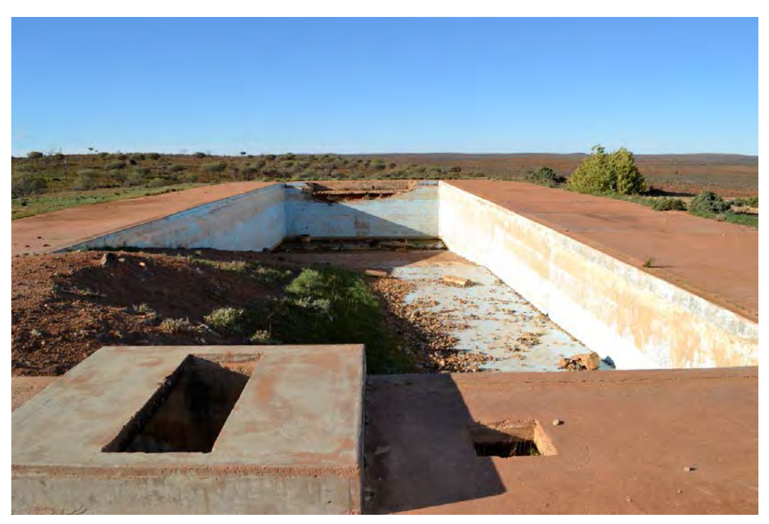
Swimming pool remains, 2016