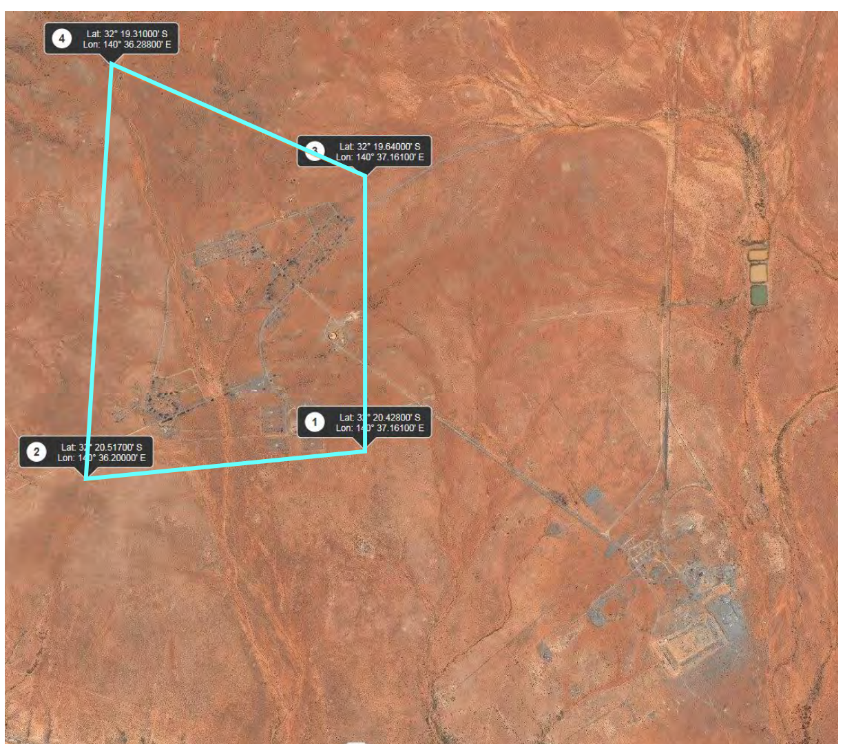
RADIUM HILL TOWNSITE AND CEMETERY (MINESITE TO SOUTHWEST) N ↑ Maldorky Station, off the Barrier Highway, East of Olary Site plan generally indicating the boundary of the State-heritage listed place derived from GPS coordinates.