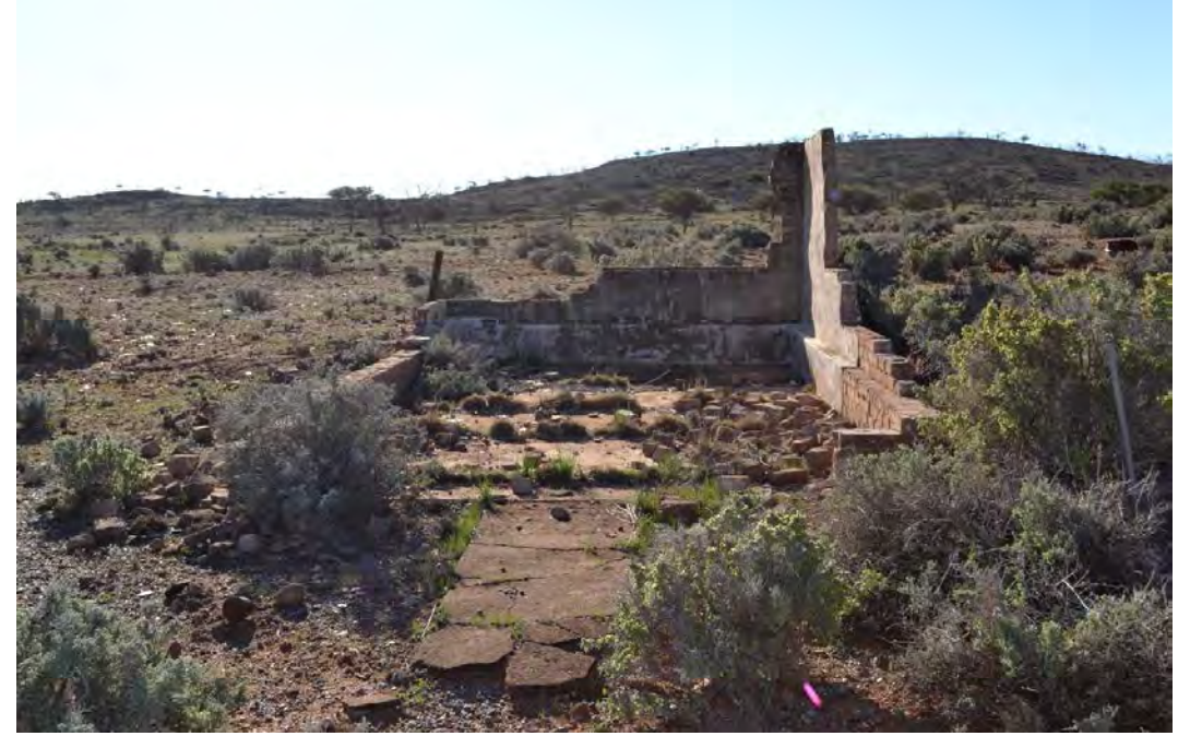
Remains of Schoolhouse, 2016