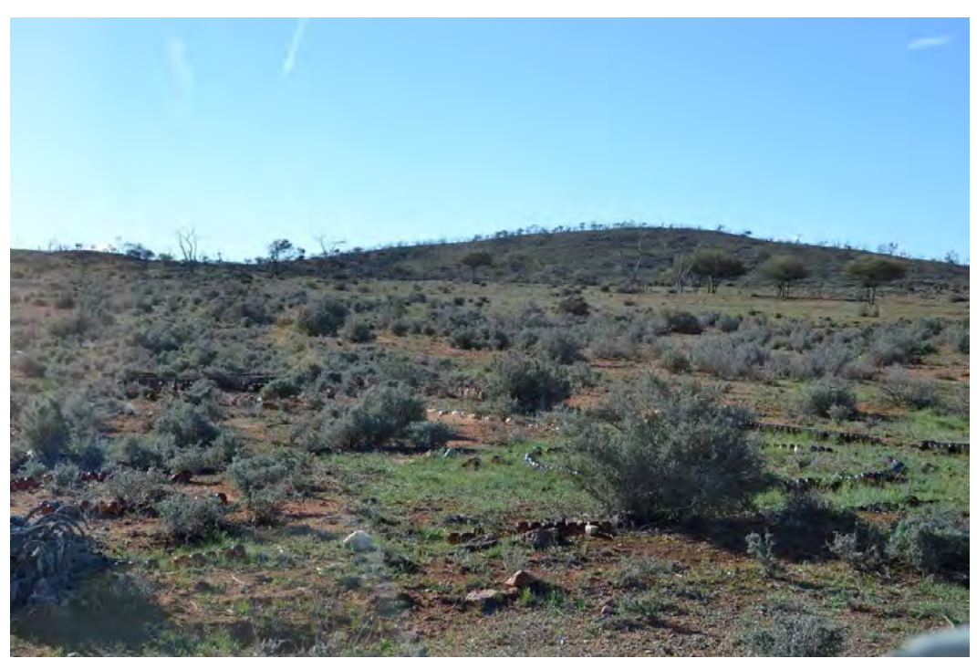
Extant garden borders constructed of glass bottles, 2016