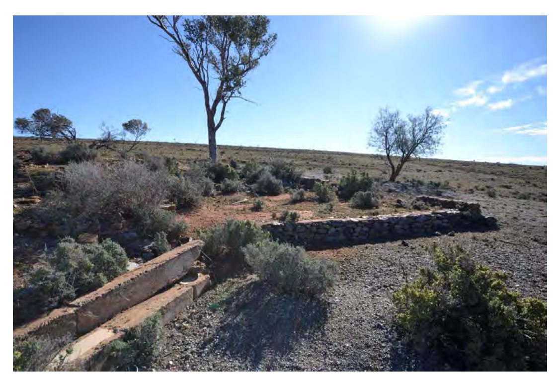
Remains of General Managers residence, 2016

Radium Hill Townsite and Cemetery Maldorky Station, off the Barrier Highway, East of Olary