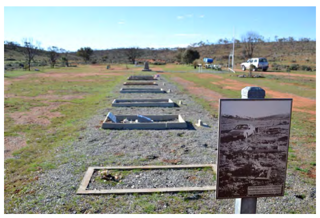
Radium Hill Pioneers Cemetery gravesites, 2016