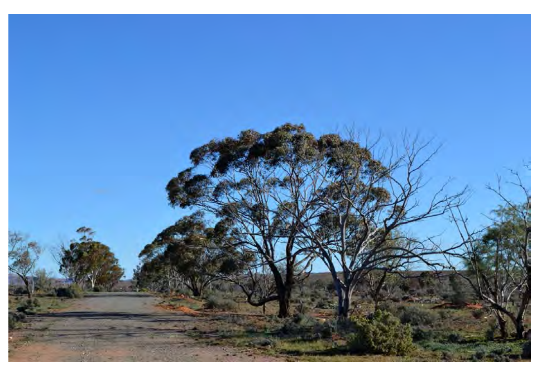
Remaining bituminised road, note: avenue of eucalypts, 2016

Radium Hill Townsite and Cemetery Maldorky Station, off the Barrier Highway, East of Olary