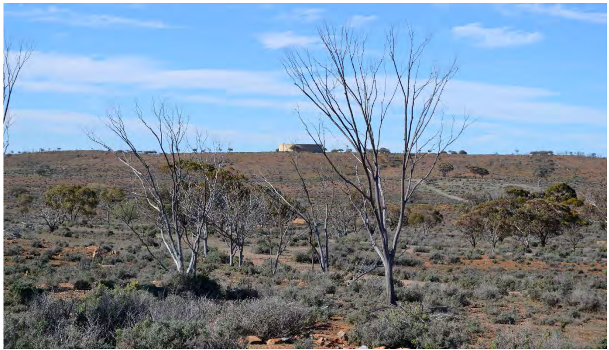
2million Gallon Tank on hilltop, 2016