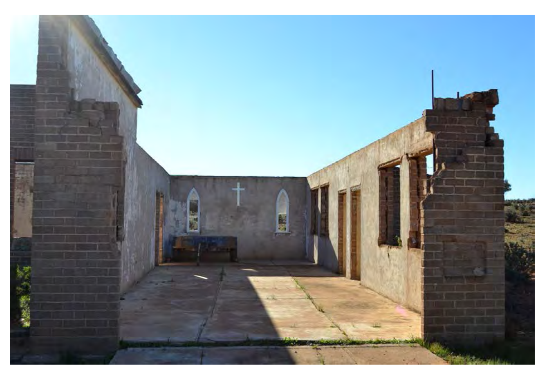
Remains of Catholic Church, 2016

Radium Hill Townsite and Cemetery Maldorky Station, off the Barrier Highway, East of Olary