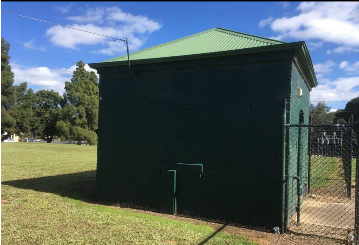
Former pump-house/Valve house