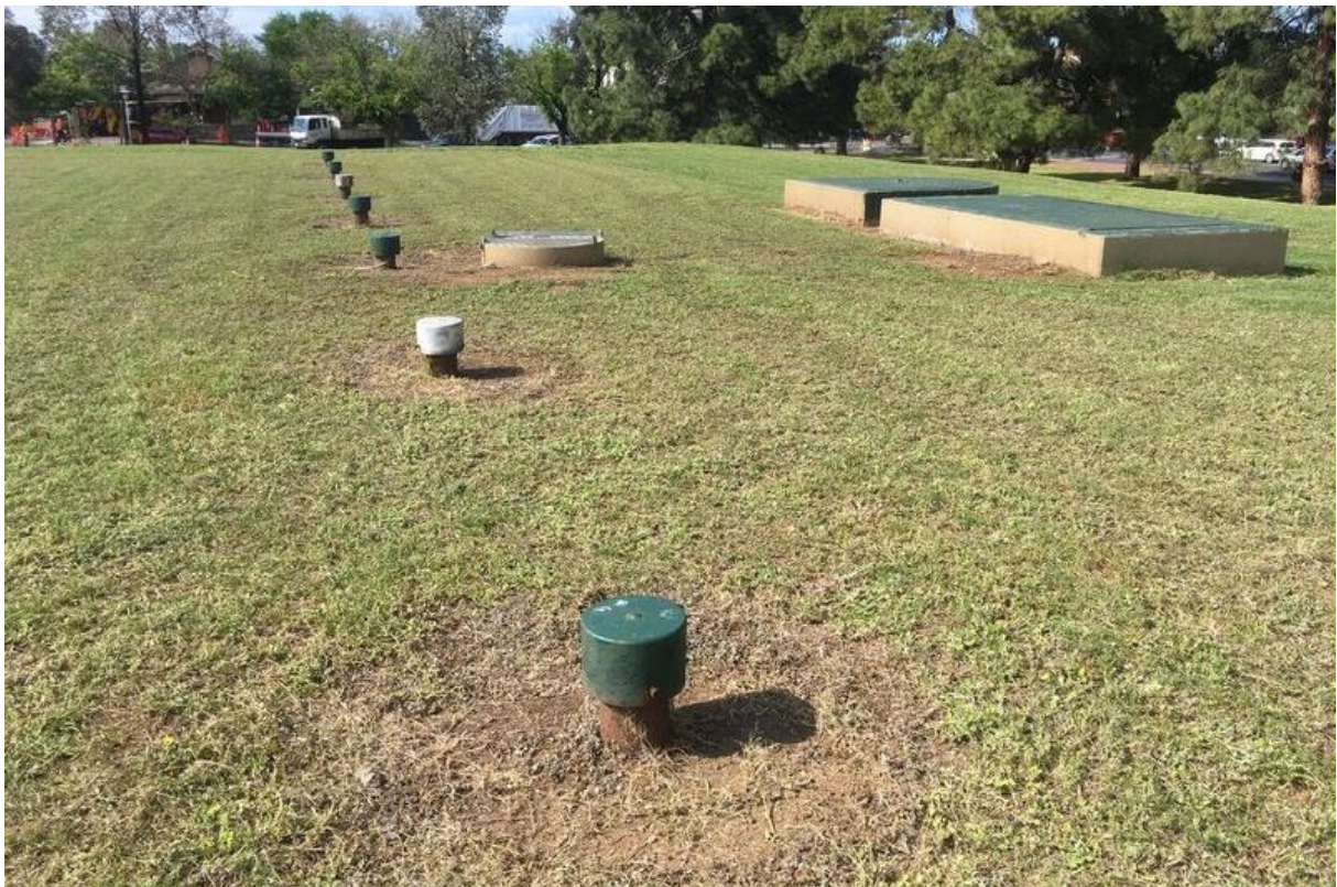
Various vents and caps