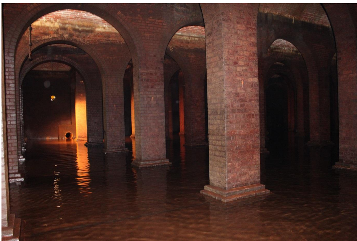
Service Reservoir interior (courtesy SA Water).