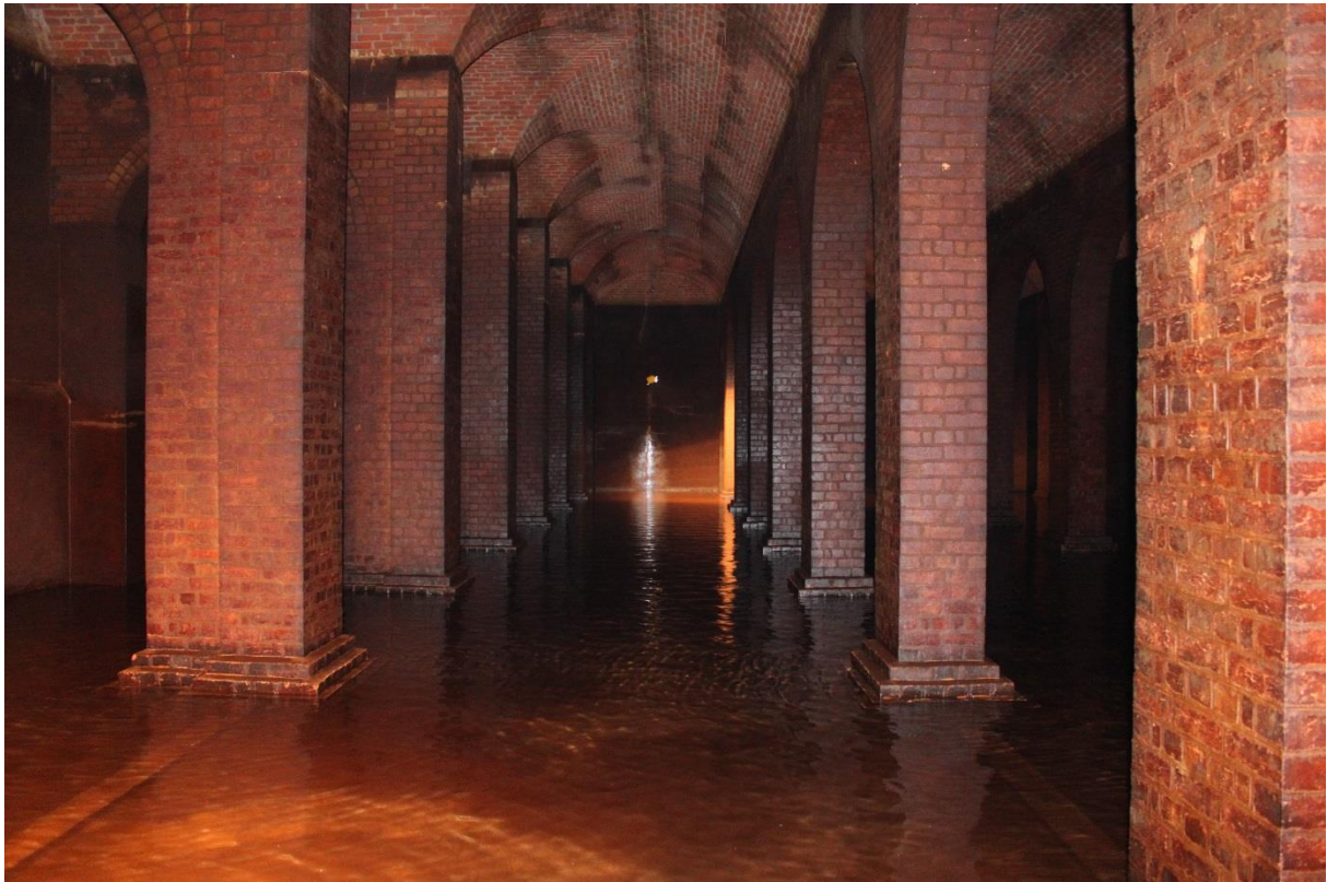
Service Reservoir interior (courtesy SA Water).