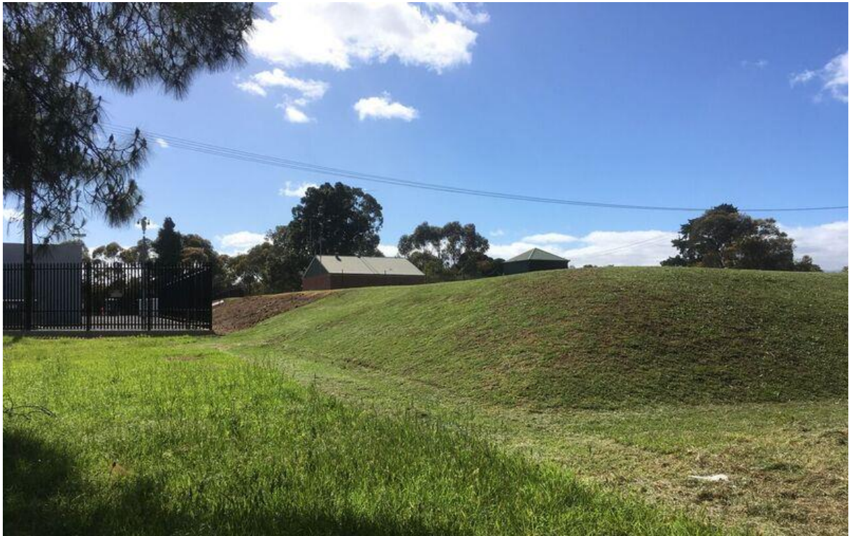
Service Reservoir mound