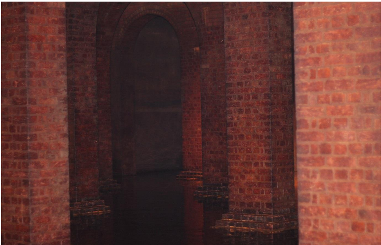
Service Reservoir interior.