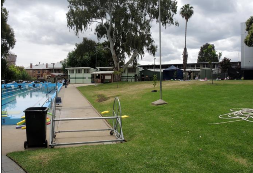
Kensington and Norwood Pool, 26-28 Phillip Street, Kensington (Looking north)