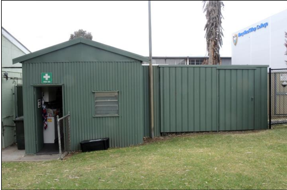
Kensington and Norwood Pool, 26-28 Phillip Street, Kensington [Metal first aid hut and attached storage shed]