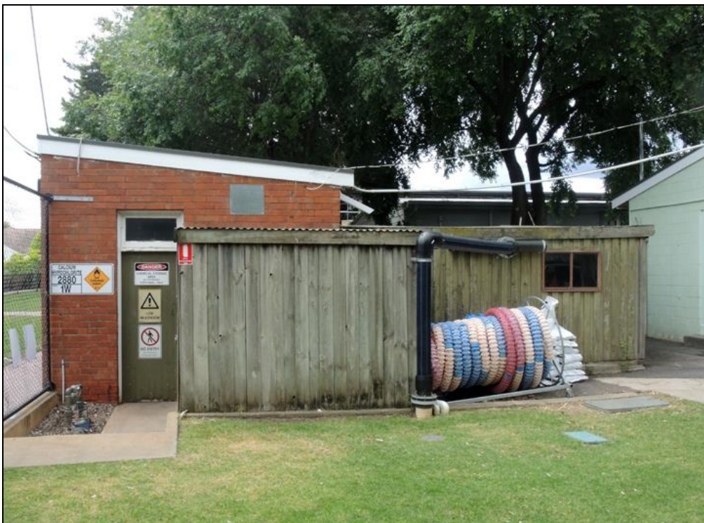
Kensington and Norwood Pool, 26-28 Phillip Street, Kensington [The brick chemical store and attached wooden pump house]