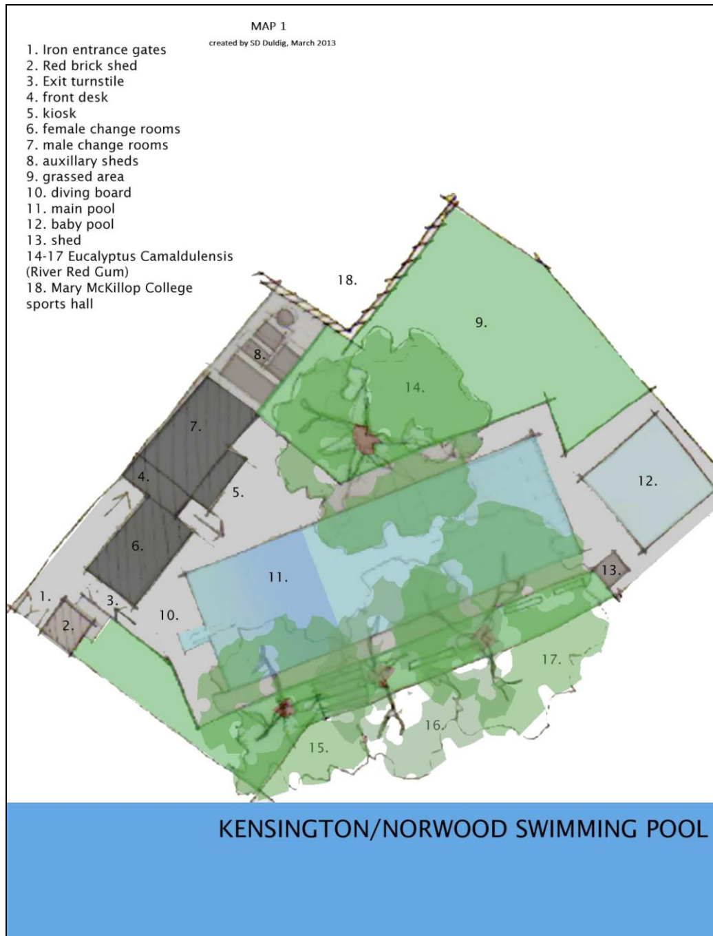
Site Plan of the Kensington and Norwood Pool, 26-28 Phillip Street, Kensington