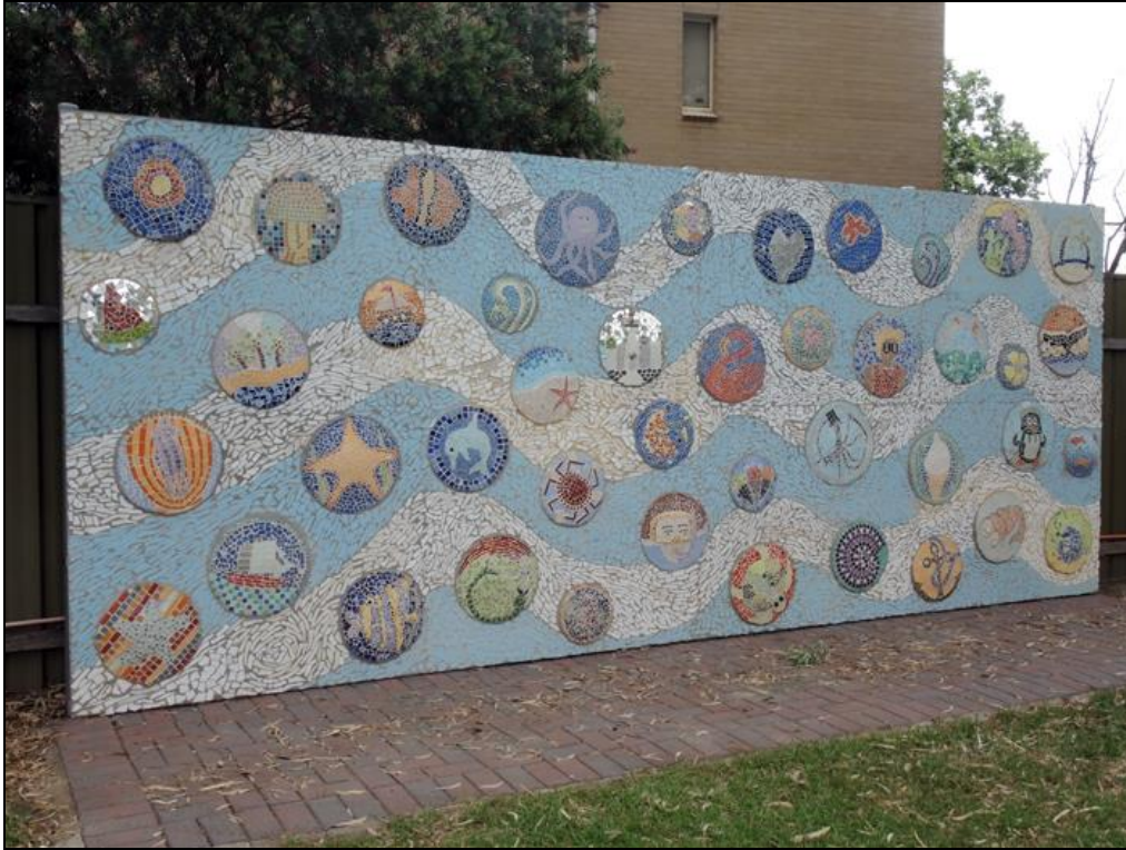
Kensington and Norwood Pool, 26-28 Phillip Street, Kensington [An artistic mosaic mural on the south western boundary line]