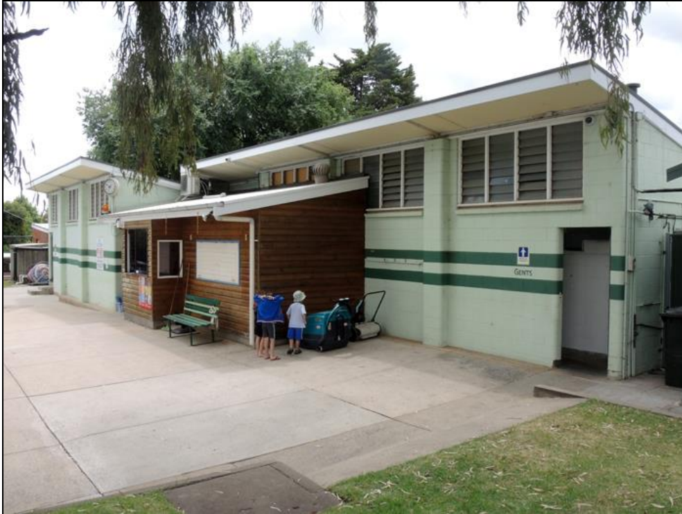
Kensington and Norwood Pool, 26-28 Phillip Street, Kensington [The change rooms wooden shop]