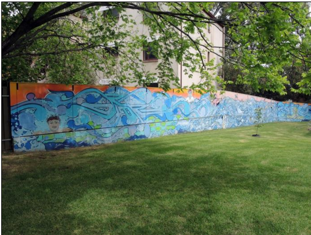
Kensington and Norwood Pool, 26-28 Phillip Street, Kensington [A long painted mural along the north east boundary]