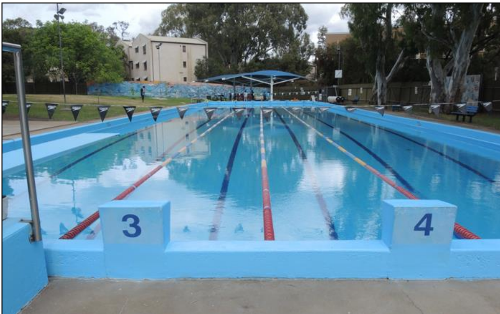
Kensington and Norwood Pool, 26-28 Phillip Street, Kensington (Looking south) [The 55 yard swimming pool with wading pool in the background]