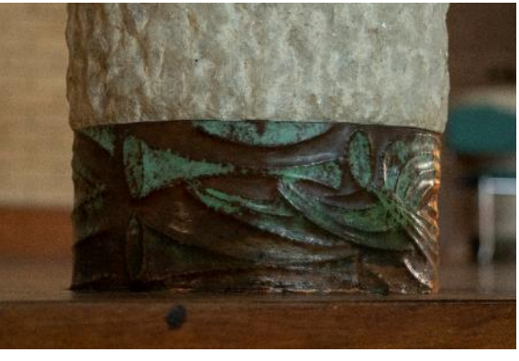
Beaten copper ring with trumpeting angel motif on foot of communion table