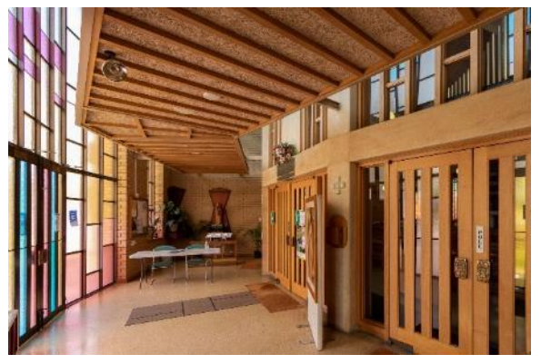
View of narthex

St Margaret Mary's Catholic Church 286 Torrens Road, Croydon Park