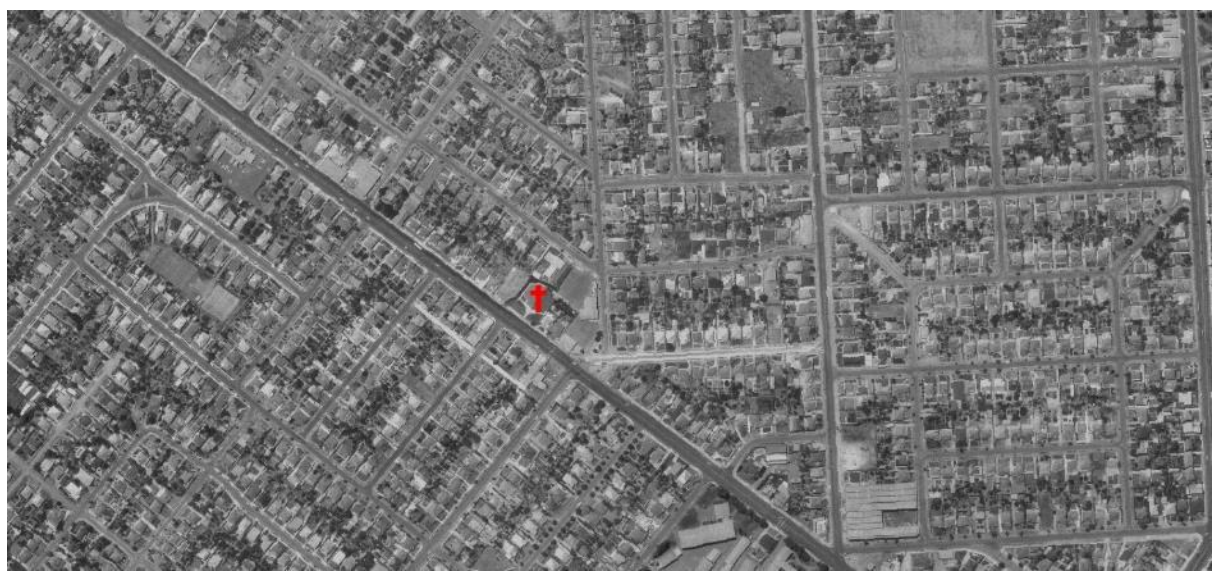
Area surrounding St Margaret Mary's church (marked) in 1968, showing suburban development since 1949

Source: https://mapping.portenf.sa.gov.au/history/