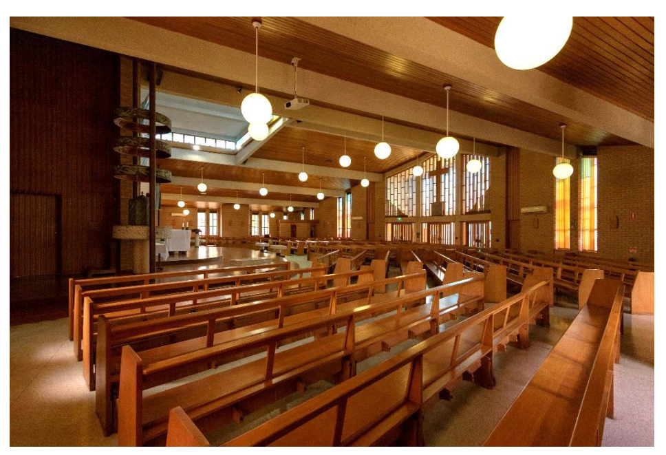
View of nave, towards narthex, with tabernacle on left

St Margaret Mary's Catholic Church 286 Torrens Road, Croydon Park