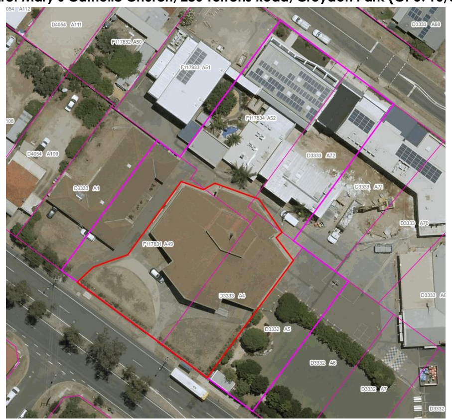
5726/535, CT 5385/507, CT 5824/99, CT 5840/399; F117834 A52, D333 A72, D3333 A4, F117831 A49, D3332 A5 Hundred of Yatala)

St Margaret Mary's Catholic Church, 286 Torrens Road, Croydon Park (CT 5710/844, CT