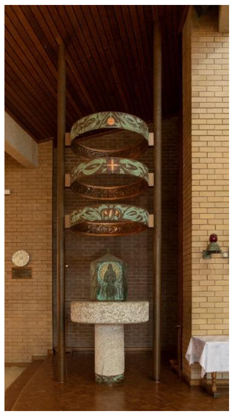
tabernacle, tabernacle stand and ciborium (canopy) by Voitre Marek