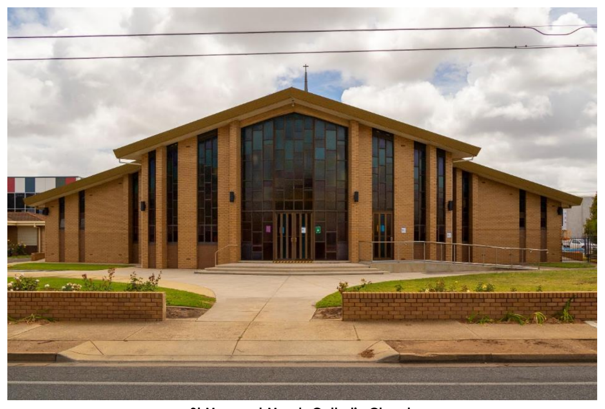
St Margaret Mary's Catholic Church

All images in this section are from DEW Files and were taken during the site visit 15 November 2021, unless otherwise indicated.