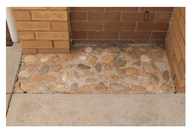
Pebbles in concrete between front elevation and footpath