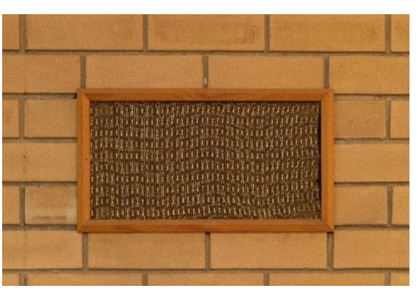
Original speaker in wall