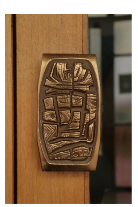
Typical door handle