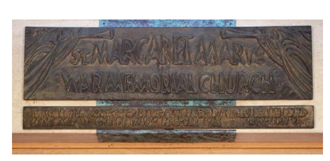
Dedication plaque above doors to nave