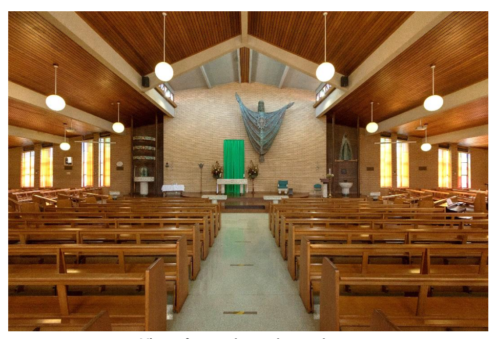
View of nave, towards sanctuary

St Margaret Mary's Catholic Church 286 Torrens Road, Croydon Park