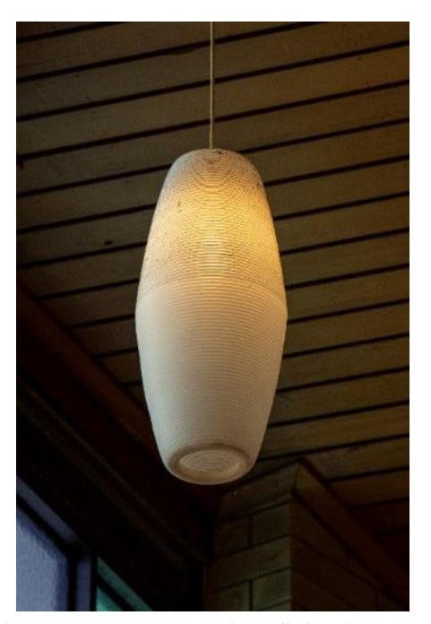
Original glass pendant light fitting in narthex

St Margaret Mary's Catholic Church 286 Torrens Road, Croydon Park