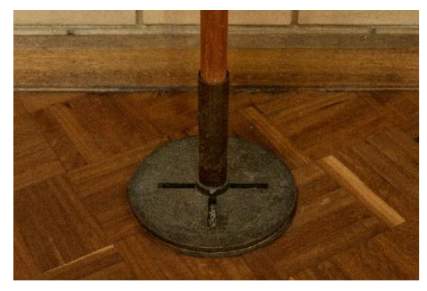
Processional Cross fixed base by Voitre Marek