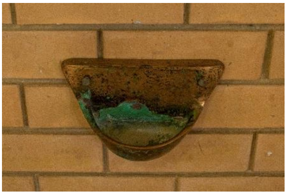
Holy water stoup by Voitre Marek