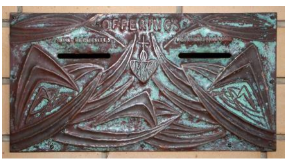
Donation box cover in narthex