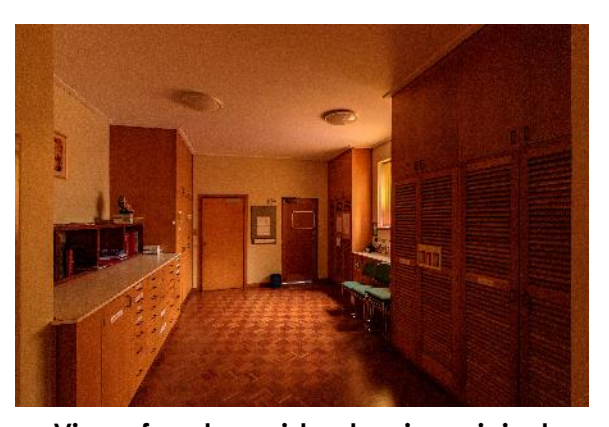
View of work sacristy, showing original parquetry floor and cabinetry