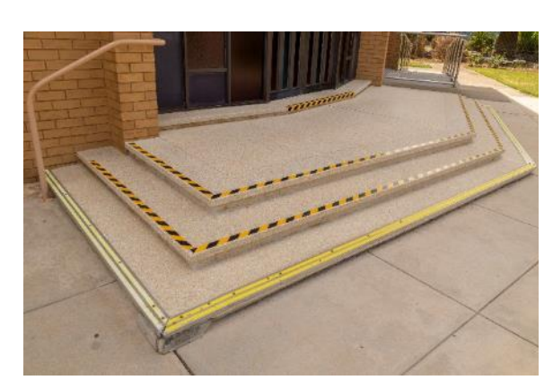
White terrazzo steps