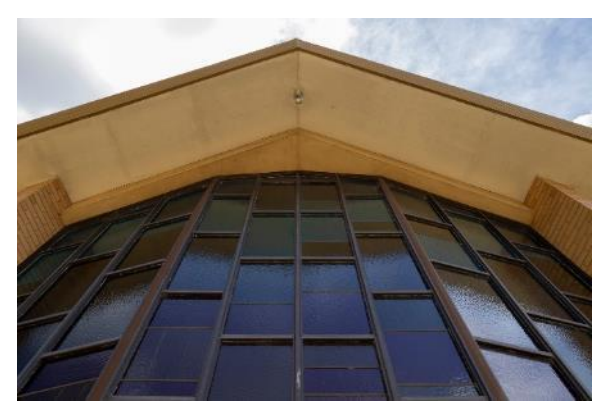
Front elevation window over entrance