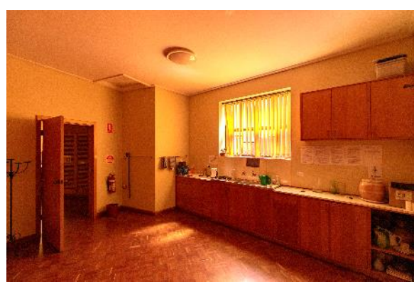
View of priest's sacristy, showing original parquetry floor and cabinetry