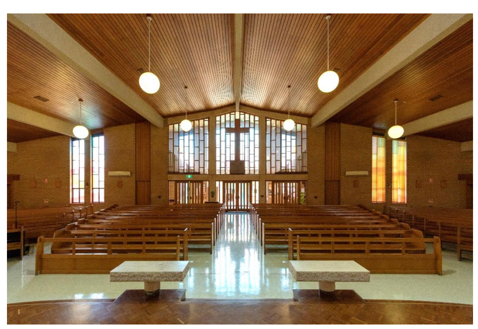
View from sanctuary towards narthex