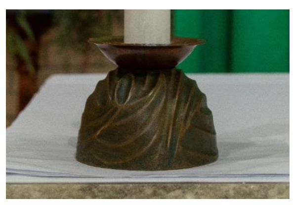
Candle holder (one of six) by Voitre Marek