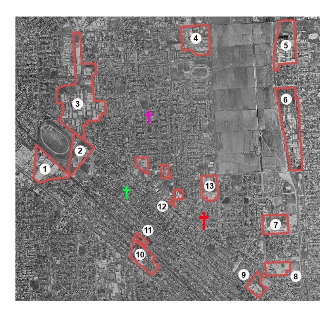
Selected industries surrounding Croydon Parish in 1968.