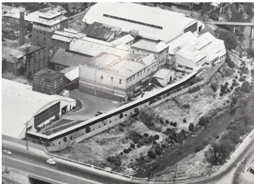
The bank as it appeared in c.1956