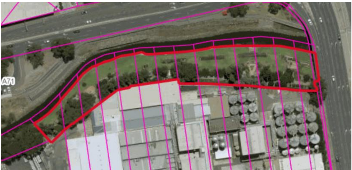
Former West End Brewery Garden (former SABCo Brewery garden), CTs as listed in table below, Hundred of Adelaide

107 Port Road, Thebarton, (River Torrens/Karrawirri Parri (adjacent Adam Street Thebarton))