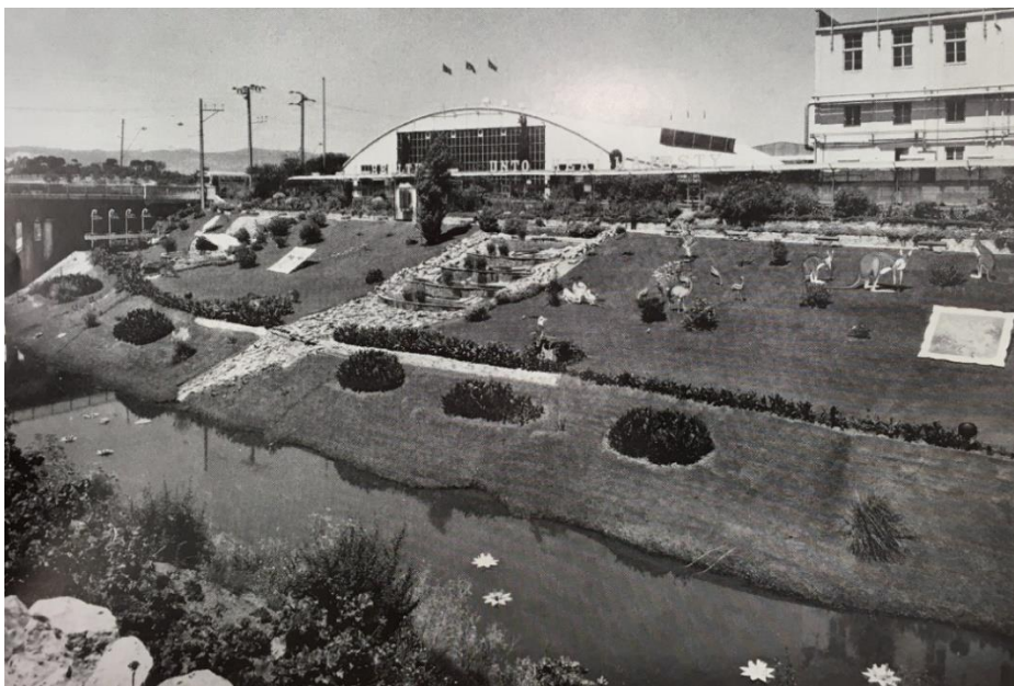
Brewery garden display for the visit of Queen Elizabeth II and Prince Philip, 1963, note the addition of the lily pads in the river

In keeping with SABCo management's aim to create a connection between the brewery and community, a number of seasonal displays were installed in any one year, including annual displays for Easter and Christmas and more periodic events such as the Adelaide Festival of Arts and the Royal visit by Queen Elizabeth II and Prince Philip in 1963.