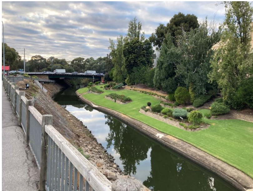
West End Brewery Garden showing the three mass planted rectangular garden beds

(River Torrens/Karrawirri Parri (adjacent Adam Street Thebarton))