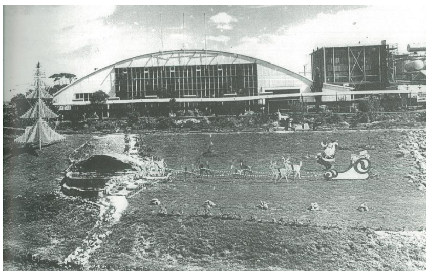
First Christmas Display, 1959, note the grotto (left), garden bed with stone retaining walls at rear of the garden and rubble (far right) that will become the cascade