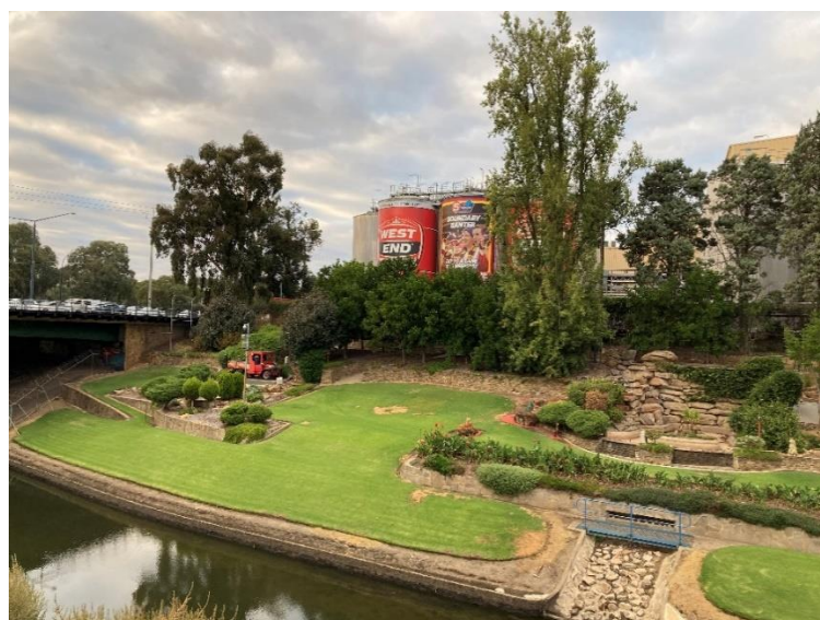
West End Brewery Garden showing the pond and rock garden (previously the cascade)