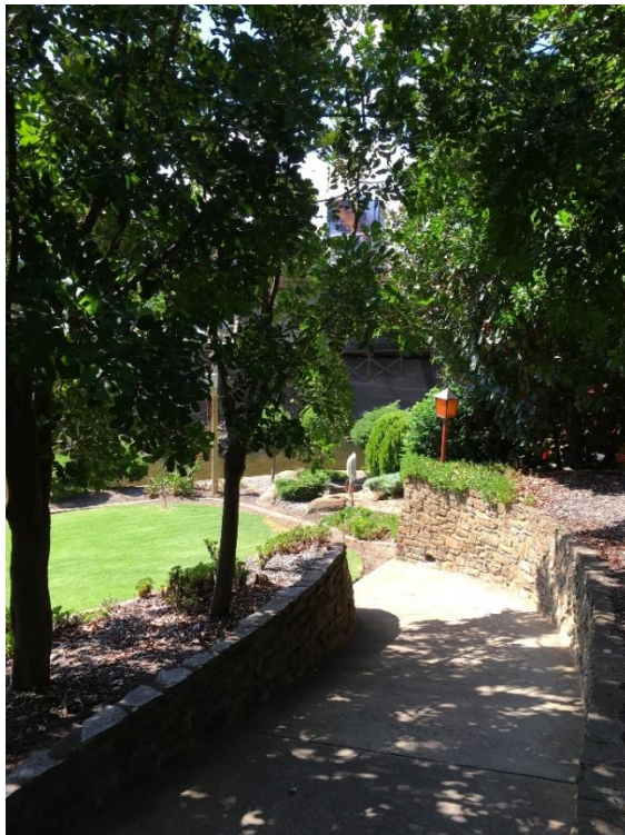
West End Brewery Garden showing one of the paths that dissect the rear garden bed

(River Torrens/Karrawirri Parri (adjacent Adam Street Thebarton))