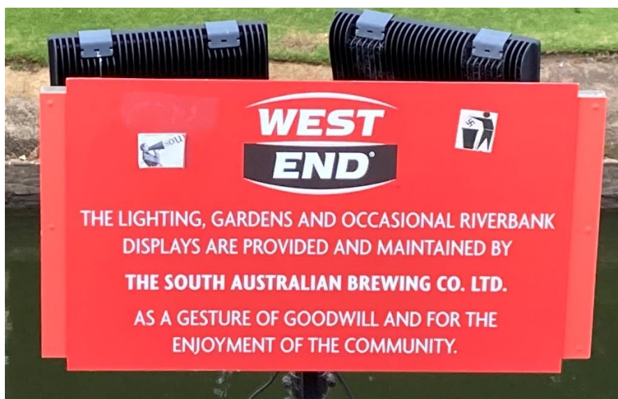
Sign on the northern riverbank from SABCo about the garden