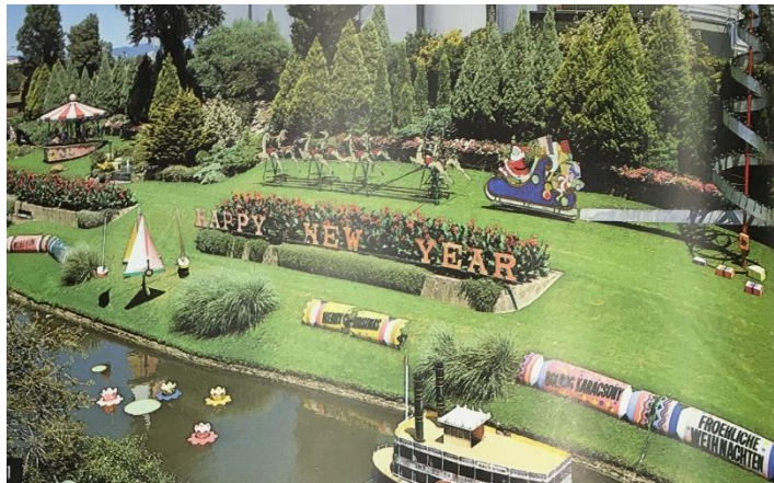
Easter (1980) (left) and Christmas (1981) (right) displays

Source: SABCo Annual Reports 1980 and 1982