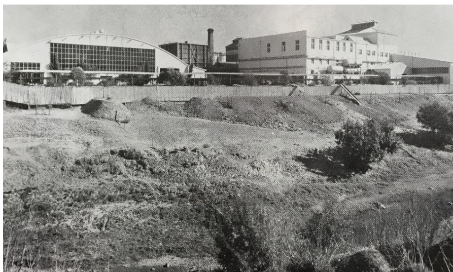
Work on the garden begins, with dirt brought in to fill and level out some of the hollows in the bank, 1959