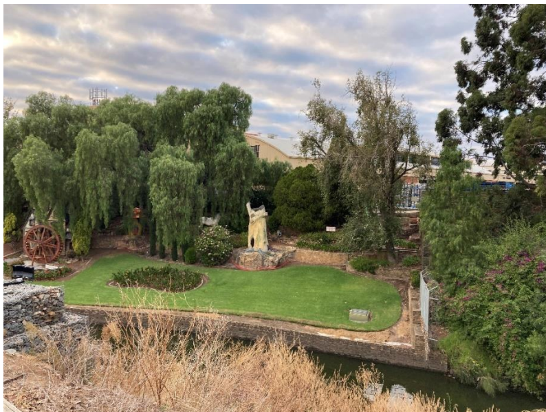
West End Brewery Garden showing the tree stump and kidney-shaped garden bed