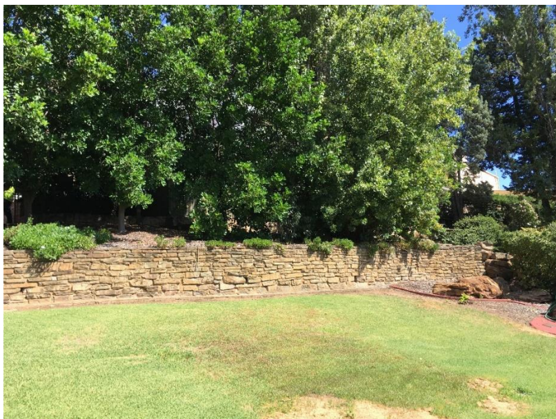
West End Brewery Garden showing the stone retaining wall to rear garden bed