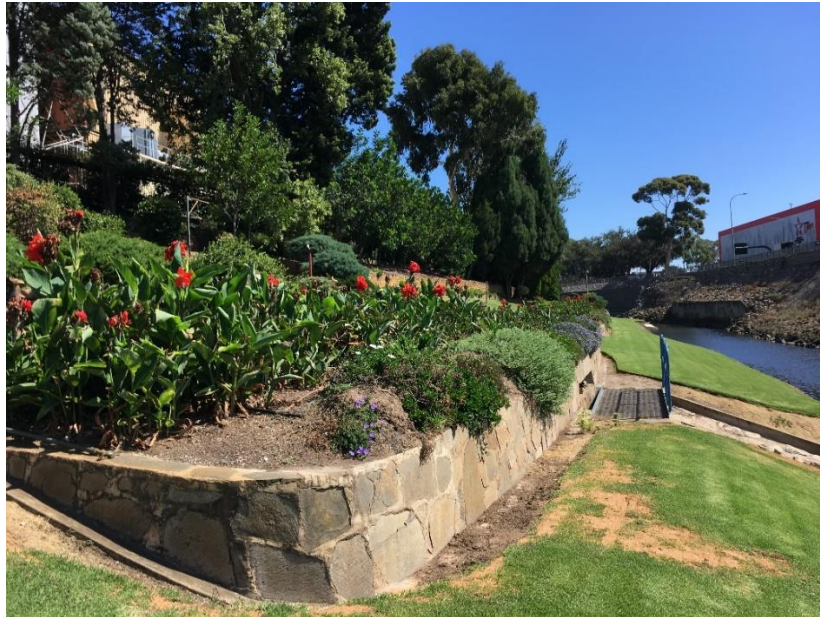
West End Brewery Garden showing the stone retaining wall to the rectangular beds

(River Torrens/Karrawirri Parri (adjacent Adam Street Thebarton))