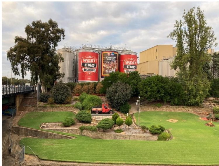
West End Brewery Garden showing the brewery truck and rock garden that was previously the grotto

(River Torrens/Karrawirri Parri (adjacent Adam Street Thebarton))