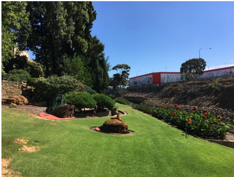
West End Brewery Garden showing the lawns, canna lilies and 'deer seated on a rock' model and background of trees in rear garden bed

(River Torrens/Karrawirri Parri (adjacent Adam Street Thebarton))