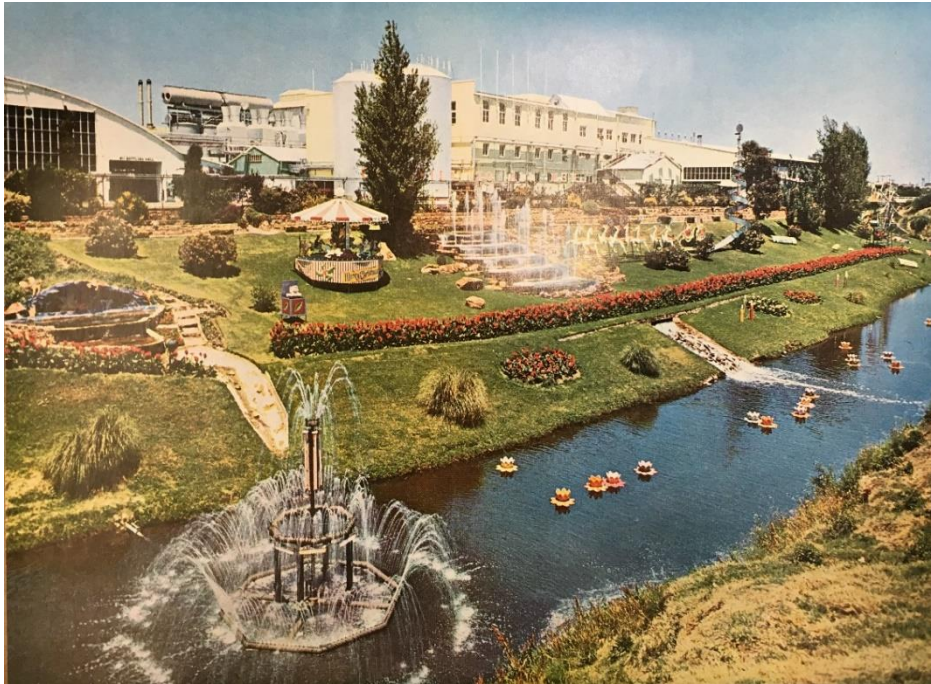
Brewery Garden Christmas Display 1968, note the cascade, grotto and fountains in the river and cascade