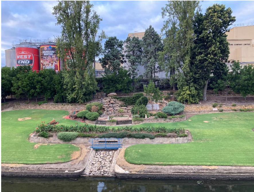
West End Brewery Garden pond

(River Torrens/Karrawirri Parri (adjacent Adam Street Thebarton))