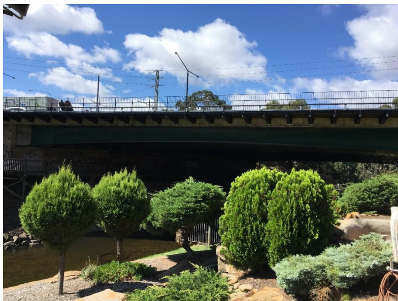
West End Brewery Garden showing an example of the conifers in the rockery gardens