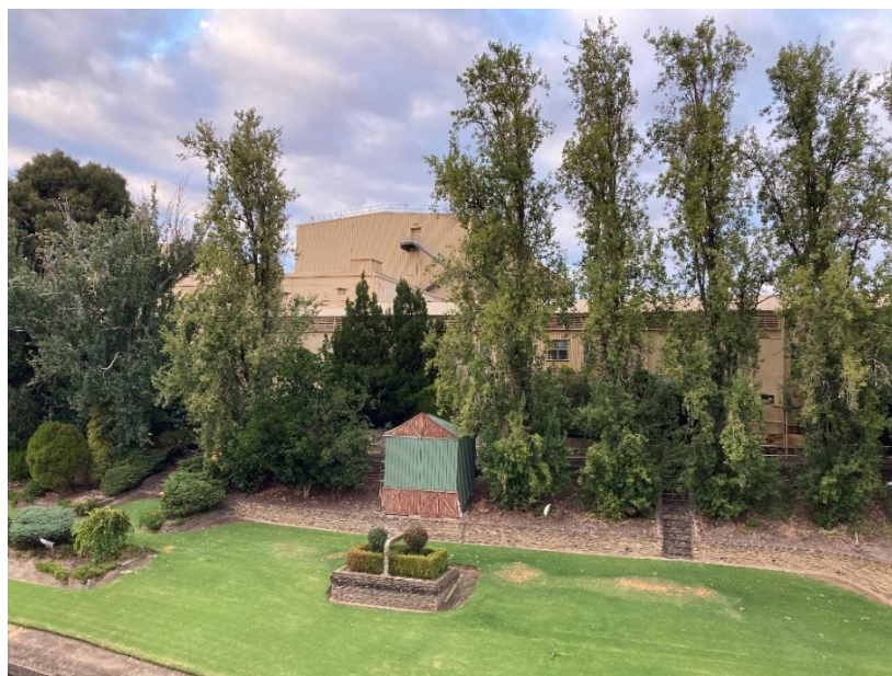
West End Brewery Garden showing the 'Inn' from the Nativity, the basket or crown shaped garden bed and one of the stairways that dissect the rear garden bed