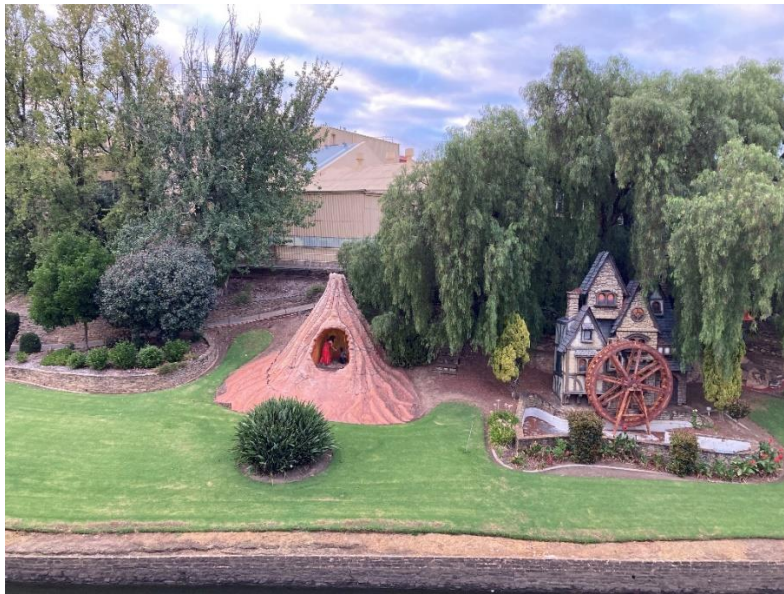
West End Brewery Garden showing 'Vulcan's' volcano, the feature bird of paradise plant, and mill with rockery garden

(River Torrens/Karrawirri Parri (adjacent Adam Street Thebarton))