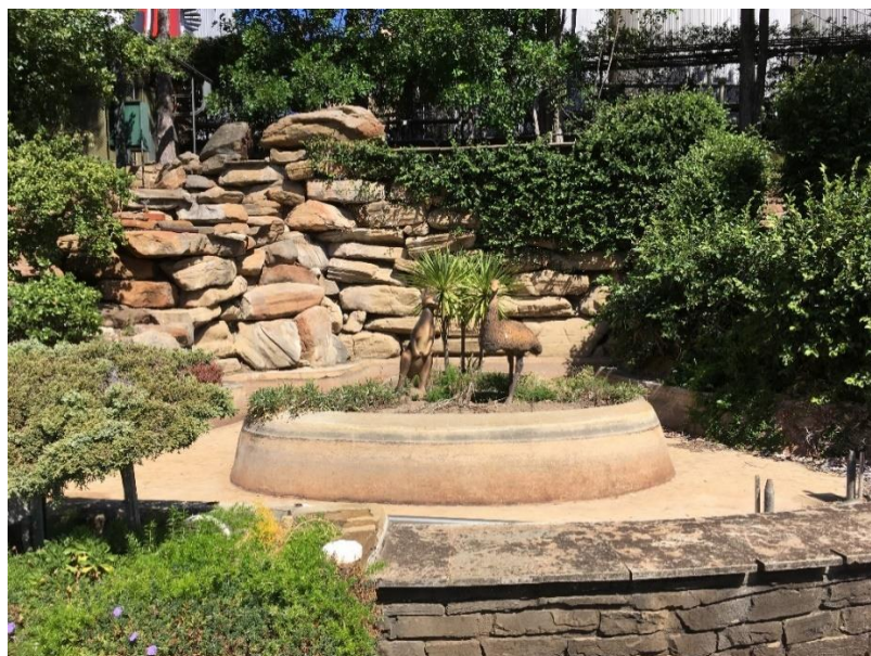
West End Brewery Garden showing the pond (now dry) that was once a part of the cascade, with central island with kangaroo and emu figures