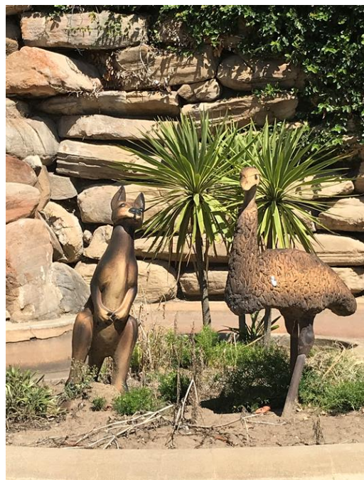
West End Brewery Garden showing examples of the figures in the garden