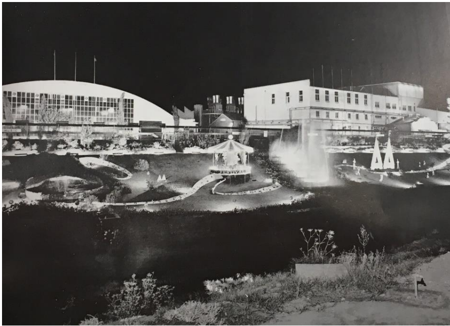
Display for the 1962 Adelaide Festival of Arts, note the completion of the cascade (mid right)