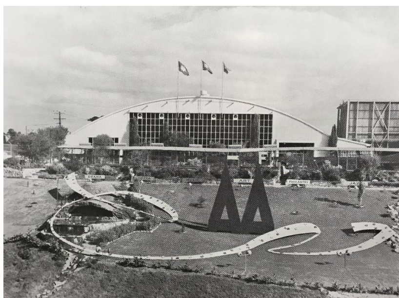
Display for the first Adelaide Festival of Arts, 1960, incorporated the Festival logo, note the growth of the plants and improvements to the lawn