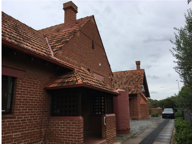
Western elevation looking south, note the porch providing direct access to scullery