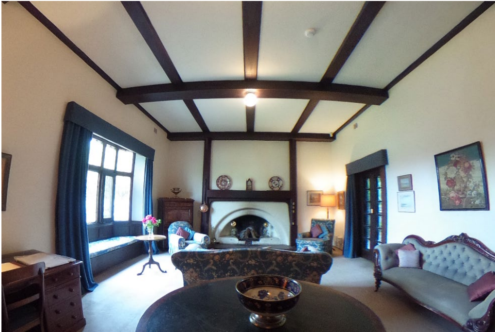
Billiard room, note the window seat, fireplace and surround, door to verandah, detail to ceiling.