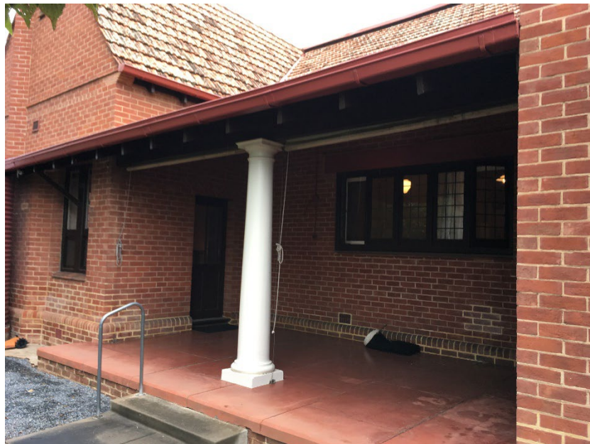
Part western elevation showing the verandah between master bedroom and second bedroom. Both bedrooms have access to the verandah, while the dressing room overlooks it. Note column, and red-brick plinth with curved red-brick capping.