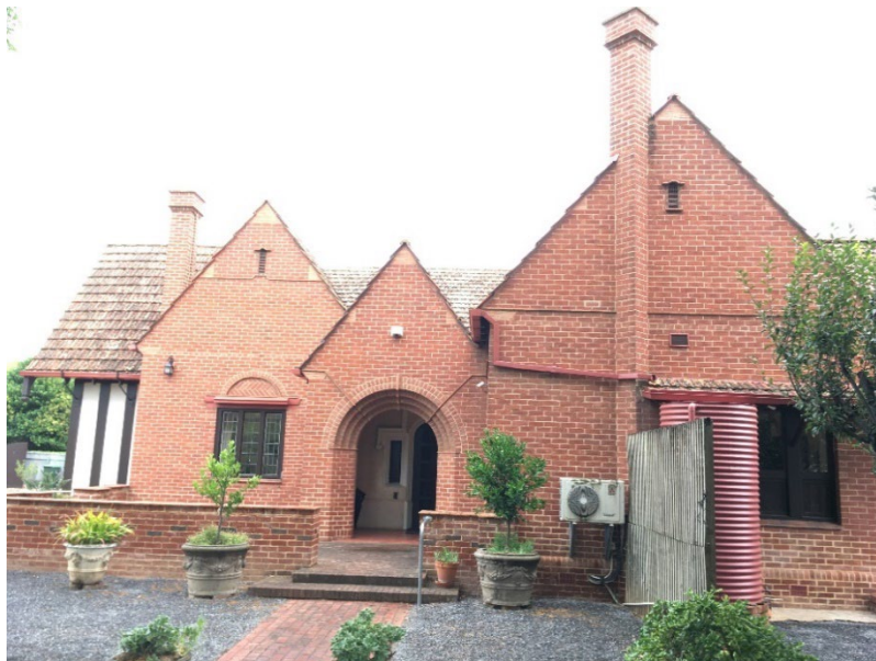
Part east elevation showing main entrance, note patio/terrace with stepped-brick detailing to arch, triple gables with Roman brick detailing, and arch feature over window.

NOTE: All images are from DEW Files unless otherwise specified and where taken during the site visit on 22 March 2022.