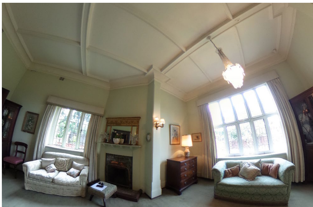
Drawing room, note the windows and detailing to ceiling