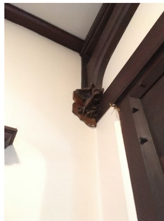
Detail, example of a gargoyle and timberwork in hallway.