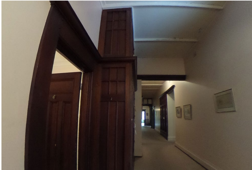
Passage showing partial detail linen cupboards, door surrounds, etc