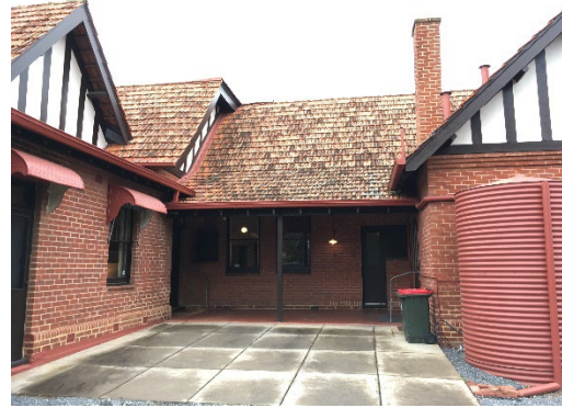
Views of the rear of the house, showing roof forms, verandah and imitation half-timbering to gables.