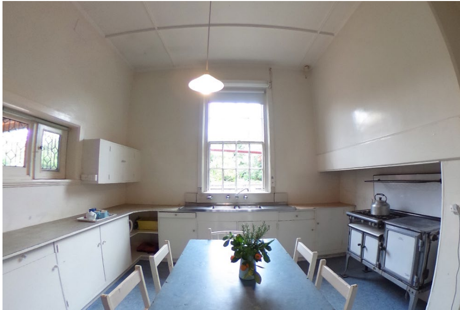
Kitchen, note natural lighting.