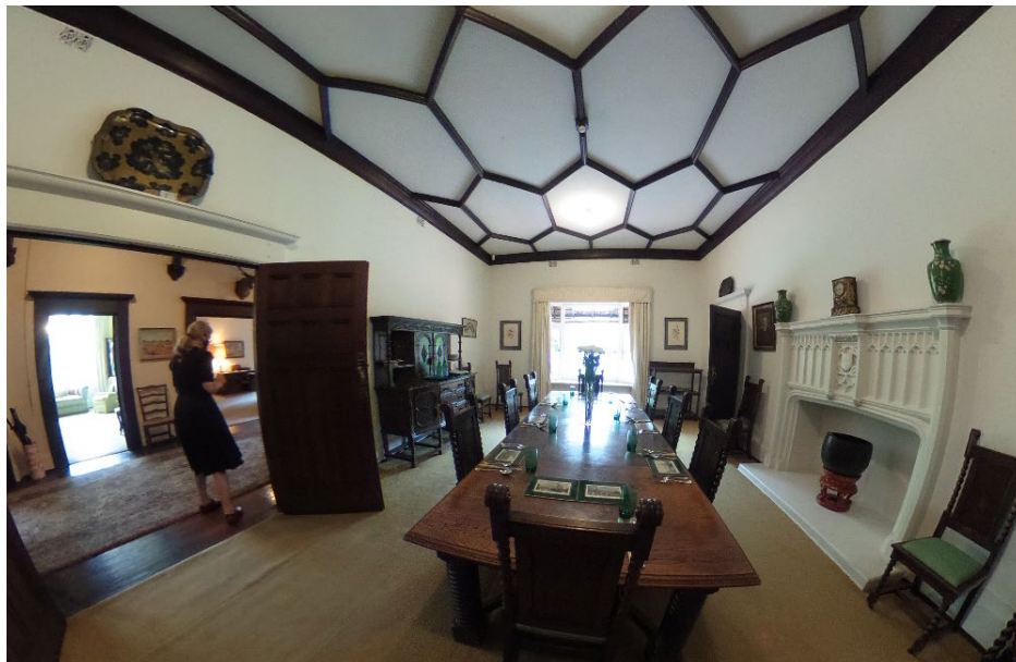
Dining room, note detailing to ceiling and fireplace.