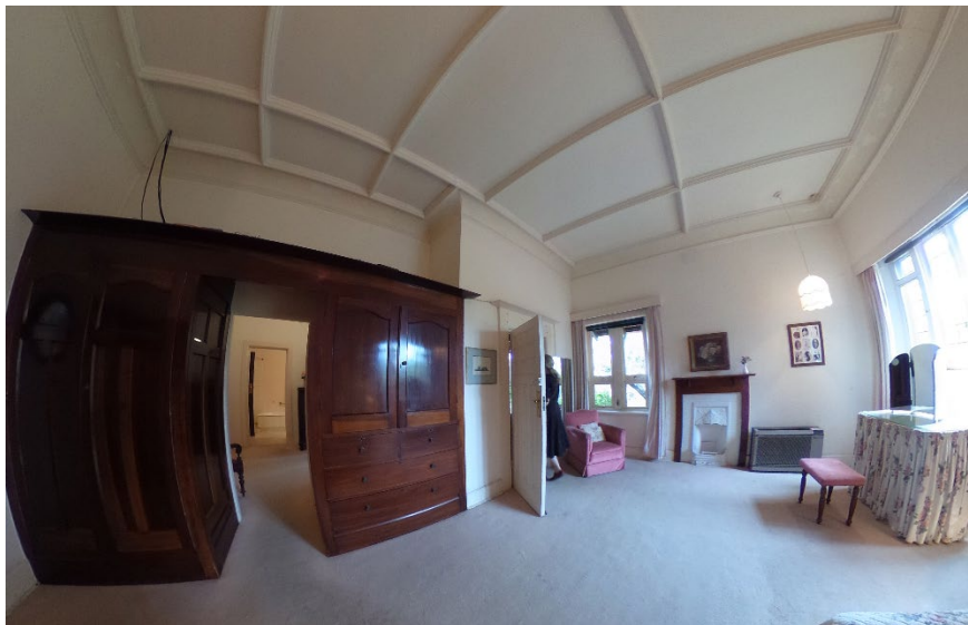
Master bedroom showing cabinetry to dressing room, door to verandah, fireplace, etc.