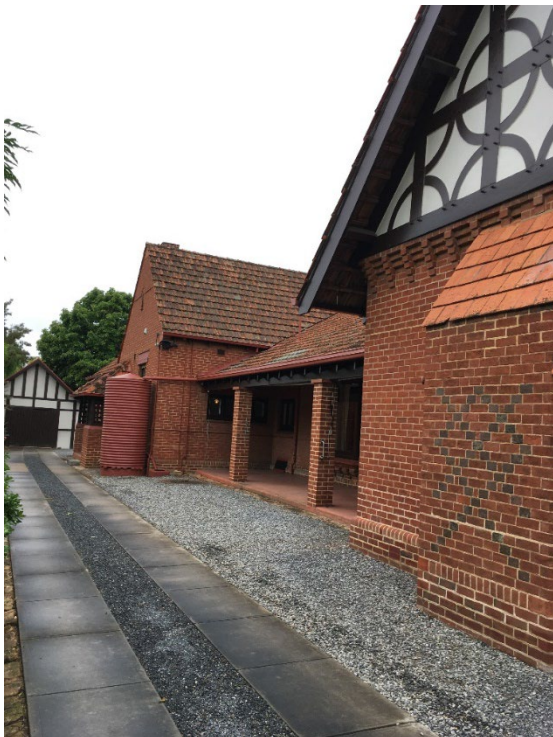
Western elevation looking north, showing garage and verandah accessed from billiard room and over which the dining room and kitchen have views. Note the curved imitation half-timbered bracing, and stepped and patterned brickwork to chimney.