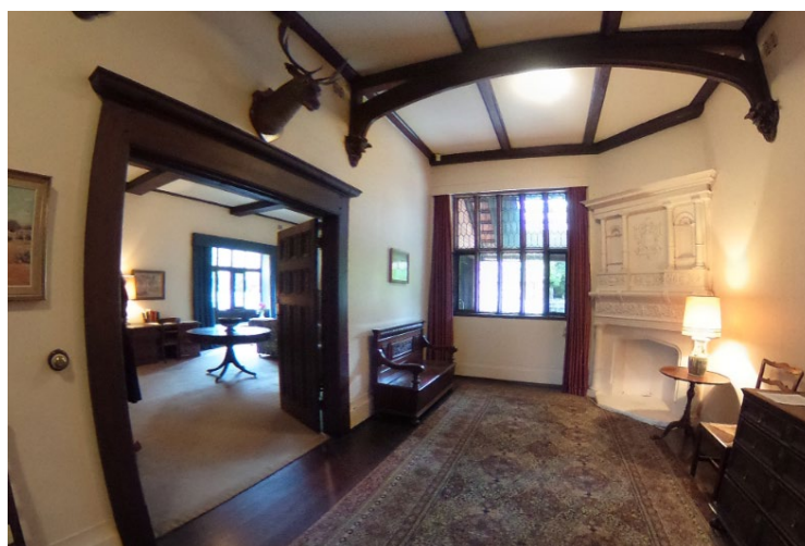
Hallway, note timber beams, floor, surrounds to door (to billiard room), fireplace, multi-pane windows.