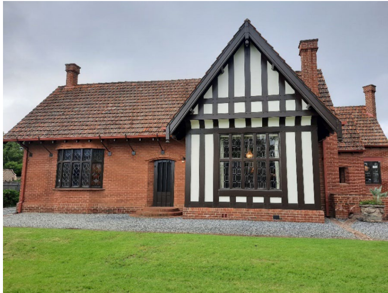
Southern elevation (facing Fitzroy Terrace), note domestic-scale, covered soffit between jettied gable and wall, imitation half-timbering, chimneys, eave brackets, and terra cotta roof tiles.