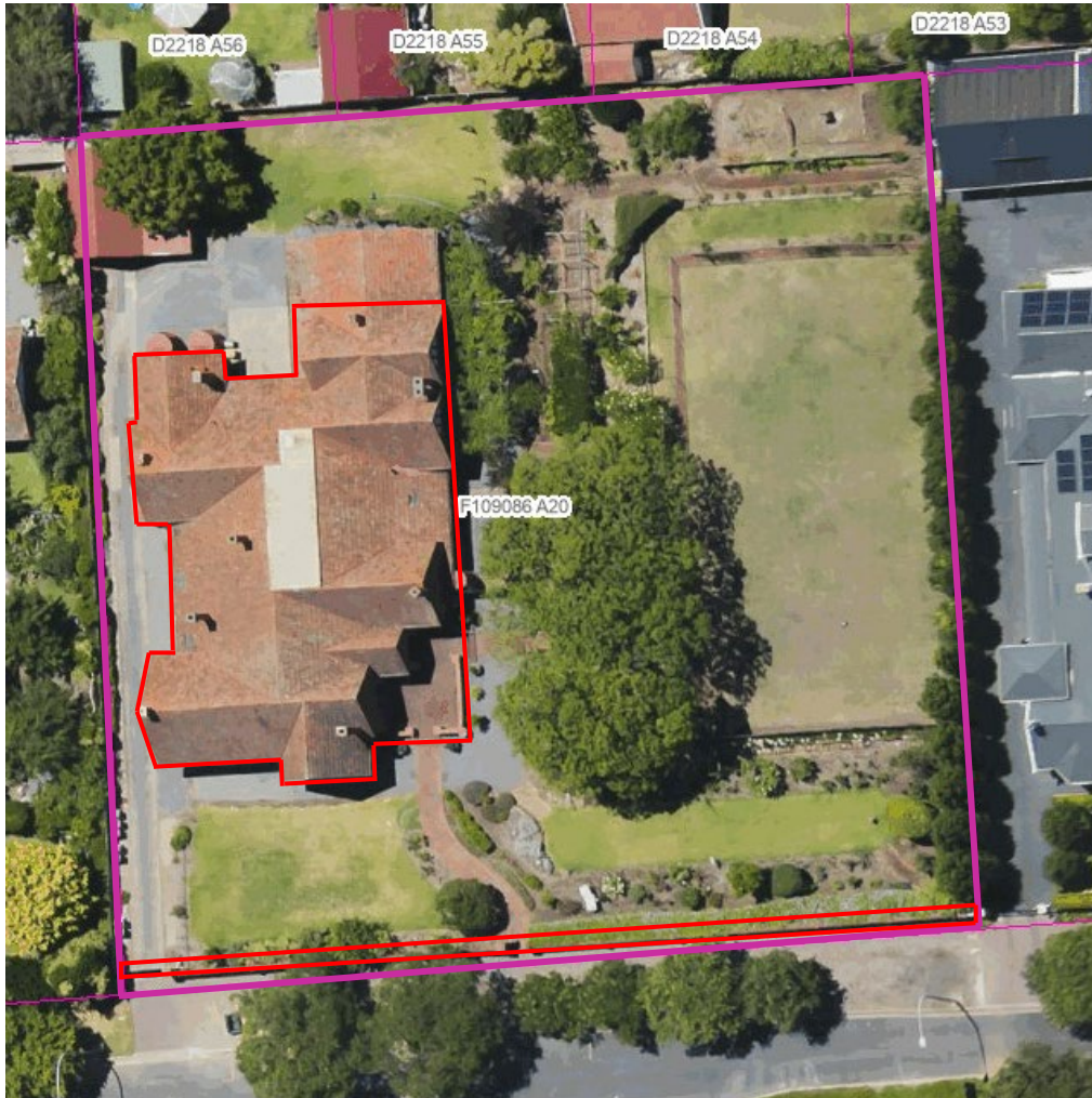
Dwelling (formerly 'Woodgate') (CT 5781/436 F109086 A20 Hundred of Yatala)