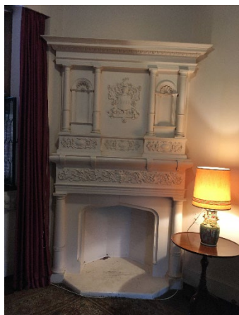
Detail, bespoke designed fireplace for the hall (painted concrete).