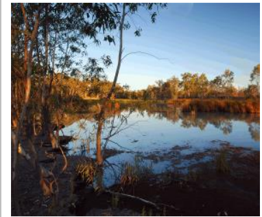
Trend in conservation and monitoring activities

Acting to conserve threatened ecological communities helps to preserve the ecosystems we all rely on. Threatened ecological communities require targeted conservation activities such as habitat restoration and protection, and the control of threats such as weeds, pests, inappropriate fire regimes and grazing practices. Improvements to land and water-use practices are also required. Monitoring programs are used to ensure our conservation activities are effective.