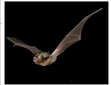
Trend in conservation and monitoring activities

Acting to protect threatened species helps to preserve the ecosystems on which we all rely. Threatened species require targeted conservation activities such as reintroduction programs, habitat restoration and protection, and control of threats such as weeds and pest animals. Monitoring programs help to assess whether the prospects of our threatened species are improving and ensure that our conservation activities are effective.