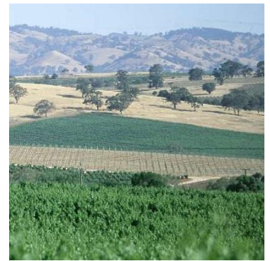
Regional trends in the alignment of the Planning Strategy and regional NRM plans

The Planning Strategy is made up of 8 volumes defined by geographical regions; a volume for metropolitan Adelaide and 7 volumes for regional South Australia. The Planning Strategy has been progressively developed since 2007 in consultation with regional NRM boards. It addresses environmental assets and systems, hazards and climate change through planning initiatives aimed to align with, or strengthen other natural resource management legislation and policies.