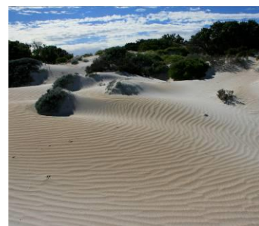
Trend in coastal dune extent and condition

The health of our coastal dunes relies on the management of recreational activities, stock grazing and coastal development.