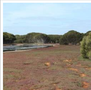
Trends in saltmarsh extent and condition

The health of saltmarsh habitats relies on the management of recreational activities, coastal development, stock grazing pressure and water quality within catchments.