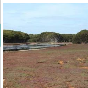
Trends in saltmarsh extent and condition

The health of saltmarsh habitats relies on the management of recreational activities, coastal development, stock grazing pressure and water quality within catchments.