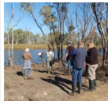
Trends in the number of NRM learning activities

For more information on regional programs to improve awareness of natural resource management issues and priorities, please refer to the NRM Board website .