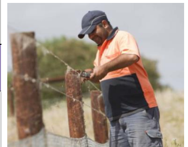
Trend in involvement of Aboriginal people in natural resource management

In South Australia, the unemployment rate of Aboriginal people was about three times higher than for non-Aboriginal people between 2005-11. The Government of South Australia aims to increase Aboriginal employment in all public sector agencies to at least 2 per cent across all levels. DEWNR has an additional target of at least 3 per cent.