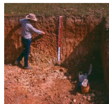
Trend in soil organic carbon storage

Carbon is also stored in native vegetation, as reported here .