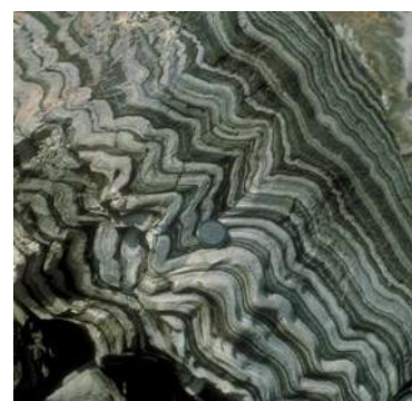
Trends in the condition of geological features

The condition of geological heritage sites may be diminished by inappropriate land use and development, or unrestricted access to vulnerable landforms. It is important to note the value of some features can be enhanced by mining excavation or civil constructions as well.