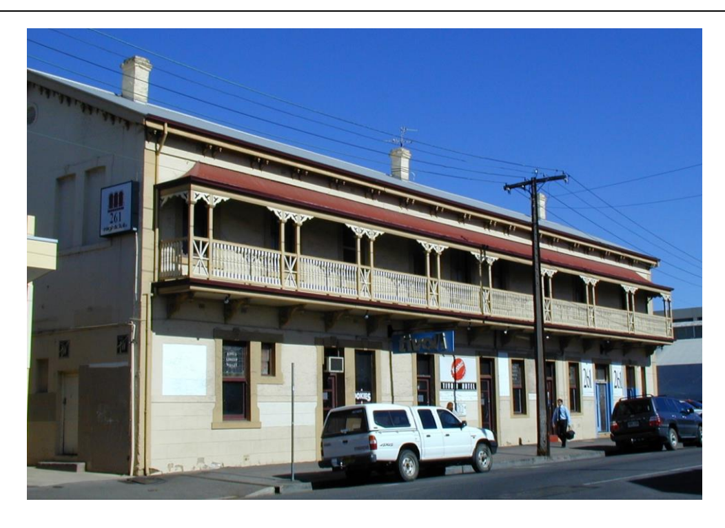
Tivoli Hotel, Pirie Street frontage