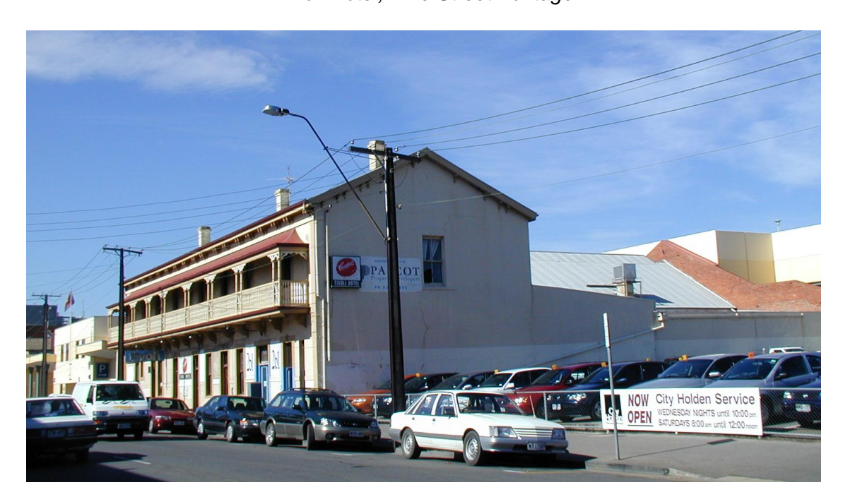
Tivoli Hotel, with roof and rear wall of theatre/ballroom behind