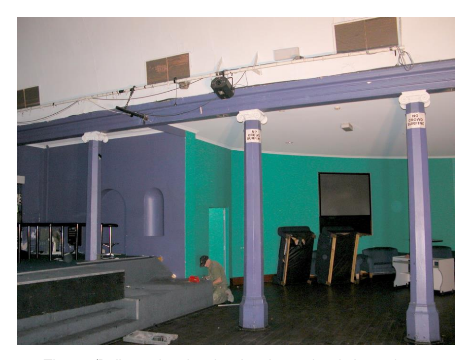
Theatre/Ballroom interior showing decorative timber columns