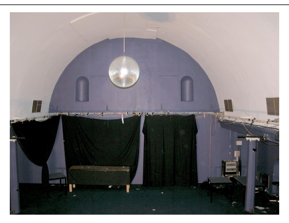
Theatre/Ballroom interior showing barrel vaulted ceiling