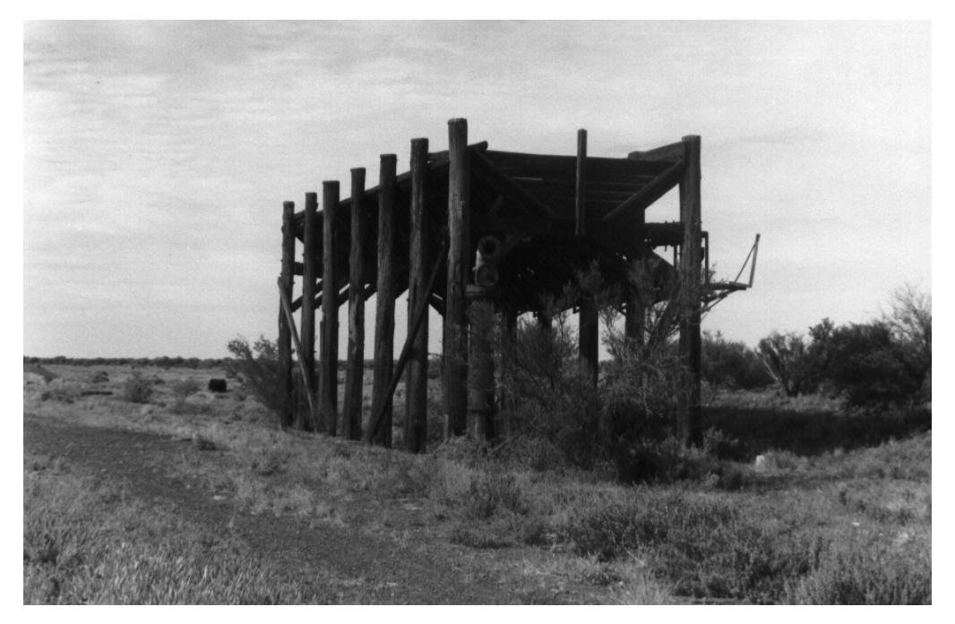
Coal Bins, Abminga Railway Siding Complex