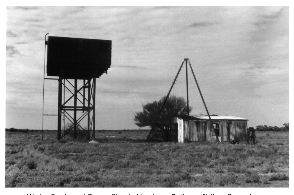
Water Tank and Pump Shed, Abminga Railway Siding Complex