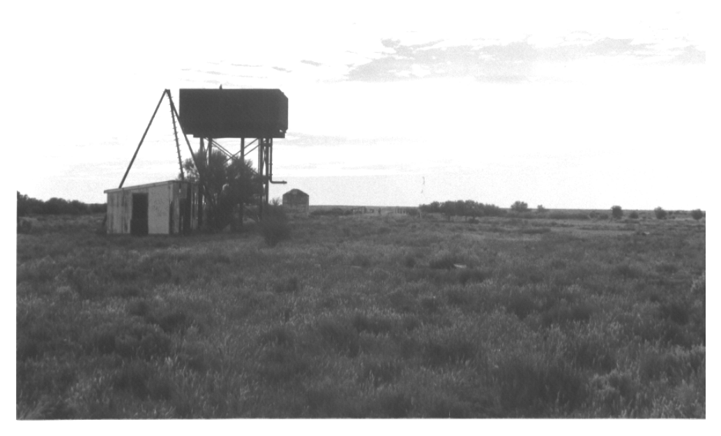
General view of Abminga Railway Siding Complex