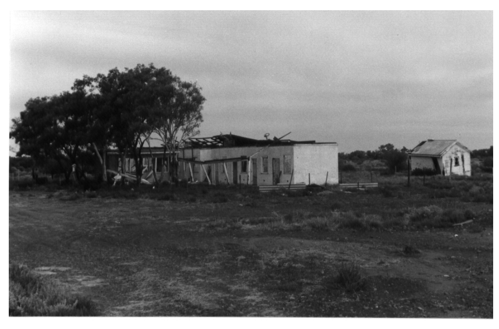
Fettlers' Cottages, Abminga Railway Siding Complex