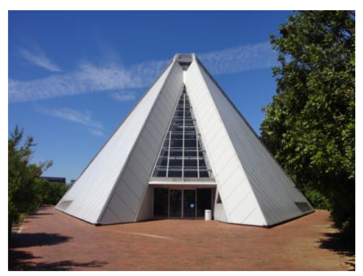
Bicentennial Conservatory, Adelaide Botanic Garden (From the North)