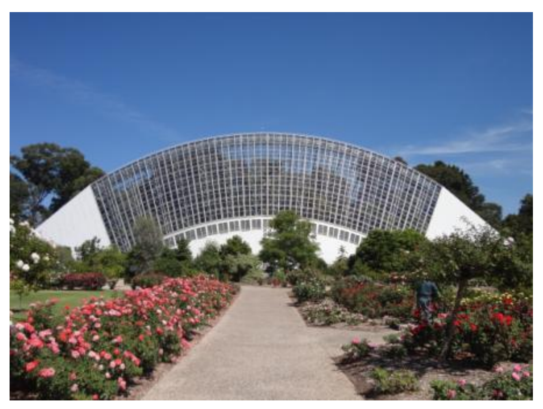
Bicentennial Conservatory, Adelaide Botanic Garden (From the East)