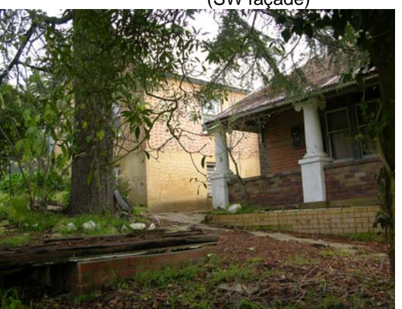
Twentieth Century addition looking south west towards rear of main house