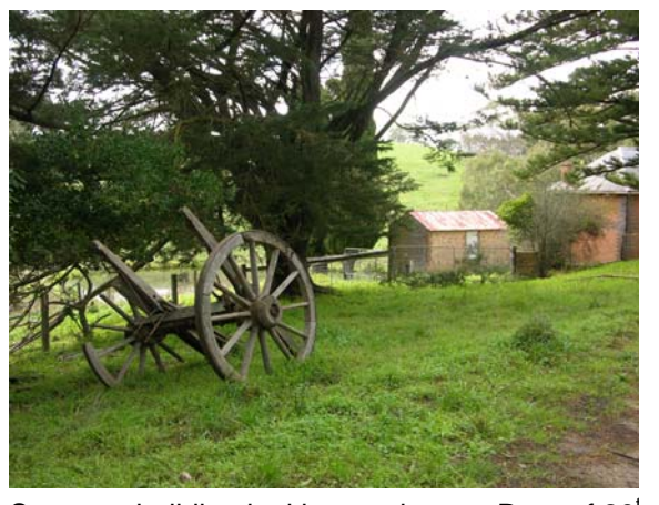
Stone outbuilding looking north east. Rear of 20<sup>th</sup> Century addition on right.