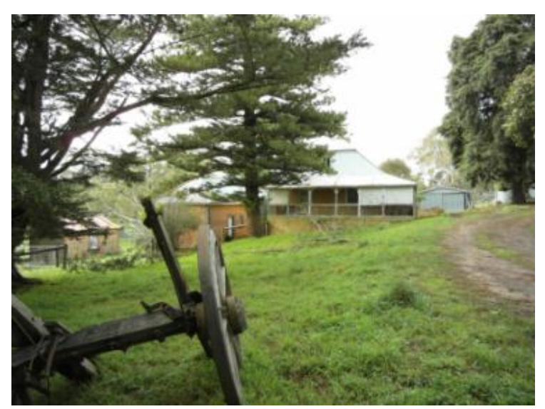
Former JF Paech house