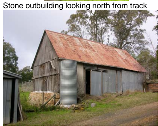
Slab Barn No 1 (looking south)