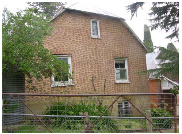
Eastern façade looking west from track