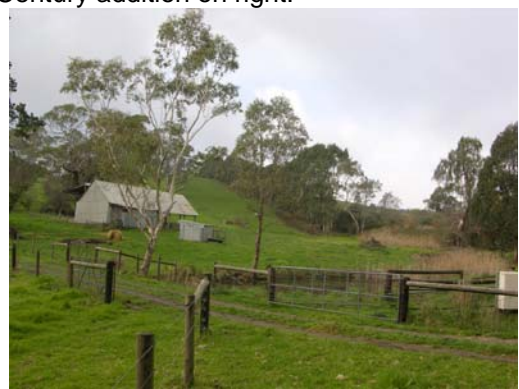
Slab /cgi Barn No 2 looking east from track