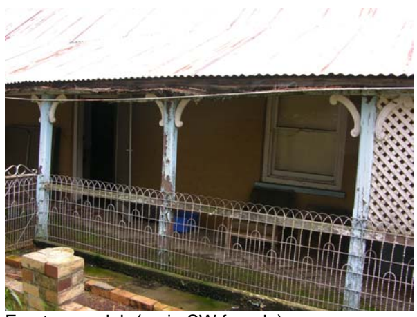
Front verandah (main SW façade)