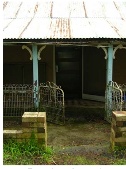
Front door of 1840s house (SW façade)