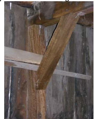
Detail of Slab Barn No 1 interior