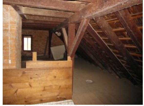
Smokehouse in loft space of house