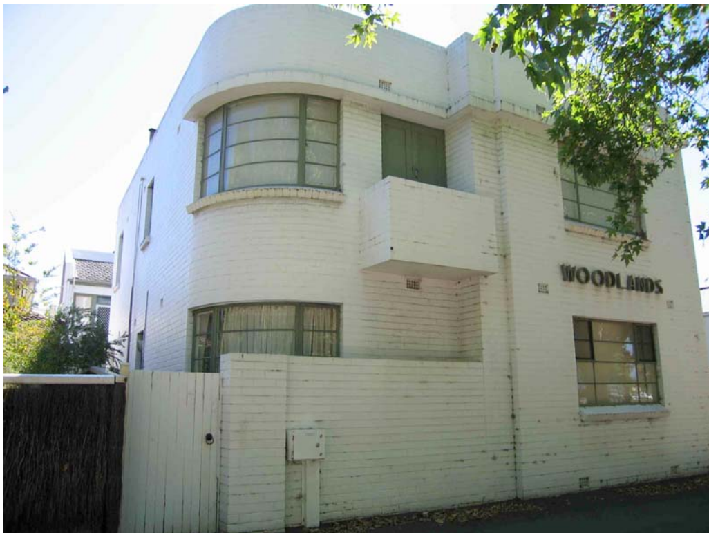
Woodlands Apartments looking west