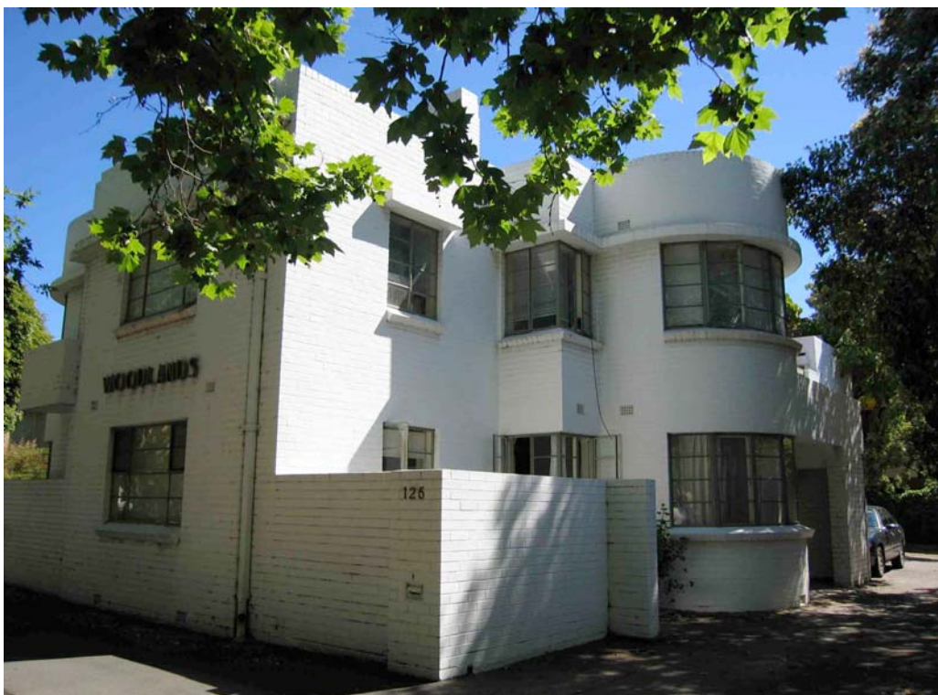
Woodlands Apartments looking south-west