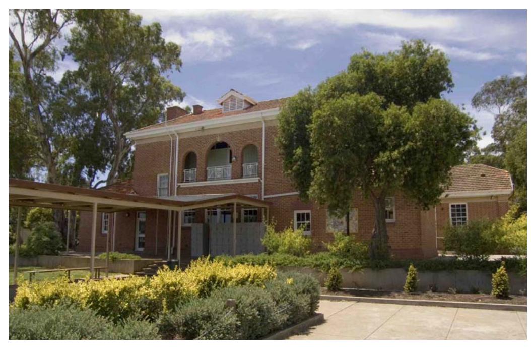
Original School Building/Headmaster's Residence, Urrbrae Agricultural High School