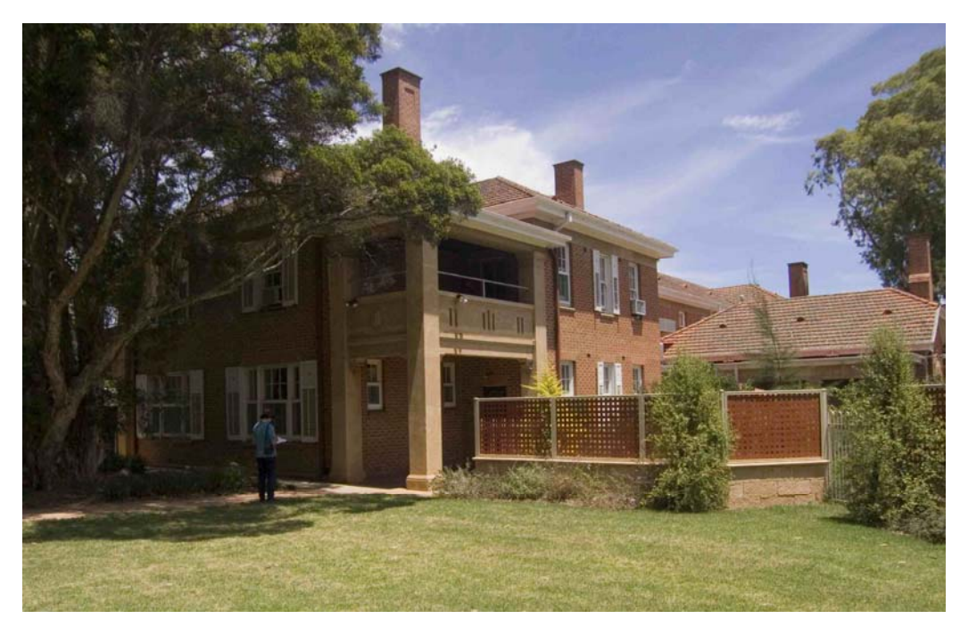
Original School Building/Headmaster's Residence, Urrbrae Agricultural High School (looking south-west from Fullarton Road)

Original School Building/Headmaster's Residence, Urrbrae Agricultural High School 505 Fullarton Road FULLARTON 5062