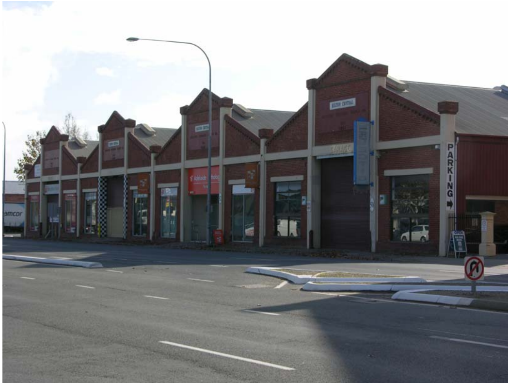
Buildings 1, 2, 3 and 4 – former garages Southern elevation looking north-west from Sir Donald Bradman Drive (June 2012)

Former Adelaide Electric Supply Co Ltd Buildings - four former garages and two double storey office/workshop buildings 32-56 Sir Donald Bradman Drive, Mile End 5031