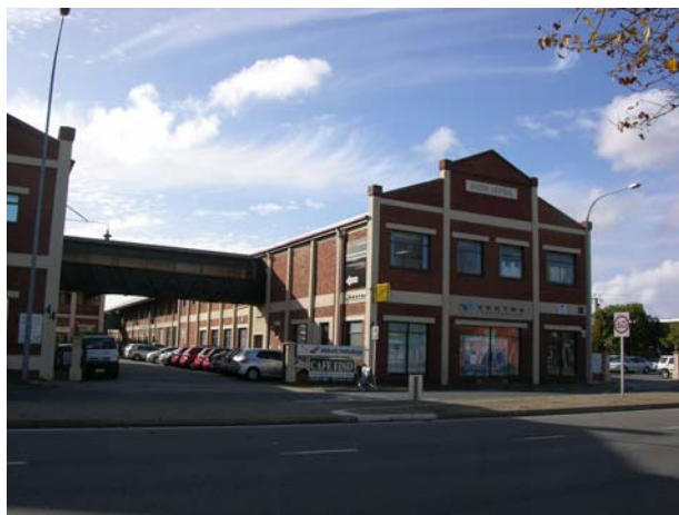
Building 6 – former offices / workshops Southern elevation (looking north) (June 2012)