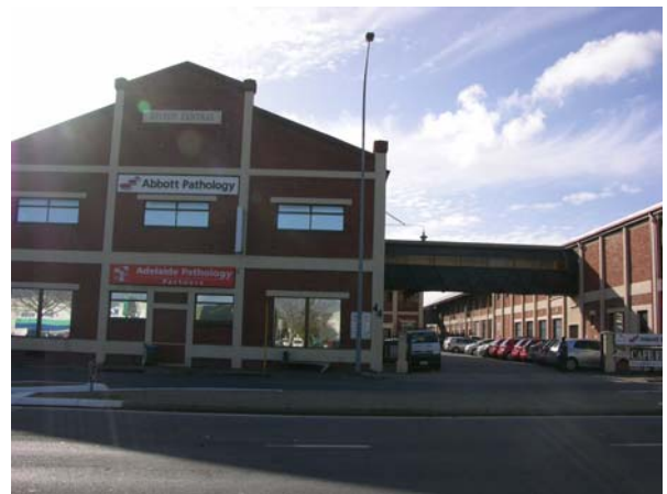
Building 5, - former offices / workshops Southern elevation (looking North) (June 2012)