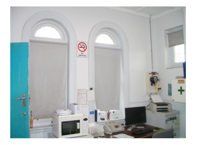
Former Torrens Lake Police Station - interior of former charge room