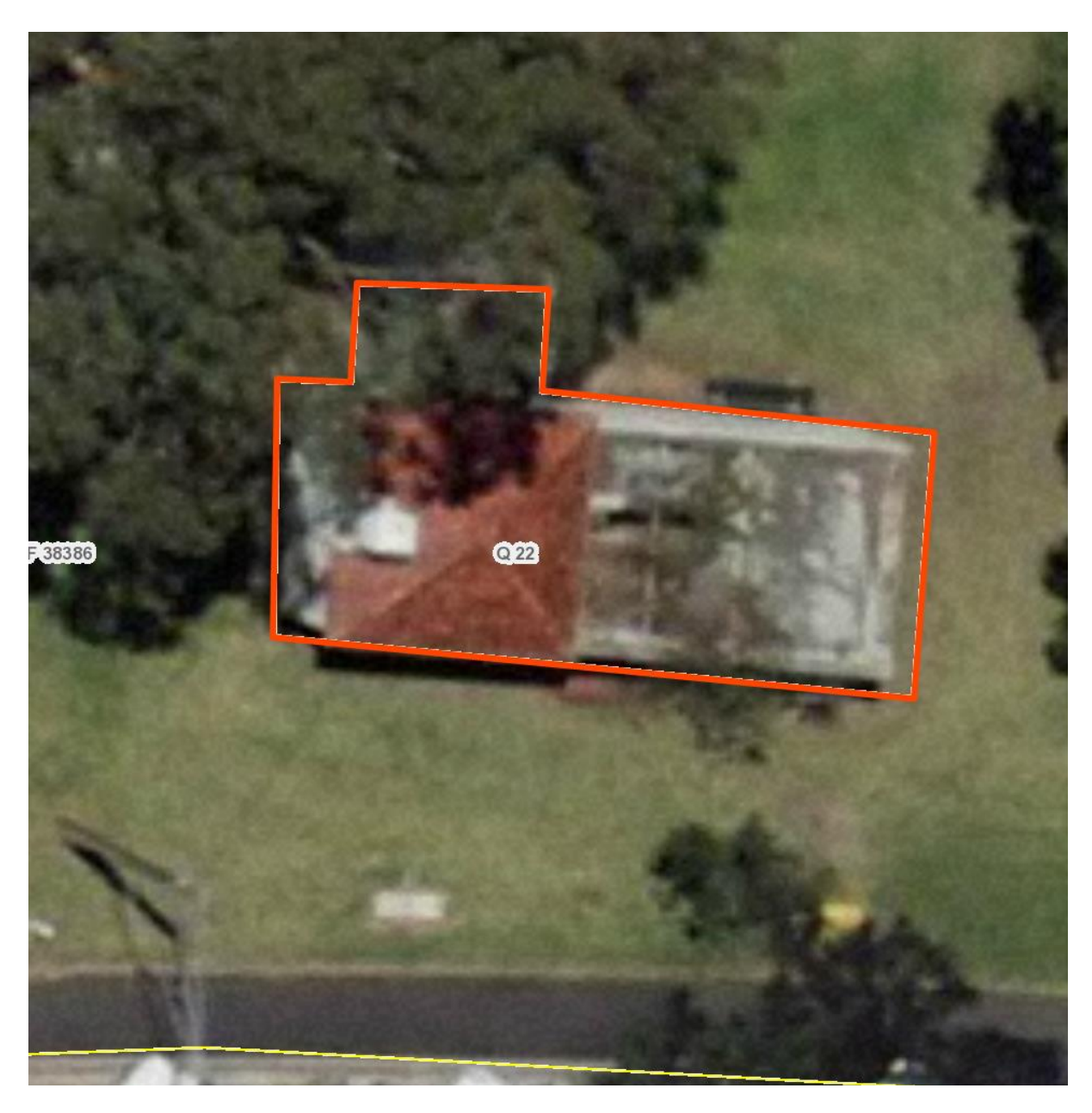
Former Torrens Lake Police Station (Note: Portico obscured by trees) Site plan generally indicating the important elements and features of the place (outlined in red)