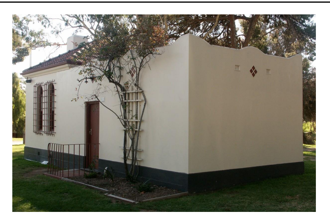
Former Torrens Lake Police Station - View to the north-west showing exterior of the wall to the exercise yard and holding cell with entry to the yard.