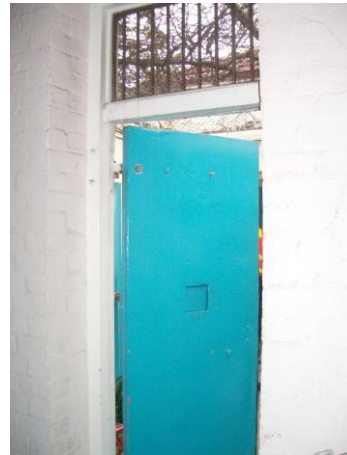
View to west from the holding cell, now store to the exercise yard