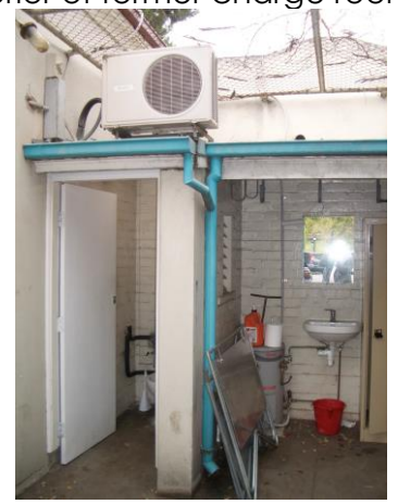
View north from the exercise yard showing toilet