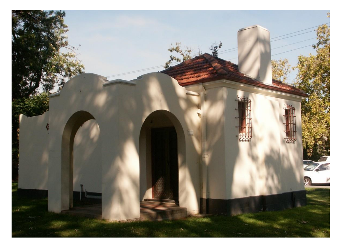
Former Torrens Lake Police Station – view to the south-east