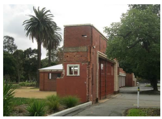
Entrance gates from south showing turnstile building and office in background