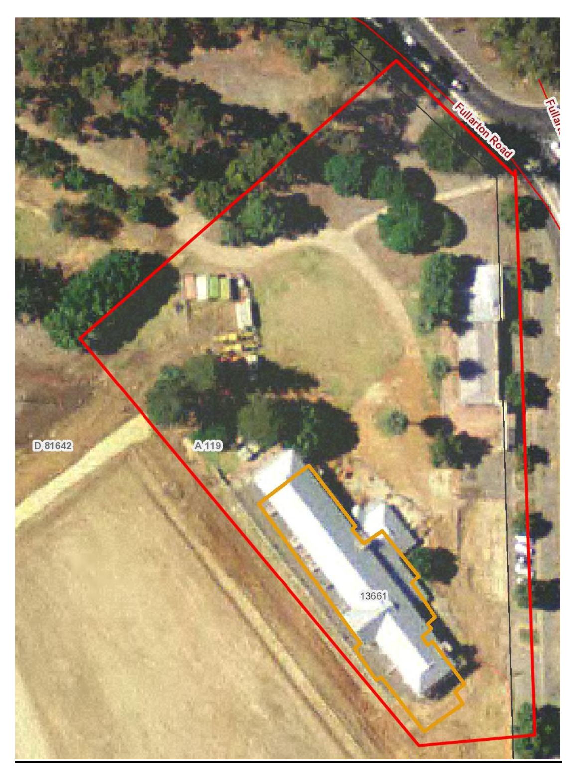
Victoria Park Racecourse (North East Precinct) - Site Plan [Generally indicating the important elements and features of the place (outlined in red)]