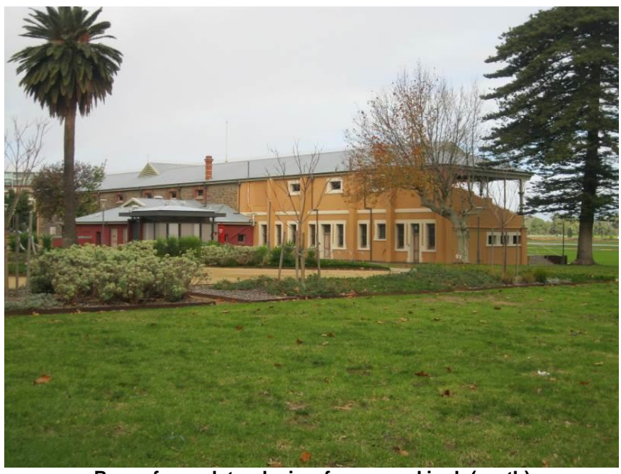
Rear of grandstand, view from near kiosk (north)