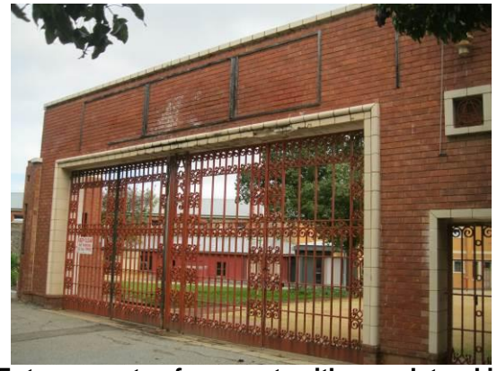
Entrance gates from east, with grandstand in background