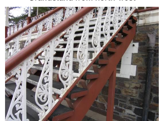
Stairs to grandstand