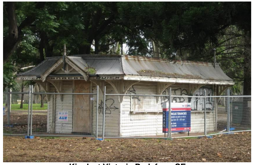
Kiosk at Victoria Park from SE