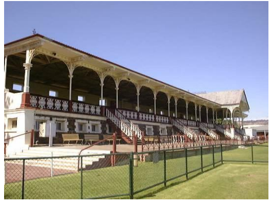
Grandstand from north-west