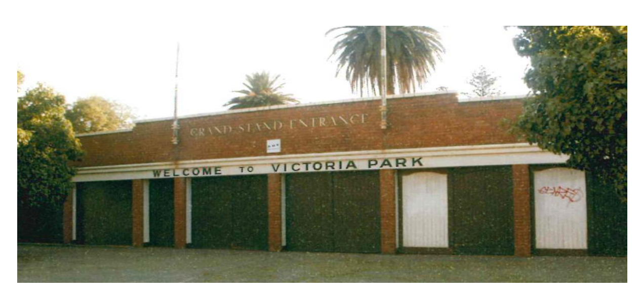
Turnstile building from east