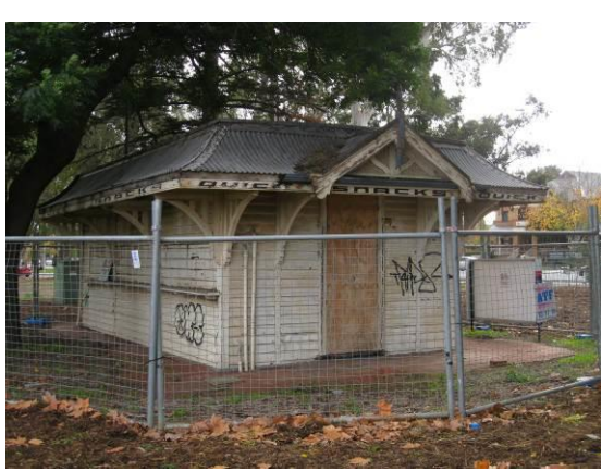
Kiosk at Victoria Park from SW