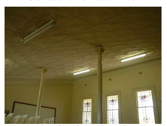
Interior of grandstand