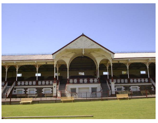
Grandstand from south-west