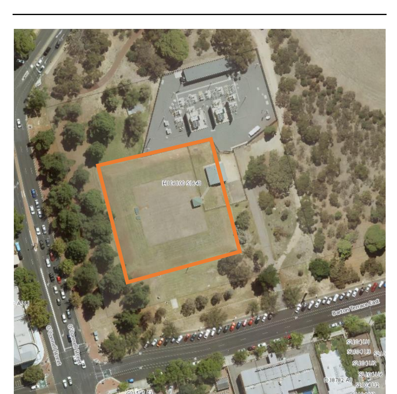
NORTH ADELAIDE SERVICE RESERVOIR Corner O'Connell Street & Barton Terrace, North Adelaide Site plan generally indicating the boundary and important components of the place.