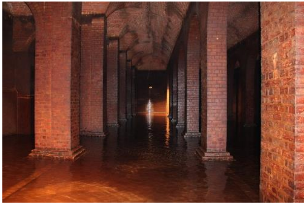
North Adelaide Service Reservoir interior