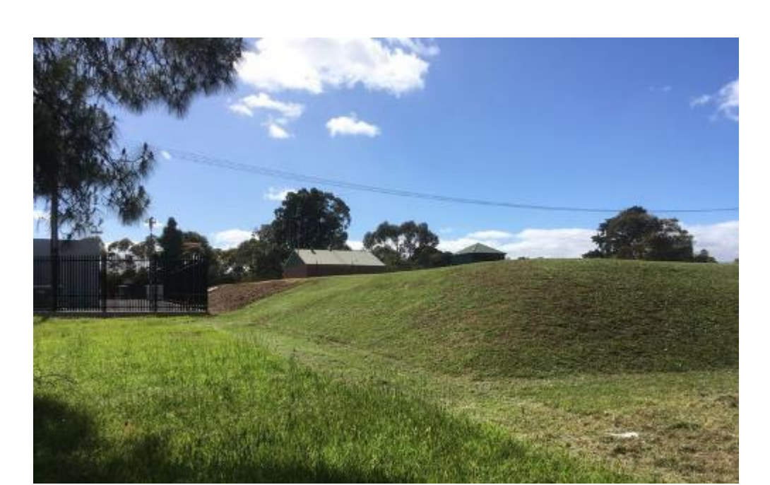
North Adelaide Service Reservoir mound