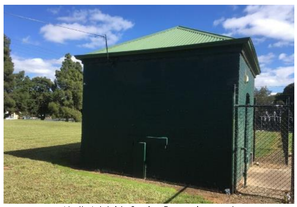
North Adelaide Service Reservoir pump-house