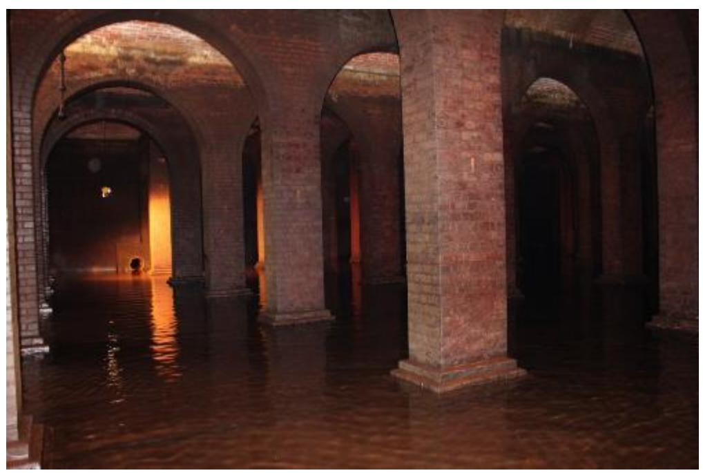
North Adelaide Service Reservoir interior