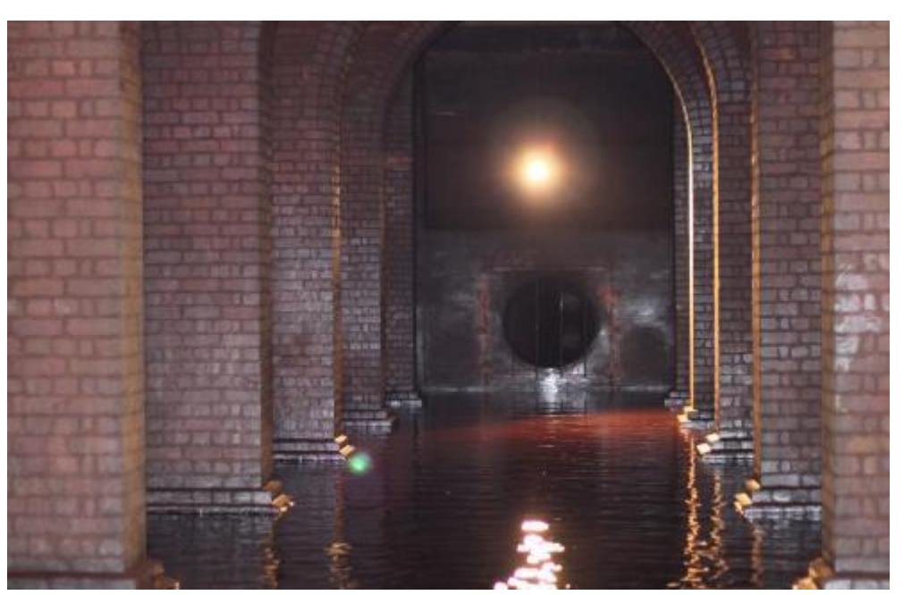
North Adelaide Service Reservoir interior