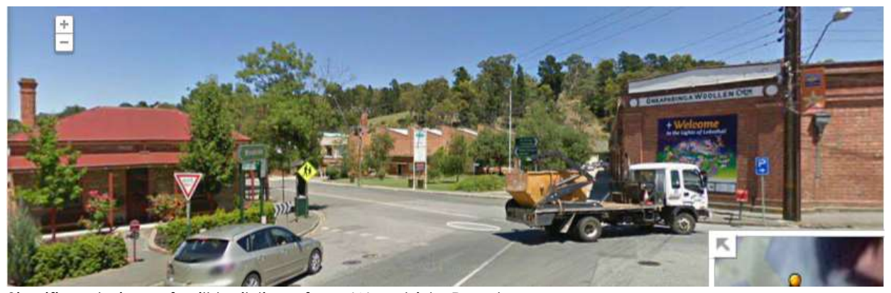
Significant view of mill buildings from Woodside Road