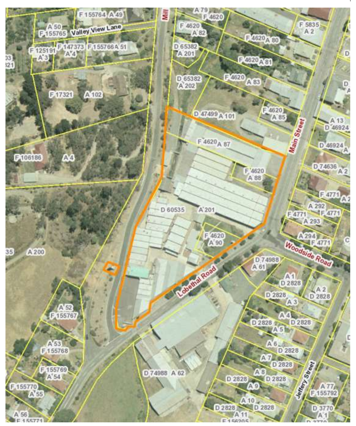
Site plan of Lobethal Woollen Mill generally indicating important features and elements of the place 26414 outlined in orange