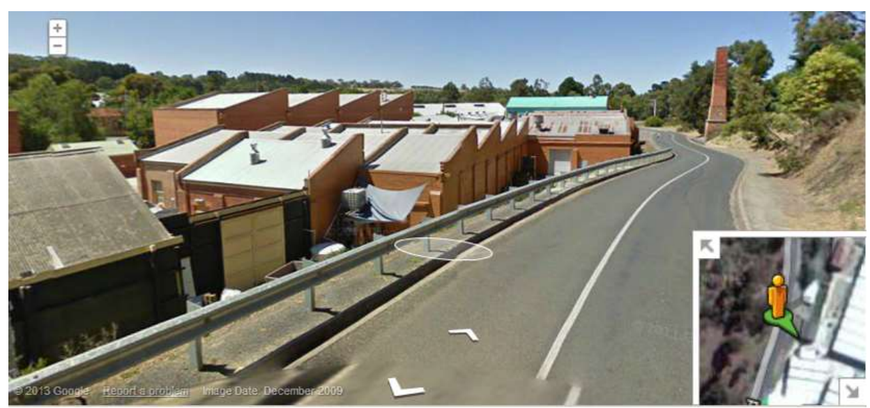
Significant view of surviving mill buildings from Mill Road