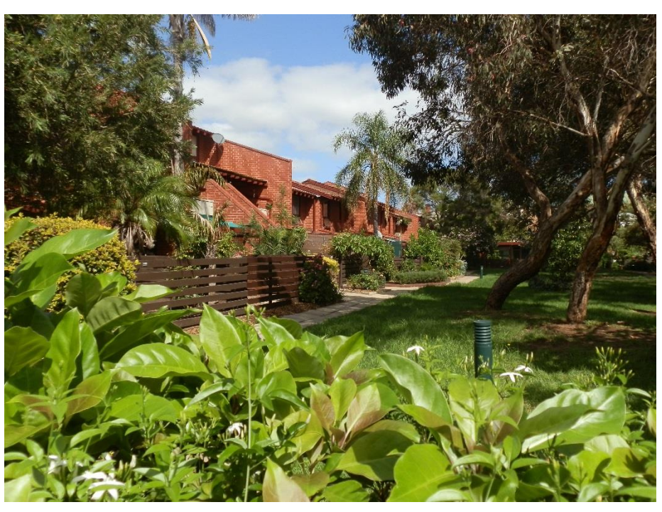
Manitoba Housing Complex, Carrington Street, Adelaide - Rear of Carrington Street units, viewed from central space showing their private gardens (looking south) (S Marsden, March 2014)

Manitoba Housing Complex 228-256 Carrington Street, 7-29 Hume Lane and 1-32 Regent Street North, Adelaide