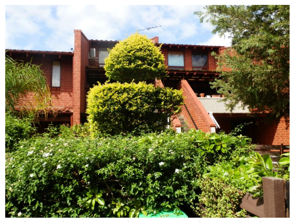
Manitoba Housing Complex, Carrington Street, Adelaide - Rear of Carrington Street units, viewed from central space showing their private gardens (looking south) (S Marsden, March 2014)