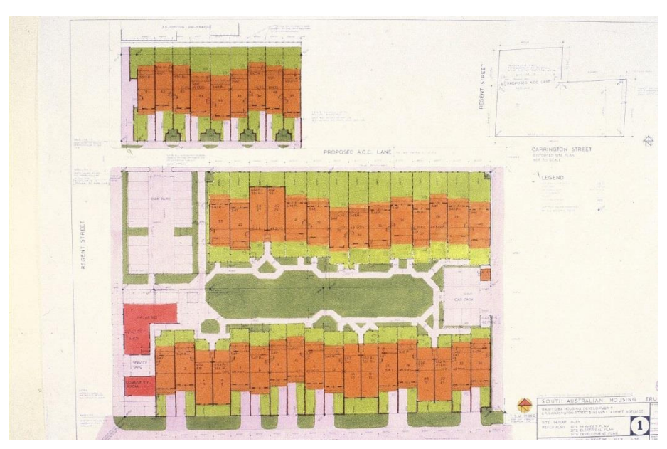
Manitoba Housing Complex, Carrington Street, Adelaide – Plan of Medium Density site: Layout Plan [1974] (SAHT, MAN 0002)

[Note, the section on the northern side of Hume Lane (aka Proposed A.C.C. Lane), which was built as Stage 2 of Manitoba, is not included as part of this Place]