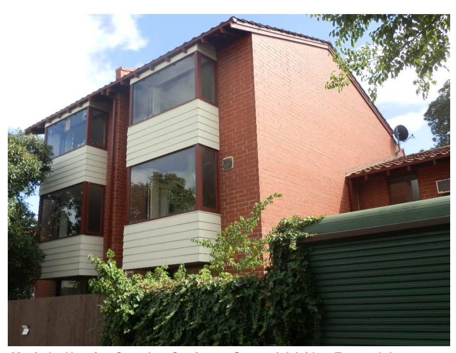
Manitoba Housing Complex, Carrington Street, Adelaide – Two and three storey units on Carrington Street (looking north) (, March 2014)