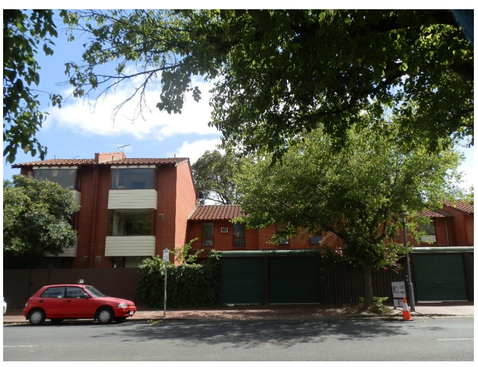
Manitoba Housing Complex, Carrington Street, Adelaide – Two and three storey units on Carrington Street (looking north)

Manitoba Housing Complex 228-256 Carrington Street, 7-29 Hume Lane and 1-32 Regent Street North, Adelaide