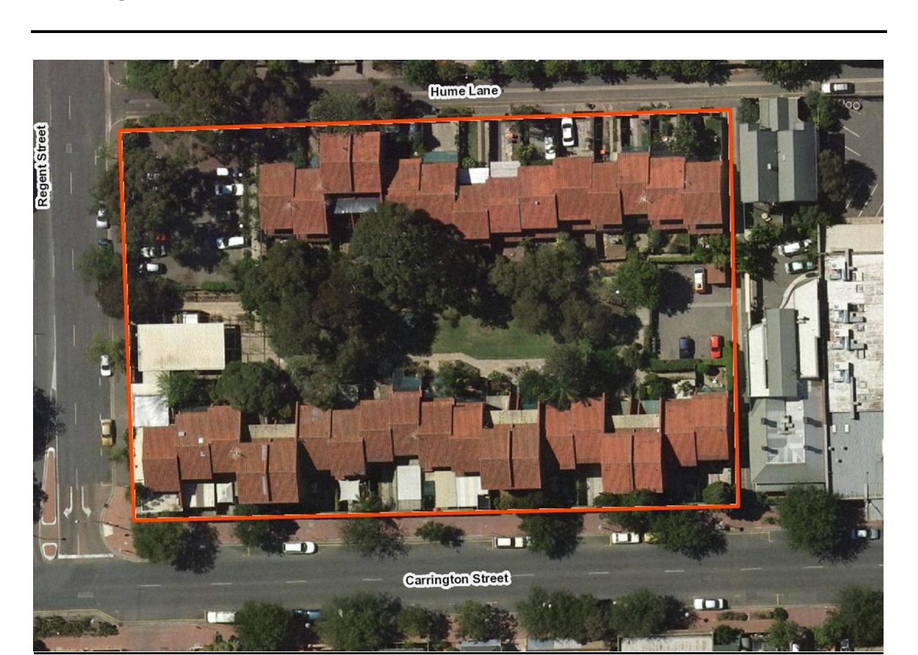
Manitoba Housing Complex, Carrington Street, Adelaide – Site Plan [Generally indicating the important elements and features of the place (outlined in red)]

Manitoba Housing Complex 228-256 Carrington Street, 7-29 Hume Lane & 1-32 Regent Street North, Adelaide