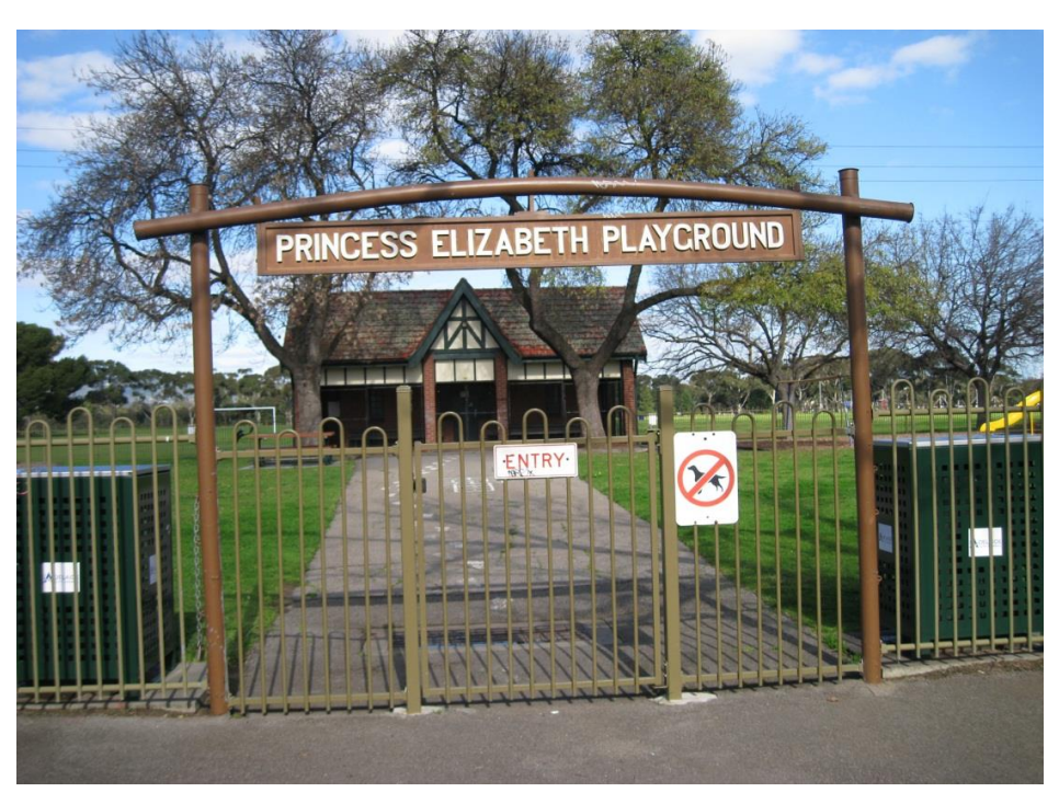
Entrance, Princess Elizabeth Children's Playground, South Terrace, Adelaide View to the south