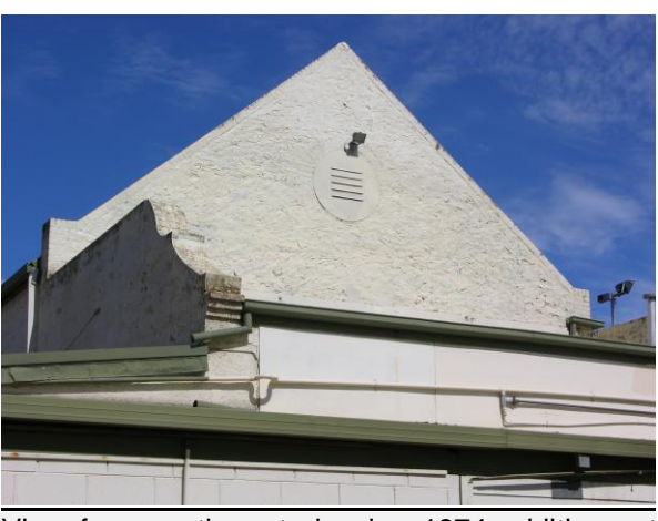
View from north-east showing 1874 additions at rear (DEWNR 2014)