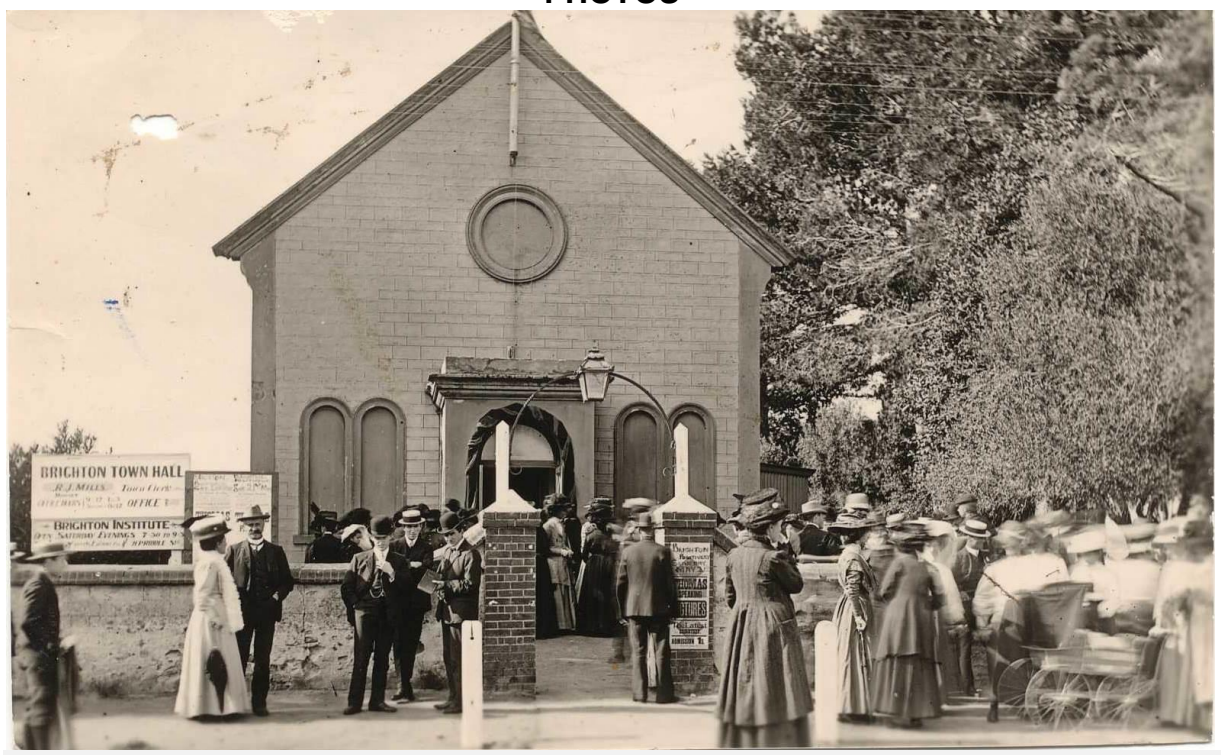
People arriving at a function at the Town Hall Brighton, 1918. Note original small portico and limestone and brick boundary wall