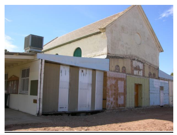
The former Brighton Town Hall, western elevation after removal of the 1954 brick façade. (DEWNR 2014)