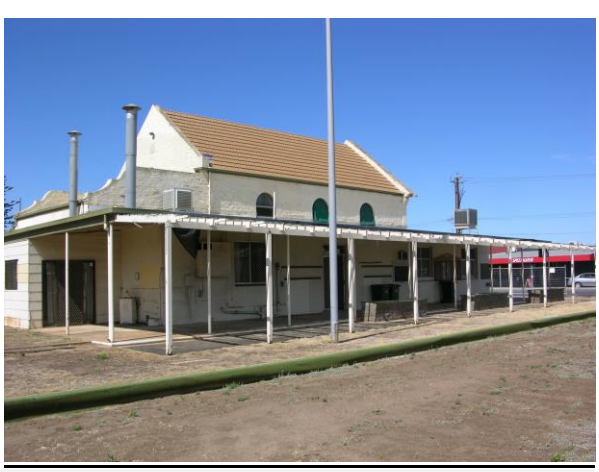
Northern elevation from former bowling green. (DEWNR 2014)