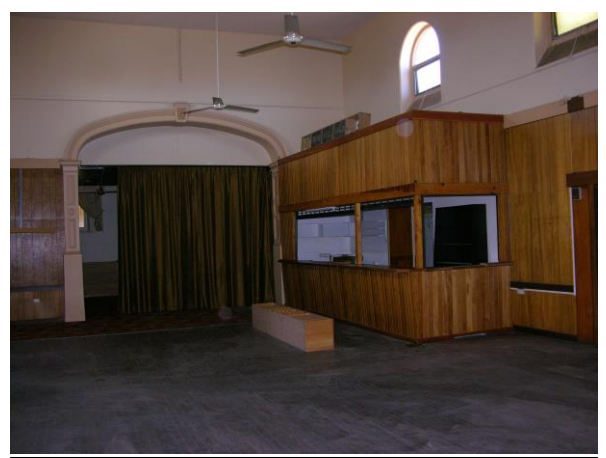
Interior showing proscenium arch (former 1896 stage) at eastern end of hall with RSL Club bar and timber wall panelling (DEWNR, 2014)