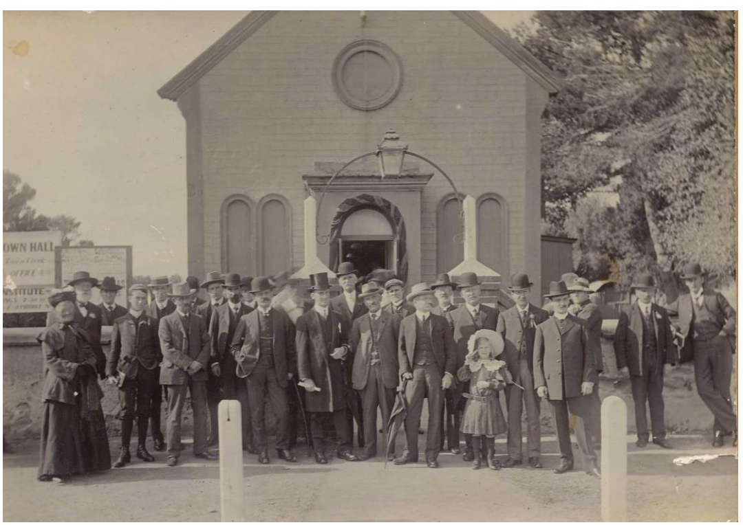
Brighton Town Hall, c1911 (Image: Holdfast Bay History Centre)