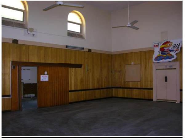
Interior, south-western corner of main hall, with front doors on right (DEWNR 2014)