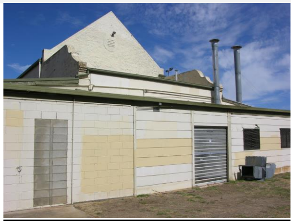
Rear (eastern elevation) showing parapet walls of 1874 addition (DEWNR 2014)