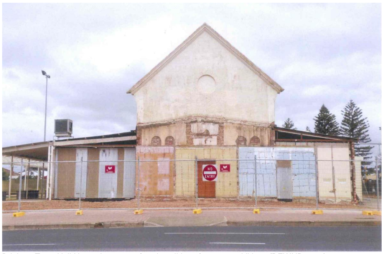
Brighton Town Hall November 2013 after demolition of western additions (DEWNR 2013)