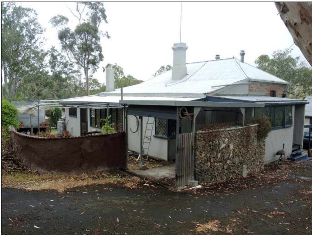
Old School House complex, 1689 Inman Valley Road, Inman Valley, looking west [View of c.1886 School House, including a number of additions]