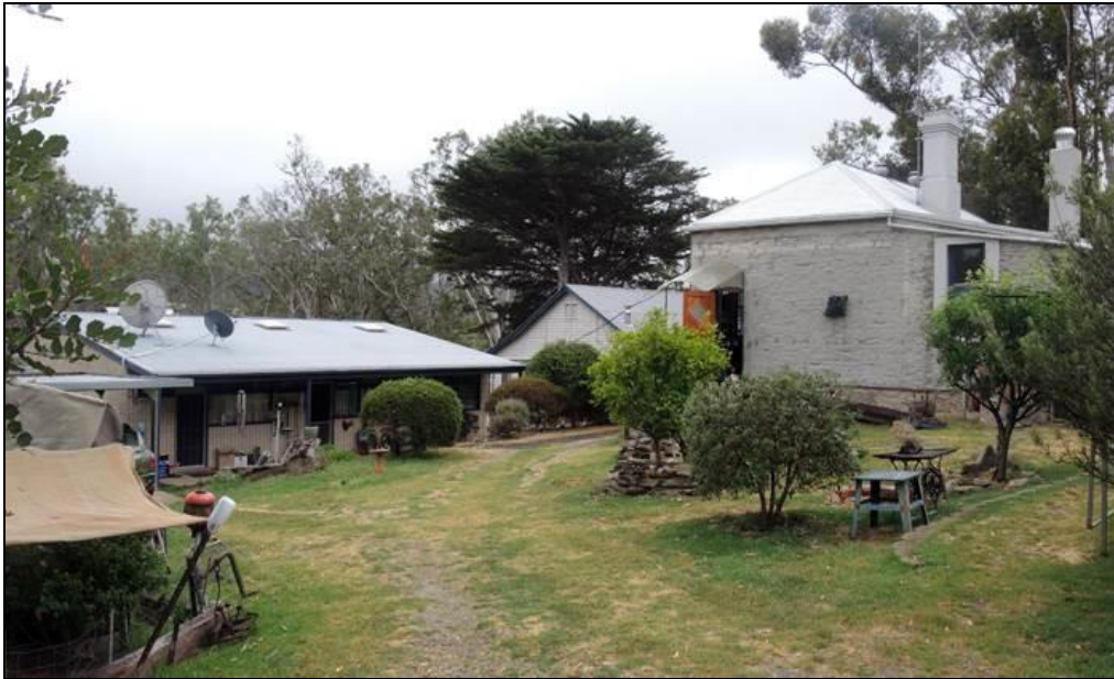
Old School House complex, 1689 Inman Valley Road, Inman Valley, looking north [The c.1886 school house is on the right, the 1954 school house, centre back and 1970s backpackers is on the left.]

NAME: Old School House complex, Inman Valley PLACE NO.: 26451