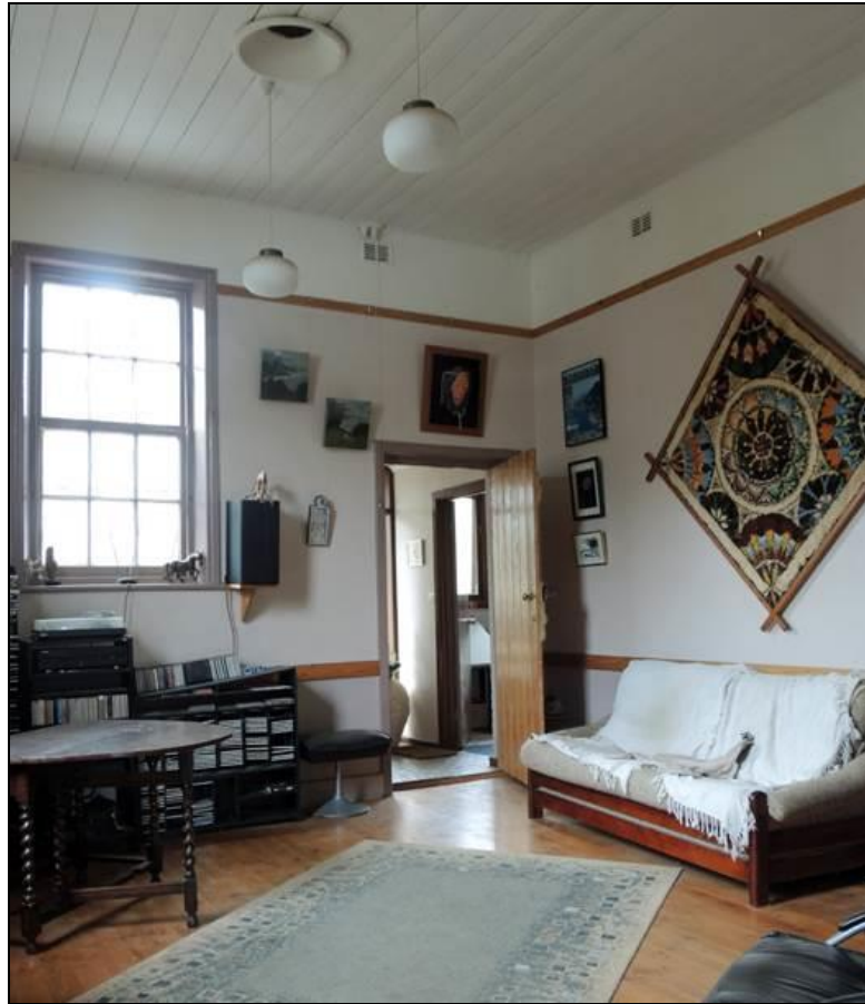
Old School House complex, 1689 Inman Valley Road, Inman Valley, looking east [View of the interior of c.1886 School Room]

NAME: Old School House complex, Inman Valley PLACE NO.: 26451