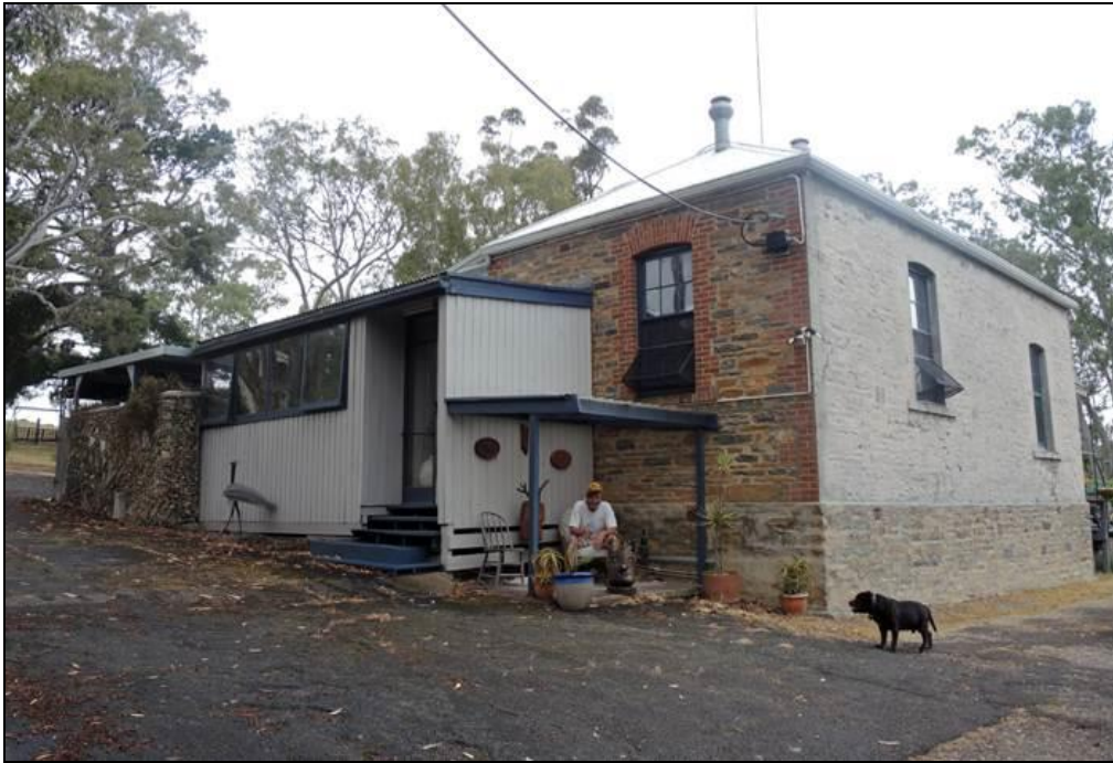
Old School House complex, 1689 Inman Valley Road, Inman Valley, looking south [View of c.1886 School House]

NAME: Old School House complex, Inman Valley PLACE NO.: 26451