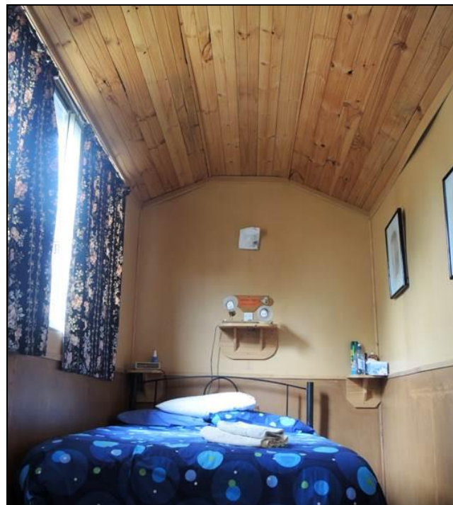
Old School House complex, 1689 Inman Valley Road, Inman Valley, looking east [View of the interior of the Lunchroom in the 1954 School House, altered to become a spare bedroom]