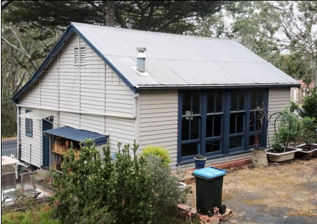
Old School House complex, 1689 Inman Valley Road, Inman Valley, looking north [View of the 1954 School House]

NAME: Old School House complex, Inman Valley PLACE NO.: 26451