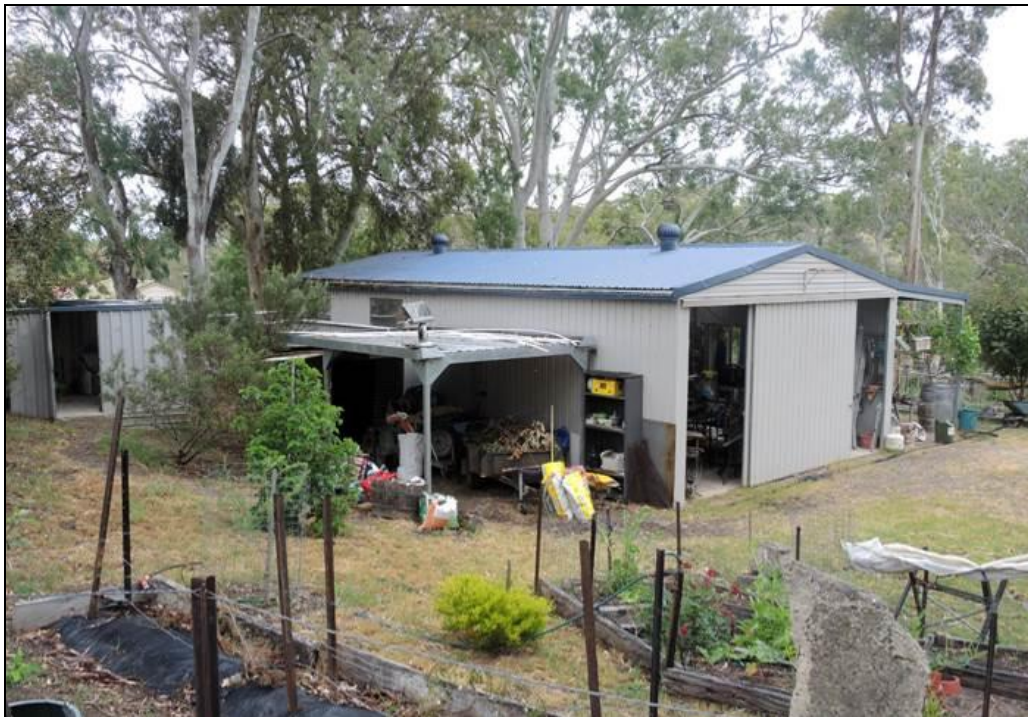
Old School House complex, 1689 Inman Valley Road, Inman Valley, looking west [View of the new shed]