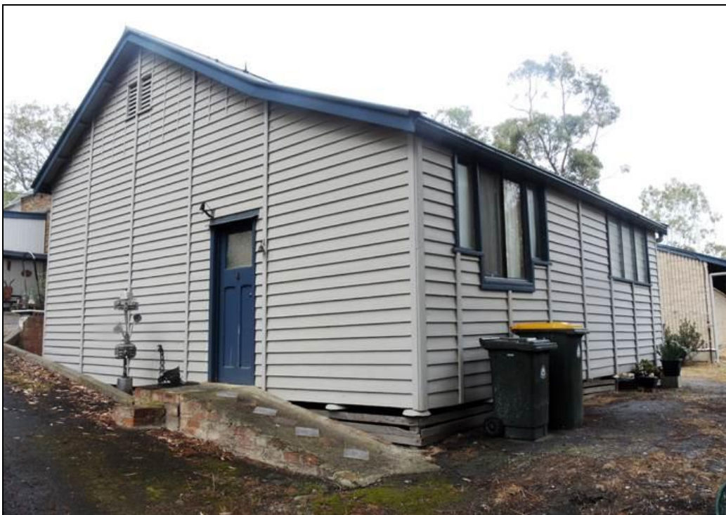
Old School House complex, 1689 Inman Valley Road, Inman Valley, looking south [View of the 1954 School House]