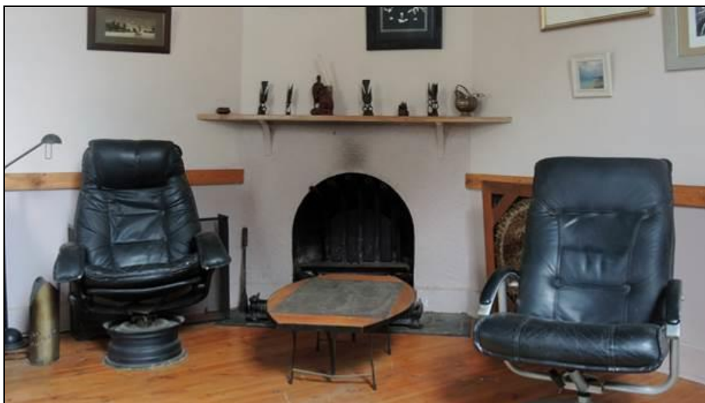
Old School House complex, 1689 Inman Valley Road, Inman Valley, looking east [View of the fireplace of c.1886 School Room, which was significantly altered]