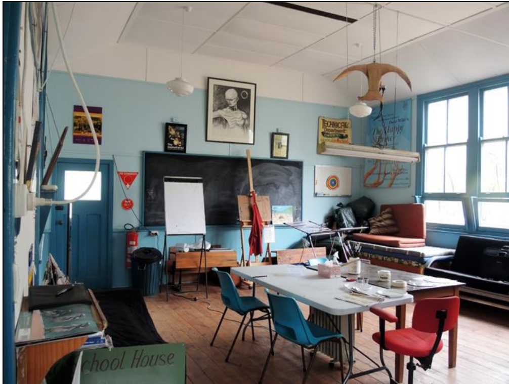
Old School House complex, 1689 Inman Valley Road, Inman Valley, looking east [View of the interior of the large School Room in the 1954 School House]

NAME: Old School House complex, Inman Valley PLACE NO.: 26451