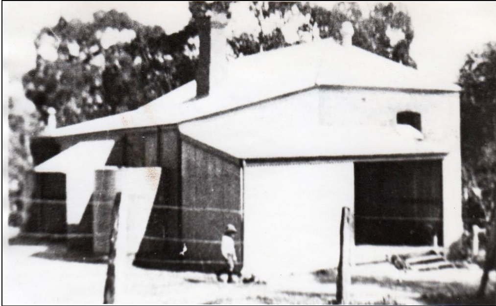
Old School House, Inman Valley (1920), looking west

NAME: Old School House complex, Inman Valley PLACE NO.: 26451