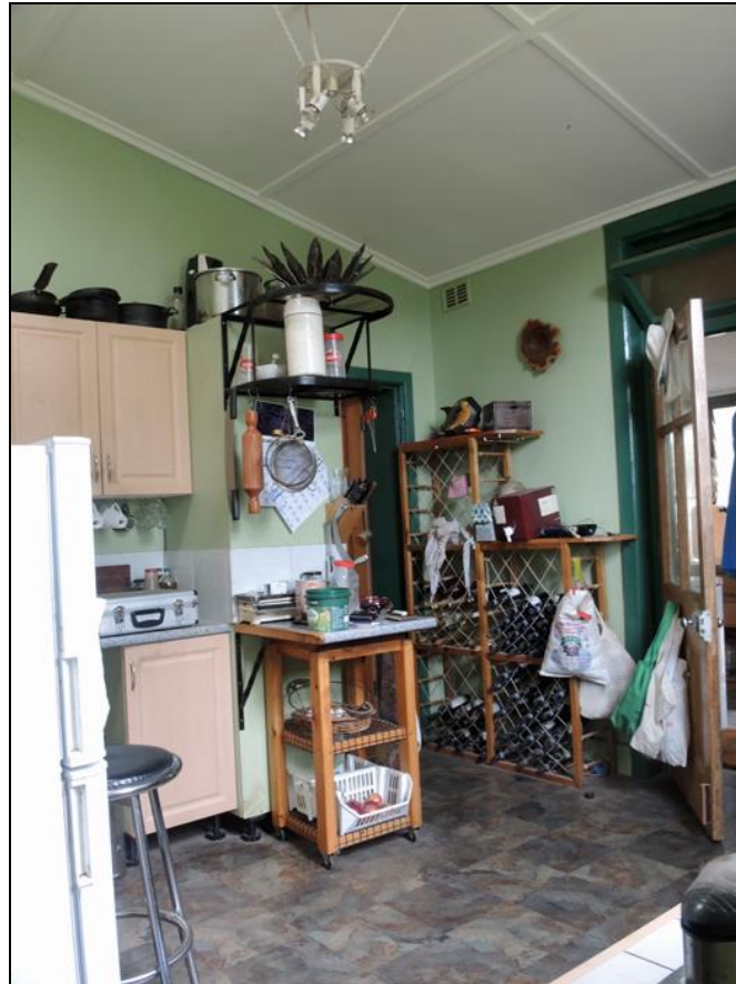
Old School House complex, 1689 Inman Valley Road, Inman Valley [View of the interior of kitchen within the original residence of the c.1886 School House. The internal fittings and layout has been significantly altered to meet modern residential expectations]

NAME: Old School House complex, Inman Valley PLACE NO.: 26451