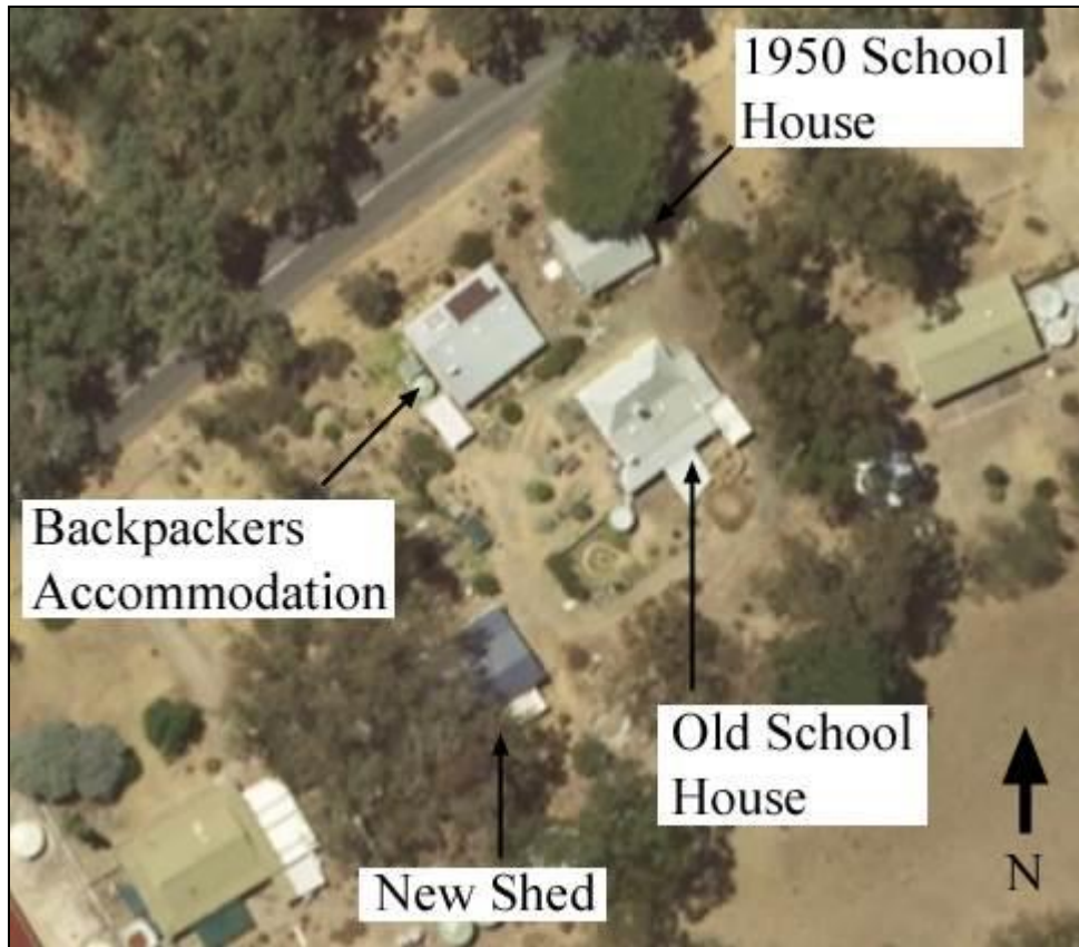
Site Plan of the Old School House complex, 1689 Inman Valley Road, Inman Valley [Using DEWNR satellite imagery]

NAME: Old School House complex, Inman Valley PLACE NO.: 26451