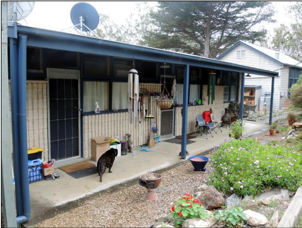
Old School House complex, 1689 Inman Valley Road, Inman Valley, looking north [View of the 1960s former backpackers' hostel]

NAME: Old School House complex, Inman Valley PLACE NO.: 26451