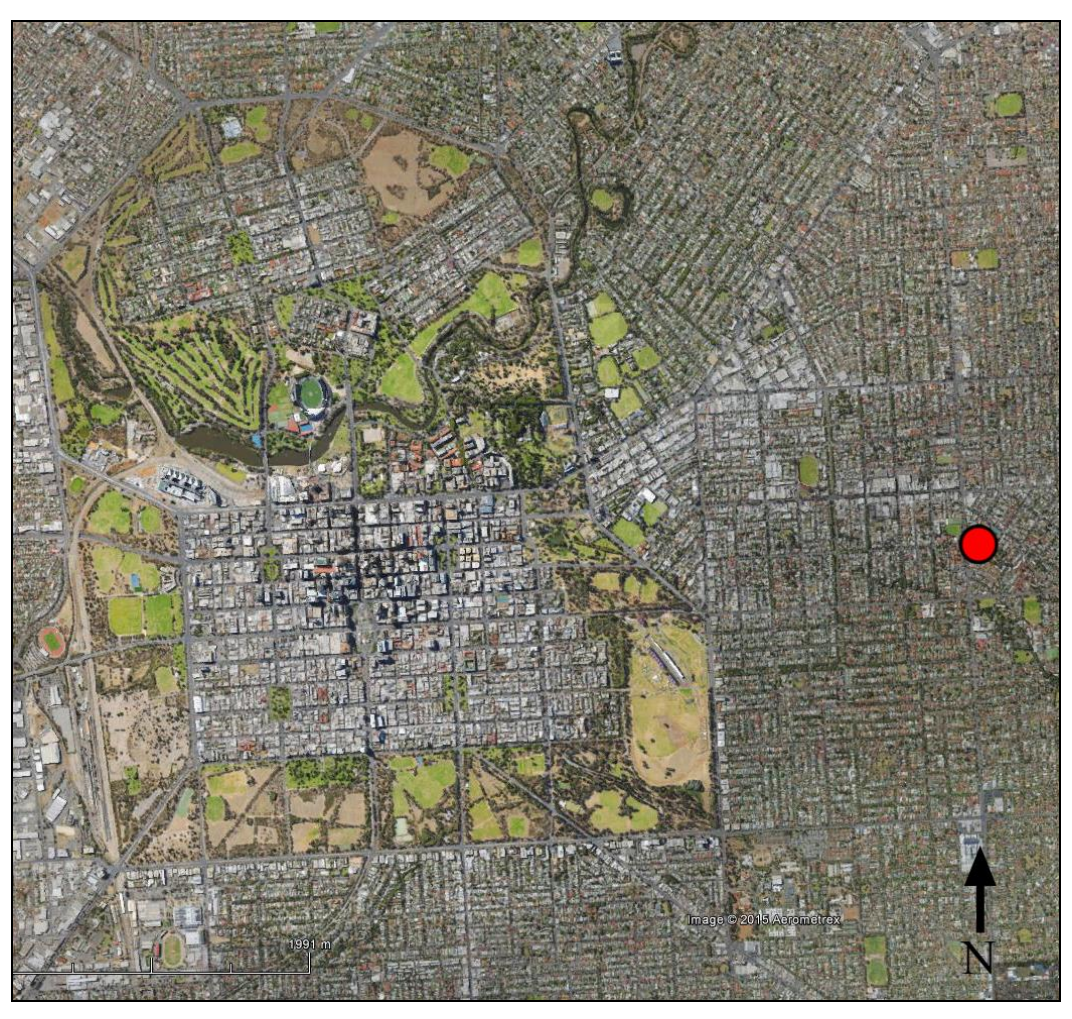
Location of the Kensington and Norwood Pool, 26-28 Phillip Street, Kensington (shown by a red dot)