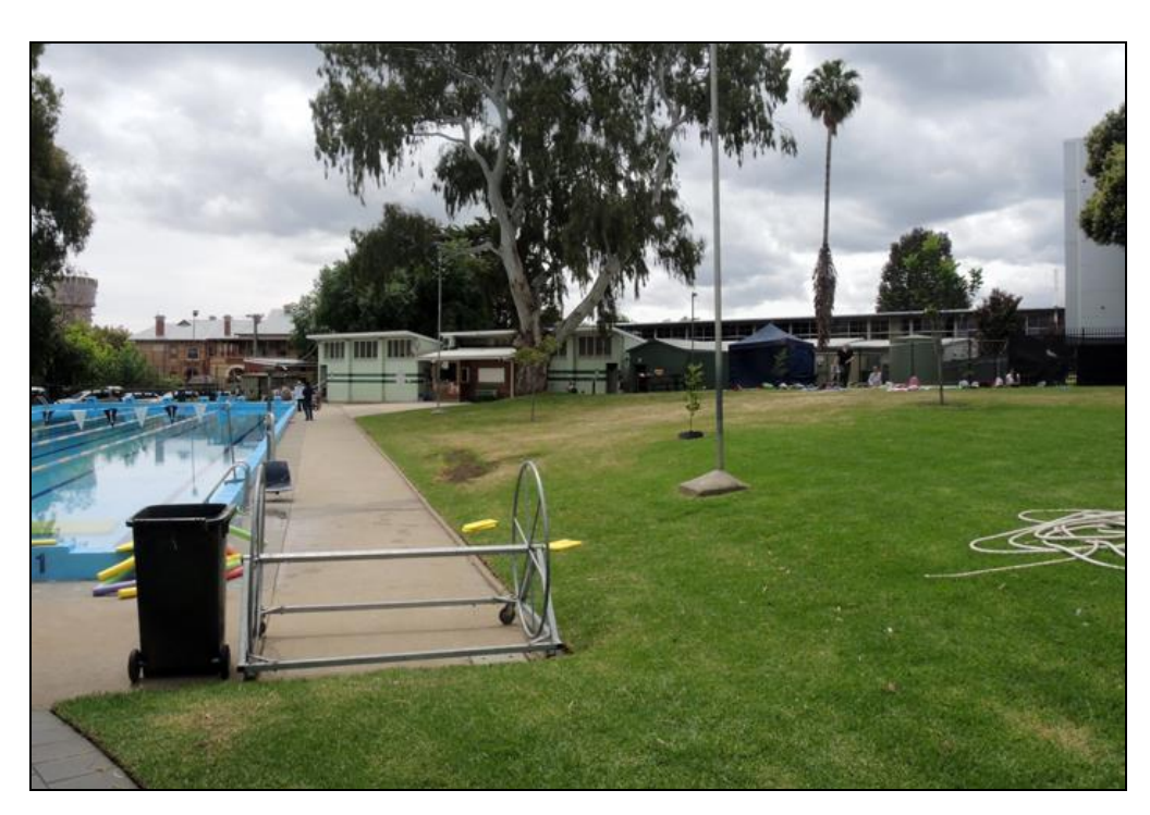
Kensington and Norwood Pool, 26-28 Phillip Street, Kensington (Looking north)