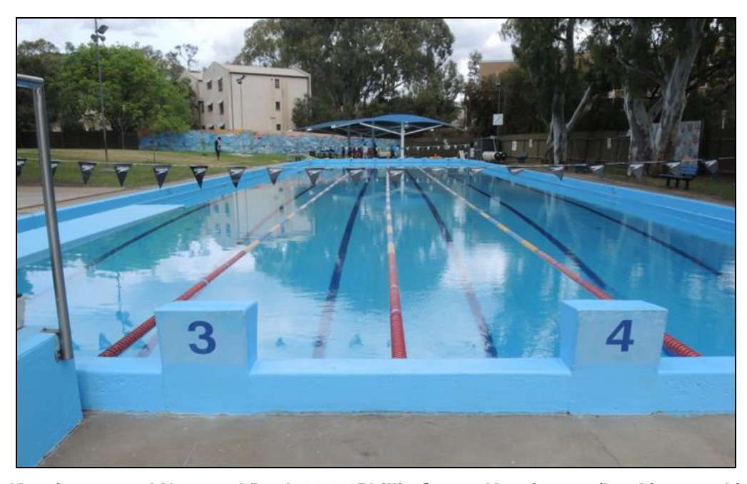
Kensington and Norwood Pool, 26-28 Phillip Street, Kensington (Looking south) [The 55 yard swimming pool with wading pool in the background]