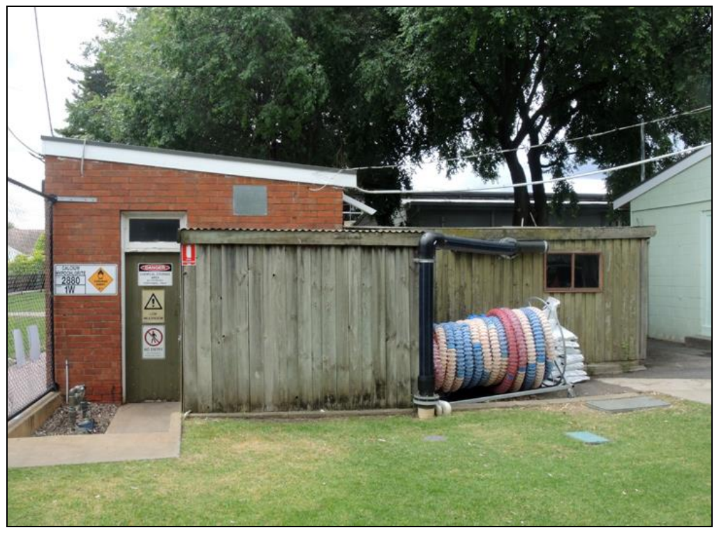
Kensington and Norwood Pool, 26-28 Phillip Street, Kensington [The brick chemical store and attached wooden pump house]