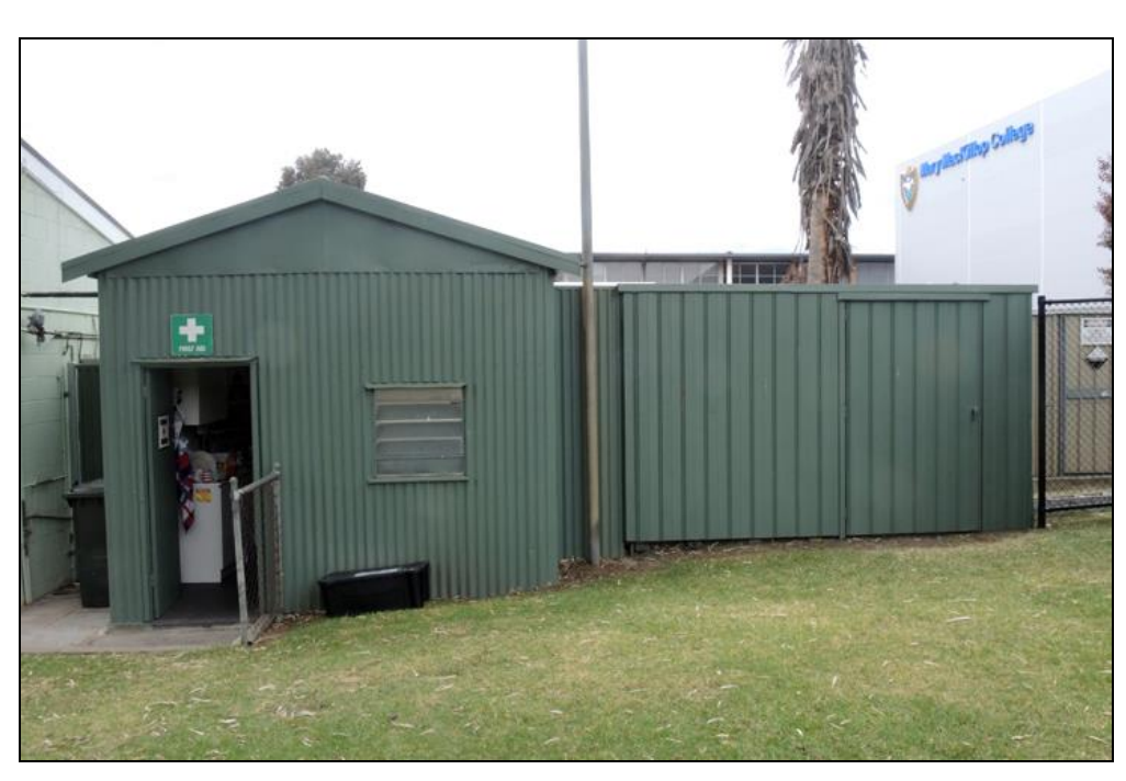
Kensington and Norwood Pool, 26-28 Phillip Street, Kensington [Metal first aid hut and attached storage shed]