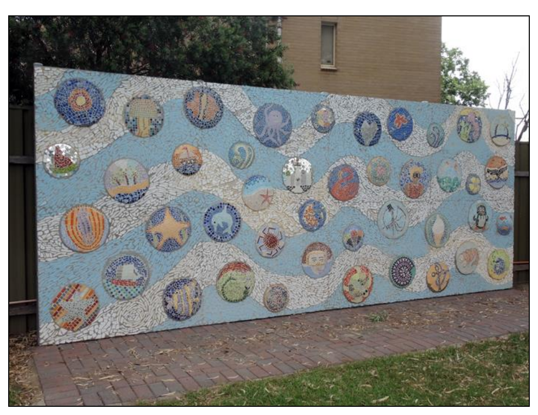
Kensington and Norwood Pool, 26-28 Phillip Street, Kensington [An artistic mosaic mural on the south western boundary line]