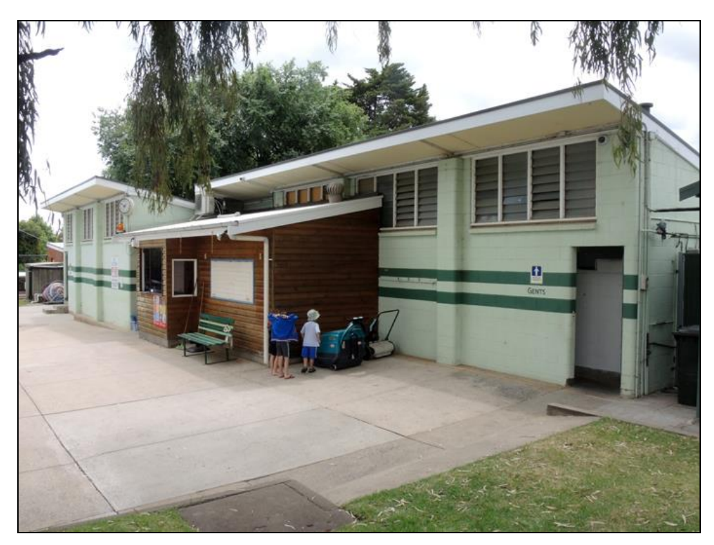
Kensington and Norwood Pool, 26-28 Phillip Street, Kensington [The change rooms wooden shop]

NAME: Kensington and Norwood Pool (Now Norwood Swimming Centre) PLACE NO.: 26455