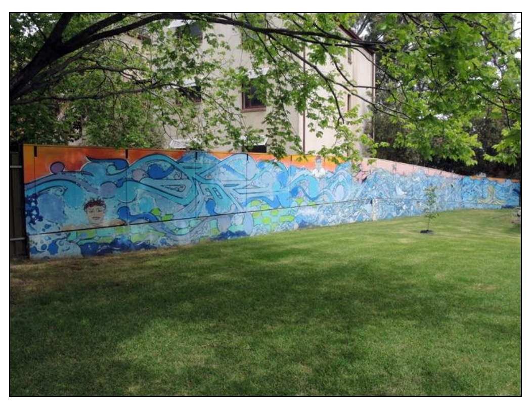
Kensington and Norwood Pool, 26-28 Phillip Street, Kensington [A long painted mural along the north east boundary]