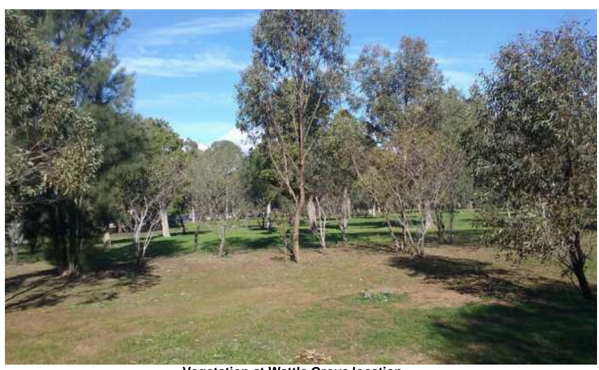
Vegetation at Wattle Grove location