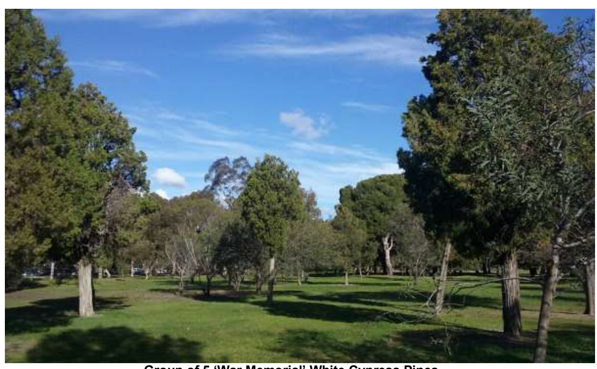
Group of 5 'War Memorial' White Cypress Pines Source: DEWNR June 2016