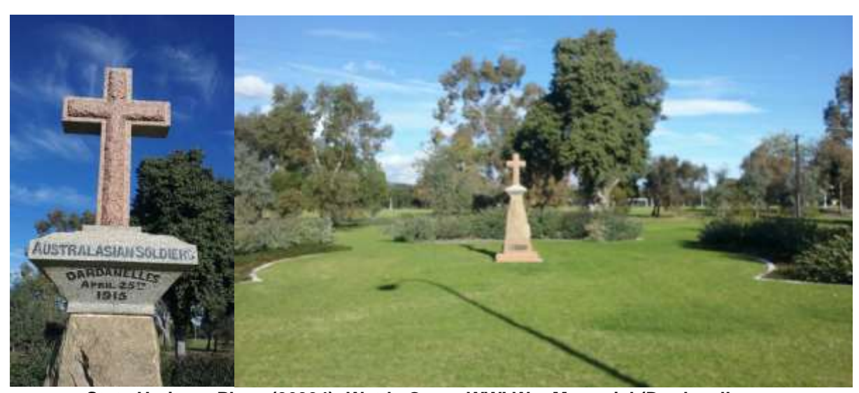
State Heritage Place (26394): Wattle Grove WWI War Memorial (Dardanelles Campaign, also called Gallipoli Campaign) in new landscaped surrounds (June 2016)