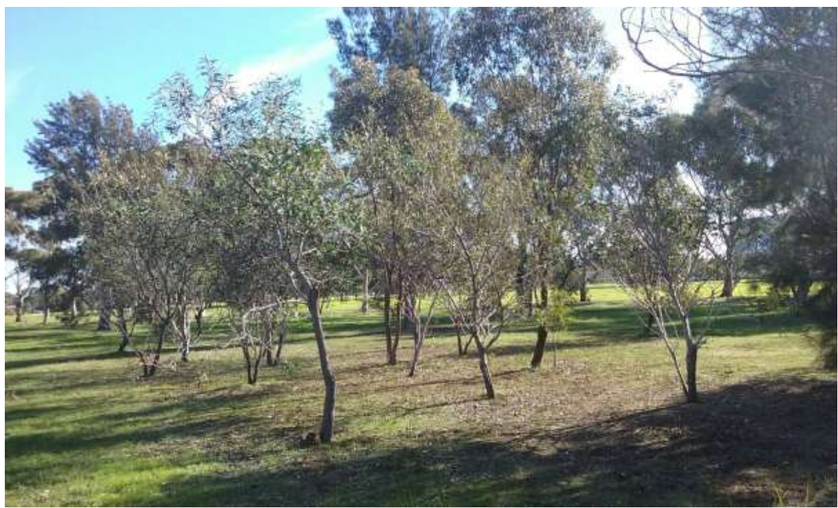
Vegetation at Wattle Grove location Source: DEWNR June 2016