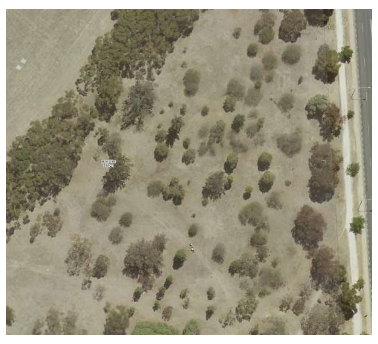
DETAIL PLAN. Aerial image of area indicated by nominator as comprising 'Wattle Grove' Mirnu Wirra (Park 21 West), Adelaide Park Lands, Adelaide, 5000