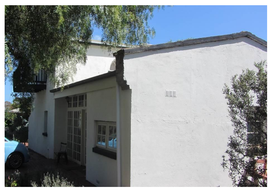
Former Normanville Police Station - stable (c1863). Note original twostorey building with single-storey addition to side. March 2017