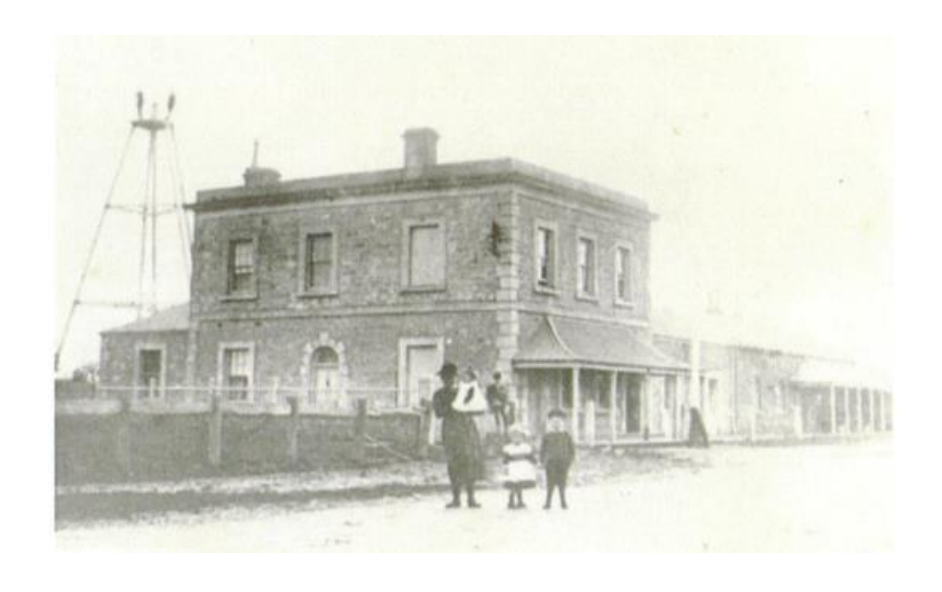
Former Normanville Police Station c1880

NAME: Former Normanville Police Station PLACE: 26470