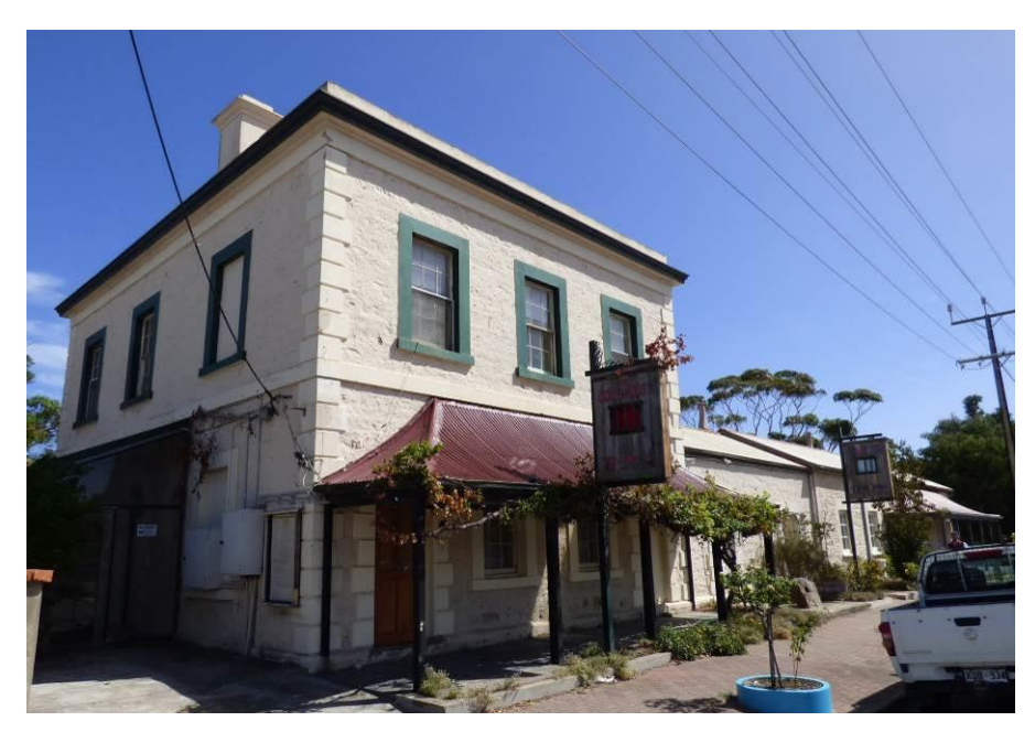
Former Normanville Police Station - west end (c1863). Note decorative cement rendered cornice and window surrounds and original verandah. March 2017