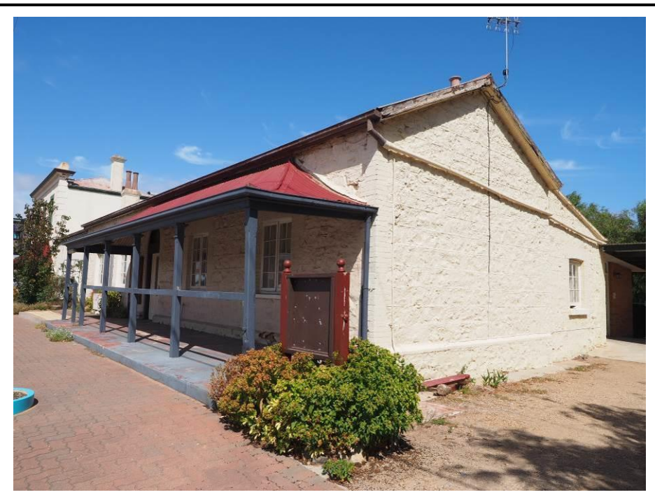
Former Normanville Police Station – Original 1855 police station and courthouse building (from north). Note ribbon pointing and 1870s verandah. March 2017

NAME: Former Normanville Police Station PLACE: 26470