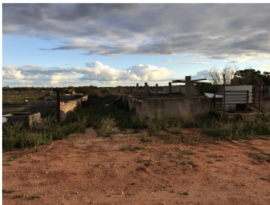
Northern end of the piggery breeding pens showing central corridor