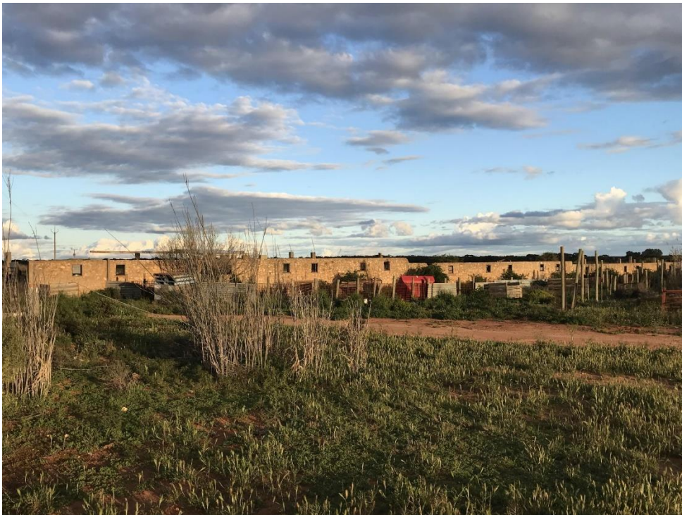
Higher outer (western) wall showing window openings