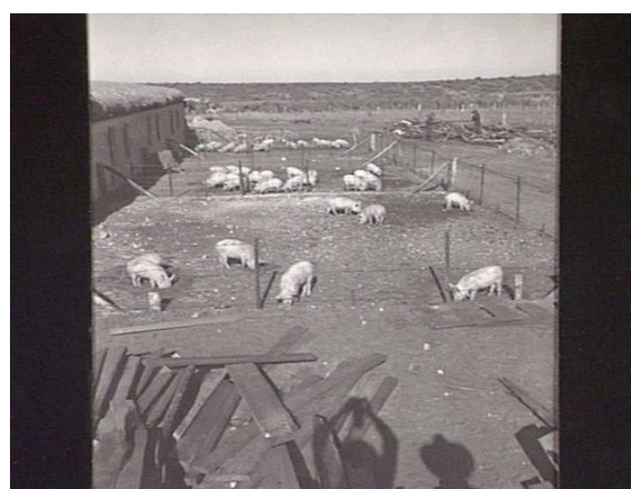
Weaners experiencing life outside of the breeding pens