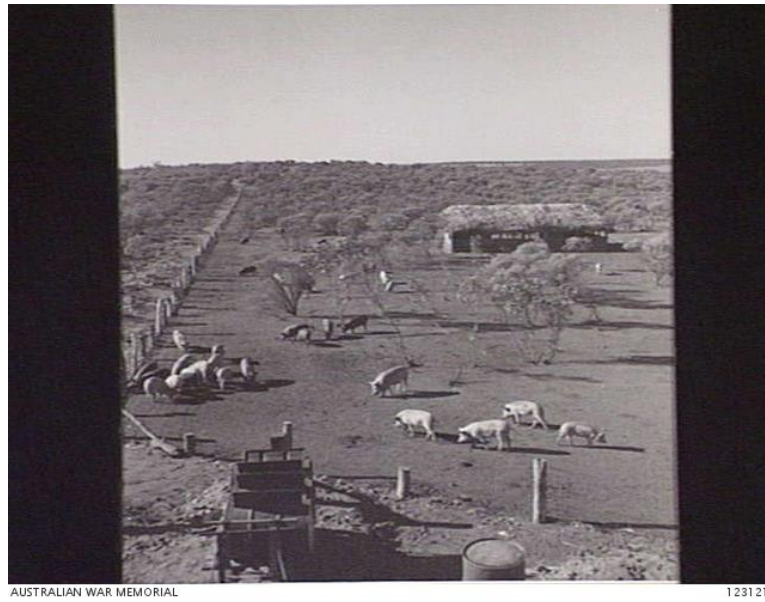
Outside 'pen' at the Piggery - note sleeping shelter in background