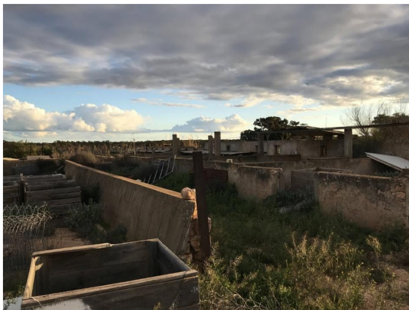
Internal wall of the eastern pens, timber fencing to complete each pen has been removed