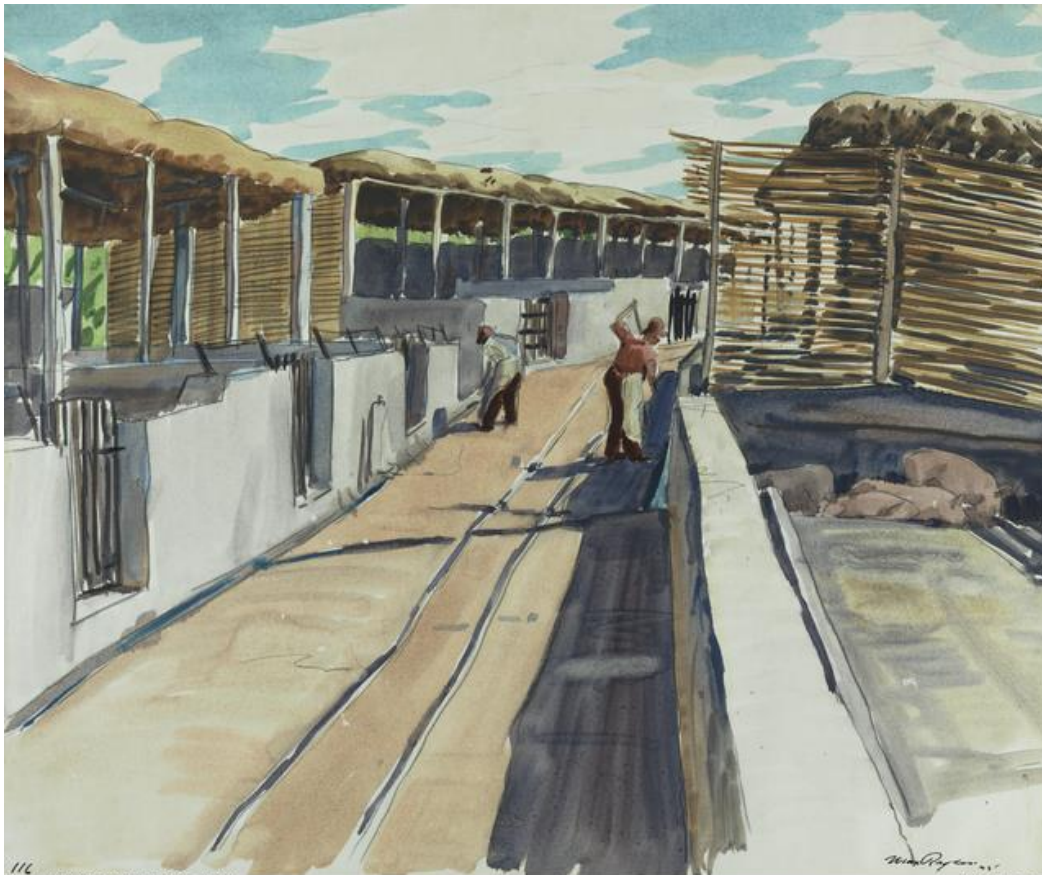
116 AUSTRALIAN WAR MEMORIAL