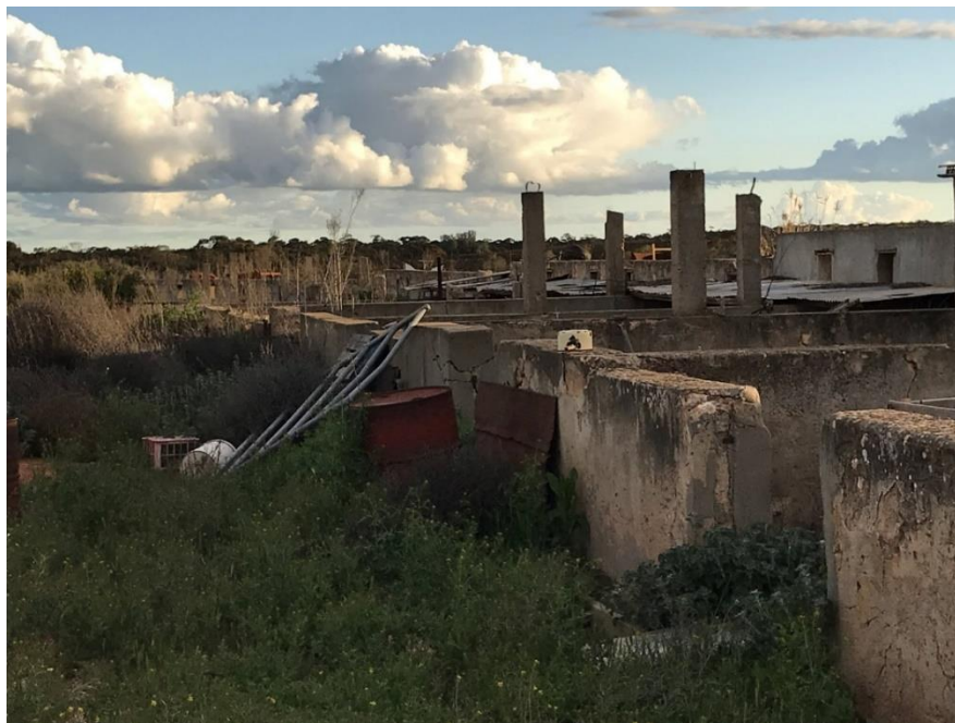
Piggery breeding pens, note the upright supports for the roof