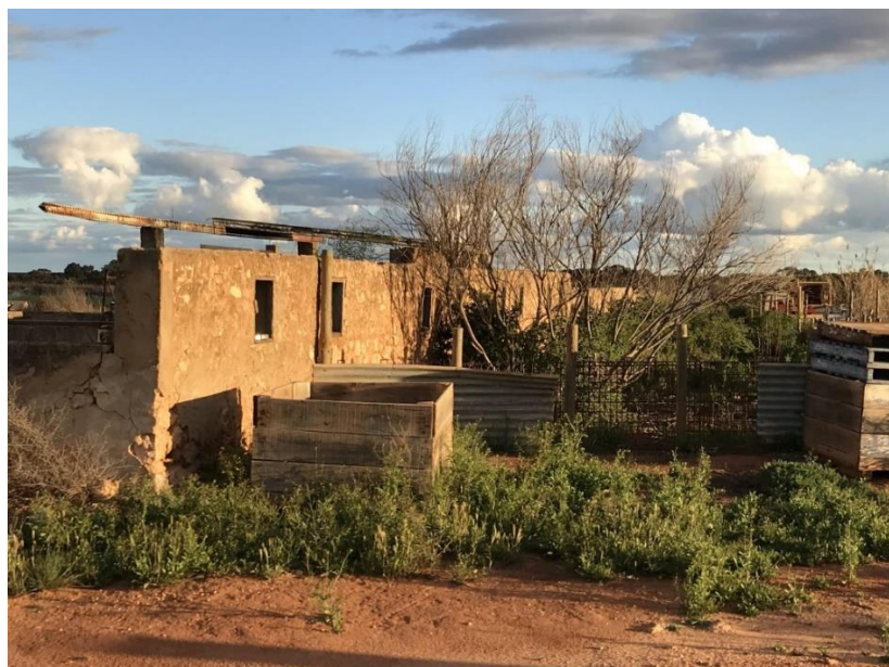
Detail of the wall western elevation, note cracking and loss of render, the fencing is a later replacement