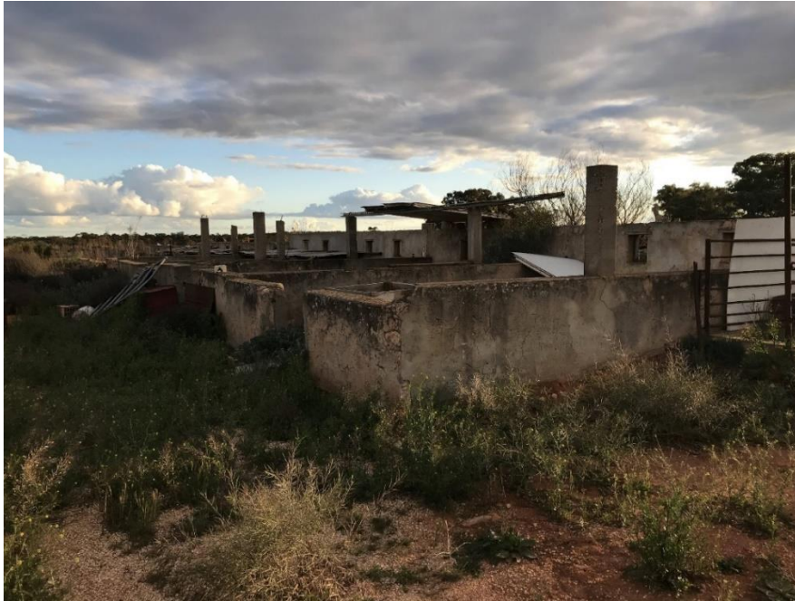
Pens on the western side of the structure