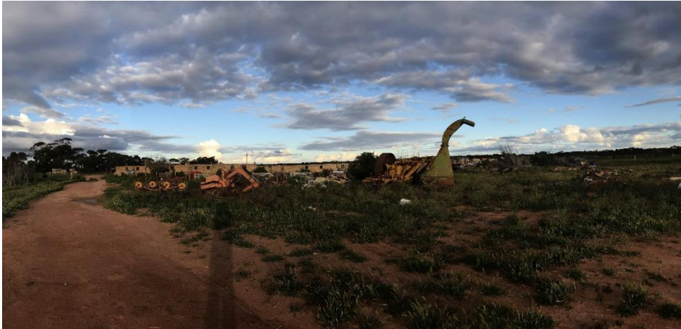
Piggery Breeding Pens, showing the extent of the facility