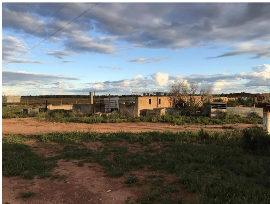
Northern elevation of the piggery breeding pens