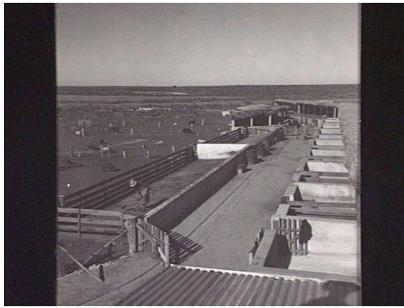
AUSTRALIAN WAR MEMORIAL 123119