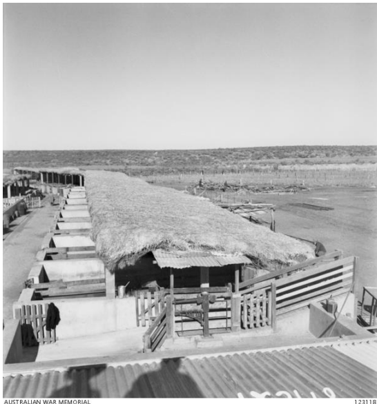
AUSTRALIAN WAR MEMORIAL 123118