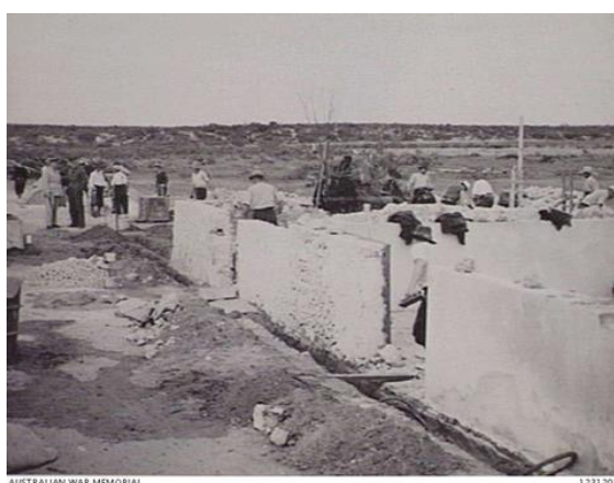
Japanese detainees constructing the breeding pens in October 1943

On 16 September 1943, Captain Rudd, the Group Project Officer, left on a pig-purchasing sortie and the first occupants of the piggery arrived in camp on 28 September. The breeding pens (subject of this assessment) were built by Japanese internees in October 1943 from stone quarried locally and mortar/render containing lime burnt and crushed by the detainees from Camp 14. Fenced enclosures to the rear of the pens provided weaners with experience of life outside while still being able to be close to their mothers.