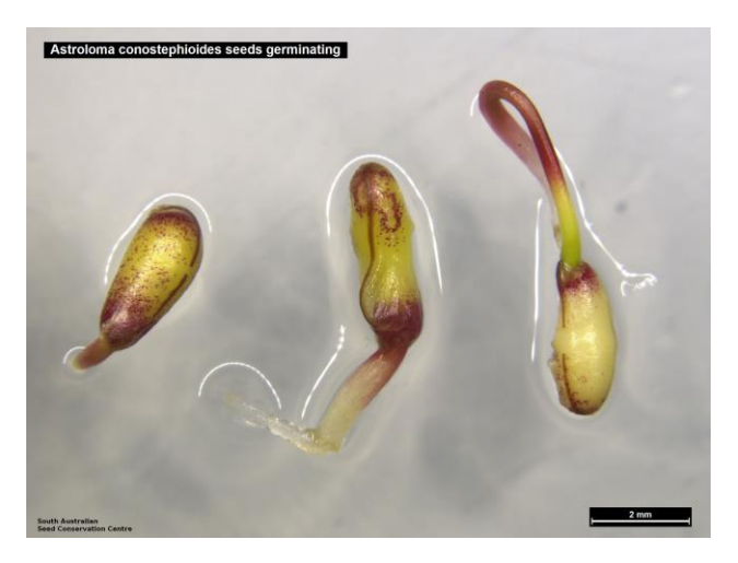
Figure 4. Germination of excised seeds of Astroloma conostephioides.

Seeds of Astroloma xerophyllum that were kept in natural conditions took several seasons to germinate and were shown to have morphophysiological dormancy, indicating that underdeveloped embryos in the seed contributed to seed dormancy. However, successful germination was achieved after excising seed from the endocarp and treatment with gibberellic acid (Turner at al 2009). This was also the case for the two Astroloma species tested in this project (Figure 4). Both species had high germination with excised seeds and exposure to gibberellic acid. This suggests that the process of weathering and stratification combine to alleviate dormancy in nature (Figure 3). The challenge now is to speed up that process in the laboratory or nursery.