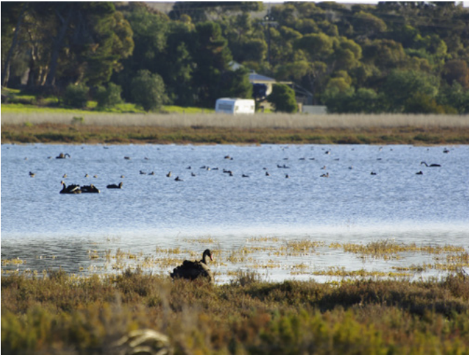
Waterbirds at Narrung wetland

The monitoring of threatened small-bodied fishes in the Lower Lakes recorded the four species that were part of the reintroduction process undertaken between 2011 and 2013. They were captured in very low numbers, even though habitat and water quality were apparently suitable. A total of 255 Murray hardyhead ( Craterocephalus fluviatilis ) were captured across eight sites (in November 2013 and March 2014). Murray hardyhead was the only threatened species to show substantial levels of recruitment in the Lower Lakes, naturally re-colonising two areas (Goolwa Channel and Dog Lake). By comparison, only six southern purple-spotted gudgeon ( Mogurnda adspersa ) were captured at one site, 15 southern pygmy perch ( Nannoperca australis ) at two sites, and two Yarra pygmy perch ( N. obscura ) at one site. There was evidence of localised recruitment for a precarious southern pygmy perch population on Mundoo Island, which represents some success of the reintroduction project. There was, however, no evidence of recruitment for Yarra pygmy perch. Unmeasured factors, such as starvation or predation by the introduced redfin perch ( Perca fluviatilis ), may have contributed to the limited recruitment in both species of pygmy perch. Populations are yet to return to pre-drought abundances.