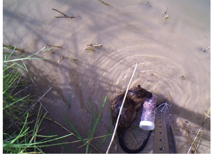
Water rat

Although water quality had recovered in Lake Alexandrina and the Goolwa Channel, there was a lag in microalgae abundance returning to pre-drought levels, and since 2012/13 this lag has actually increased. Lake Albert has a bigger lag in the return to pre-drought abundances compared to Lake Alexandrina, which is strongly associated with salinity and oxidised nitrogen. There has been a decline in cyanobacteria in Lake Alexandrina since the return of flows in 2010, however it is still the dominant microalgal community.