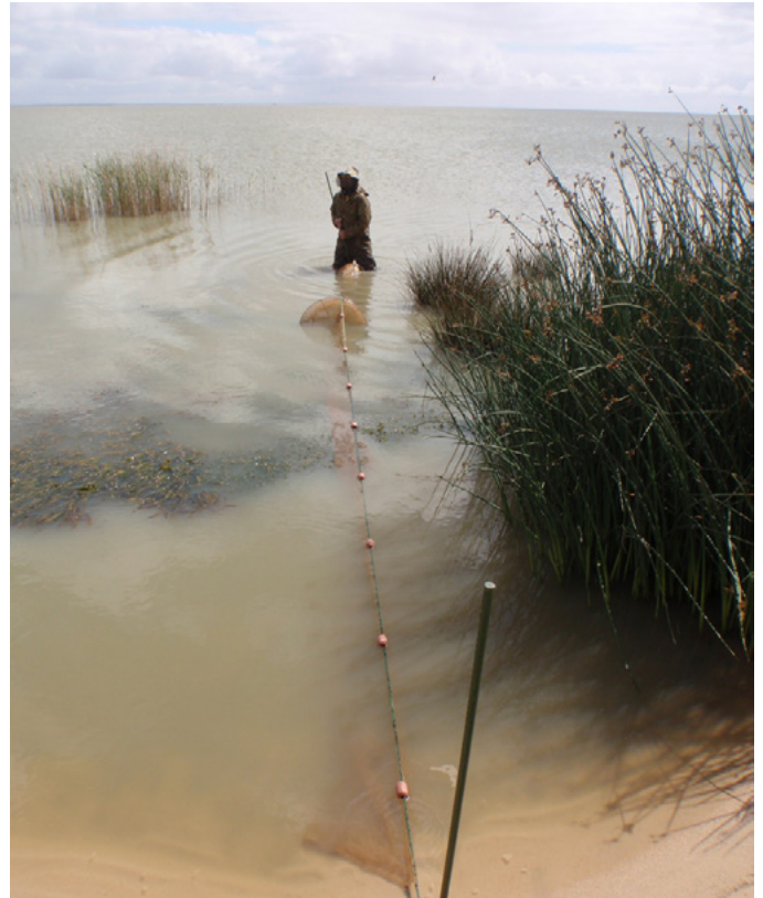
Fyke netting for fish, Lake Alexandrina

Nearly 79,000 waterbirds from 58 species were recorded in the Lower Lakes in January 2014, which equates to only 25 per cent of the total number of waterbirds recorded throughout the whole site in this year. The most abundant species were the Australian Shelduck ( Tadorna tadornoides ) and Great Cormorant ( Phalacrocorax carbo ). High and stable water levels generally reduce productivity and are not ideal conditions for many waterbirds, especially migratory waders.