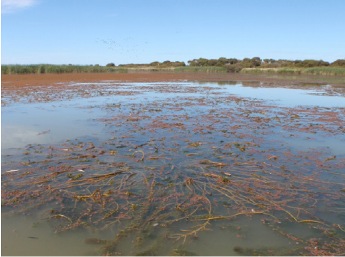
Aquatic vegetation, Dunn's Lagoon Clayton ( Myriophyllum sp. and Azolla filiculoides )