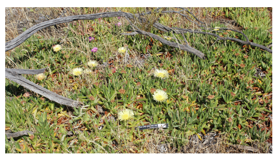
Introduced Carpobrotus edulis (yellow) and C. rossii (pink), from Torrens Island, Adelaide, showing plant habit and the two species growing together.

The yellow flowered C. edulis is relatively easy to identify, however, a high degree of morphological variability has been observed among pink flowered Carpobrotus . We now know there are hybrids between the introduced C. edulis and the local native C. rossii . It appears that these hybrids have become widespread in many areas, in fact wherever the two species come into close proximity.