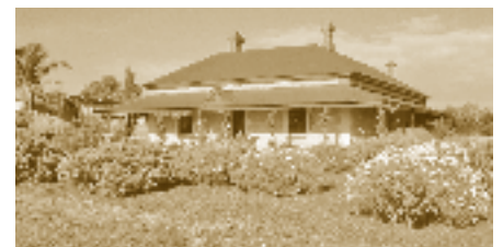
Amande, McLaren Vale