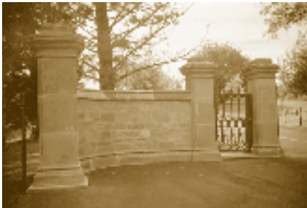
Reconstructed front gates, Scotch College.