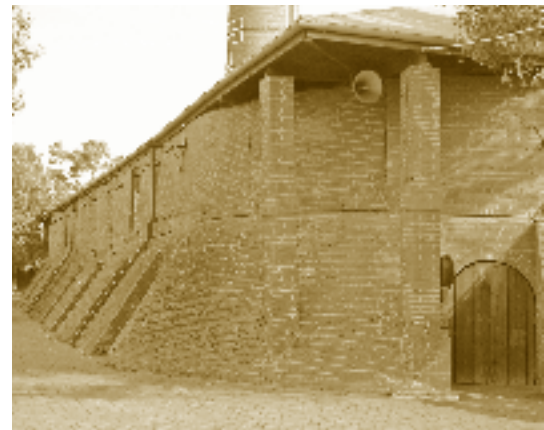
Former Hoffman Brick Kiln, Brickworks Market (former Hallett Brickworks), South Road, Torrensville