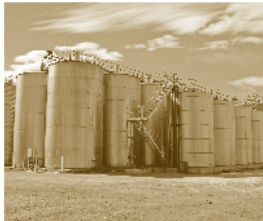
Modern winery storage facility, Lyndoch

The brick kilns at Nuriootpa are an example of this. Regular firing for the production of bricks and terracotta products ensured that the kilns were well maintained during their operational life. Now that they are no longer used, these kilns have undergone an alarming decline - the fabric is no longer dried out by the firing and this, combined with the previous effects of the heat, has meant that the kilns are now on the verge of collapse, virtually beyond repair.