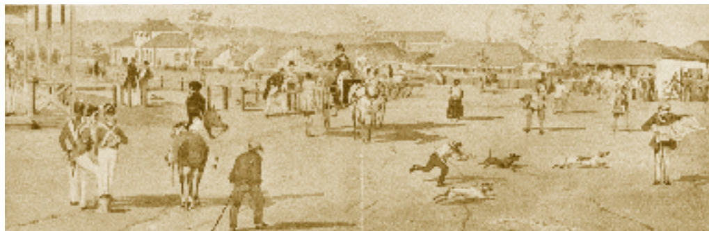
'North Terrace' painting by ST Gill. B7170.

The State Library holds all of the publications indexed and can provide copies. Library staff can also advise customers on the finer points of using the Index.