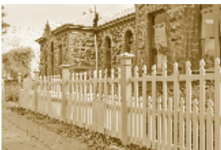
North Adelaide Primary School, fence designed by Heritage Fencing in conjunction with Swanbury Penglas Architects.