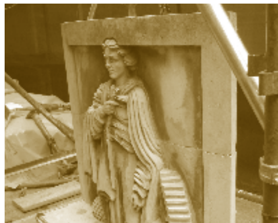
The carved feature 'Prosperity through Thrift' which was removed for cleaning and re-fixing of a new frame prior to refitting to the building.