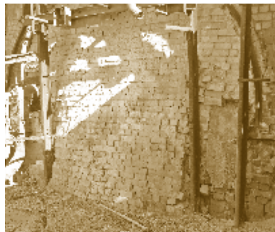
Three original Down-Draught Brick Kilns and Chimney, Krieg's (previously Nuriootpa) Brickyard, Murray Street, Nuriootpa.