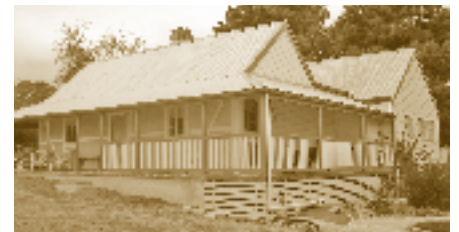
Brock House, Greenock