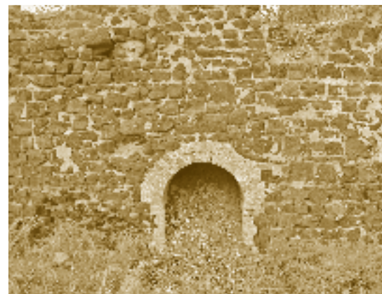
Wallaroo Smelters Site, Wallaroo.