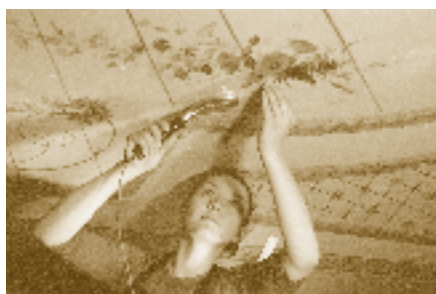
Conserving the ceiling of the Summer Sitting Room, Ayers House.