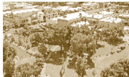
The Cave Garden and Civic Buildings Precinct, Mount Gambier. The Town Hall with clock tower is rear right, City Hall is in the middle, with the Riddoch Art Gallery on the left.