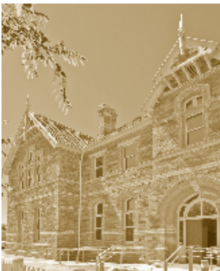
Sturt Street Community School