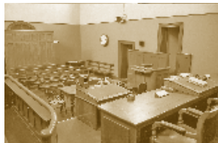
Mt Gambier courtroom