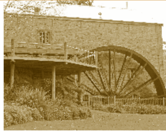
Petaluma's Bridgewater Mill (former Dunn's Flour Mill), Mount Barker Road, Bridgewater