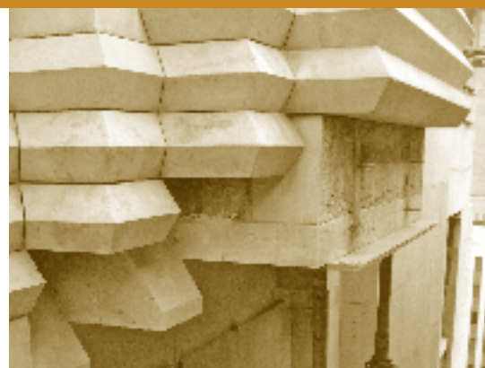
Several stones were removed from under the northern projecting abutments prior to new replacement stone being installed.

Limestone required for repair of the building's facades has been obtained by reopening a quarry at Waikerie in the Riverland area of South Australia. The quarry was one of several which began operation in the 1930s and which provided stone for several King William Street buildings and many of Adelaide's memorials of the period. The last of the quarries in the Waikerie area closed in 1982.