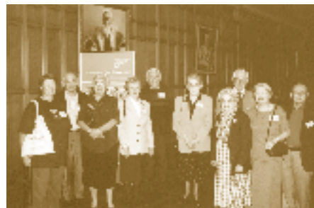
Waite Volunteers attending a University appreciation event at Bonython Hall, Dec. 2004