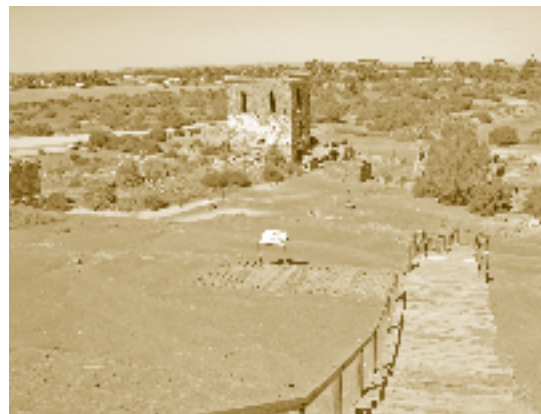
Moonta Mines State Heritage Area.