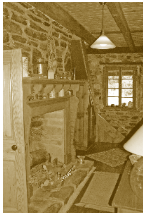
Schubert House "Flurkuchenhaus" or passage kitchen house