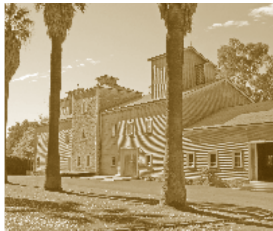
Distillery and Charger Shed, Seppeltsfield Winery, Seppeltsfield, Barossa Valley