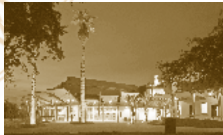
Mt Gambier City Hall

Winners and commended entries in the 2005 Edmund Wright Heritage Awards were: