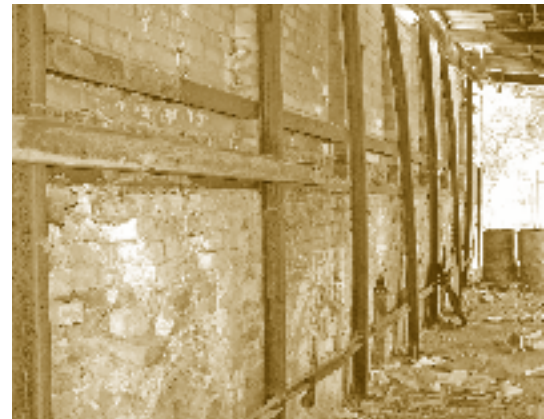
Three original Down-Draught Brick Kilns and Chimney, Krieg's (previously Nuriootpa) Brickyard, Murray Street, Nuriootpa.