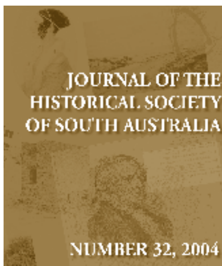
The Journal of the Historical Society of South Australia