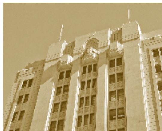
The completed façade following completion of extensive conservation works.