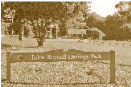
John Reynell Heritage Park