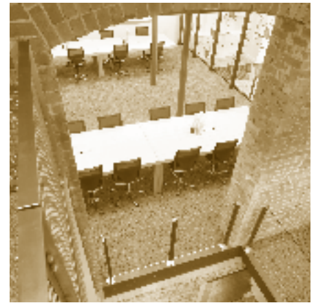
Former Megaw & Hogg building, new offices; view between the spaces