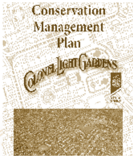
Colonel Light Gardens Conservation Management Plan.