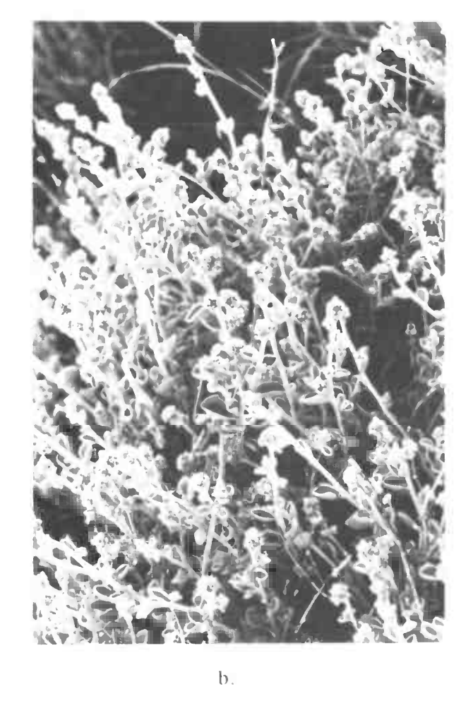
Fig. 1. Ptilotus maconochiei Benl: a, shaly slopes of Mt Isa City Lookout (ca 570 m alt.) covered with more than one hundred shrubs (40-80 cm tall) of the hitherto undescribed species; photo A.S. George, b, branches and branchlets bearing compact spikes up to 3 cm long; photo J.R. Maconochie.