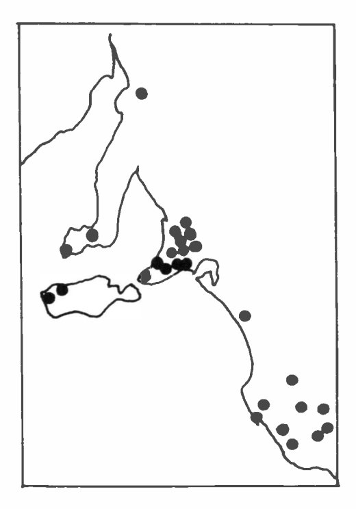
Map 2. Distribution of P. pedunculata in South Australia.