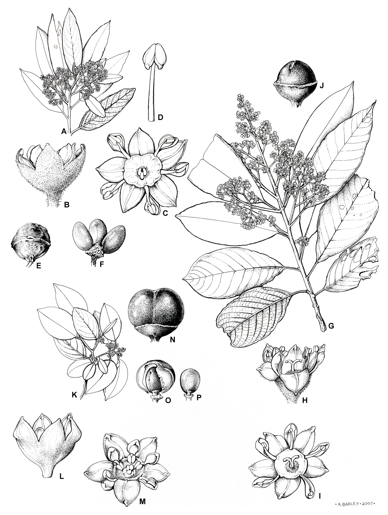
Fig. 3. Three Australian members of the Alphitonia Group. A–F Alphitonia petriei : A branch ×0.3; B flower (side view) ×7.5; C flower from above ×7.5; D stamen ×15, with characteristic appendage at the base of the anther; E fruit ×1.25; F receptacle with seeds attached ×2.5. G–J A. whitei : G branch ×0.3; H flower (side view) ×7.5; I flower from above ×7.5; J fruit ×2.5. K–P Emmenosperma cunninghamii : K branch ×0.3; L flower (side view) ×7.5; M flower from above ×7.5; N closed fruit ×2; O open fruit ×2; P seed remaining on receptacle ×2. — A A.R. Bean 5043 (MEL721022), B–D K.R. Thiele 2501 (CANB467468), E F. Mueller s.n. (MEL712882), F I.R. Telford 11194 (CBG9102405), K–M J. Russel-Smith 8403 (MEL1601336), N B. Gray 1480 (MEL1605347), O, P C.R. Dunlop 7242 (MEL1583577), G–I A.R. Bean 5078 (MEL721328), J V.K. Moriarty 2039 (CANB296521).