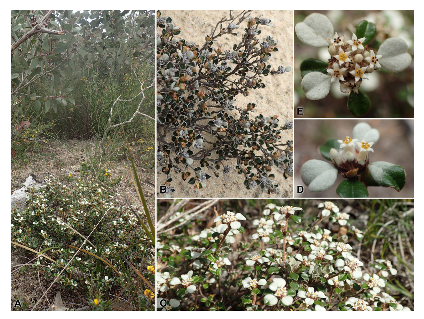
Fig. 2. Stenanthemum leucophractum, the type species of the genus. A Plant flowering in Cox Scrub Conservation Park (near Adelaide, S.A.); B fruiting plant growing in the Big Desert (Vic.); C close up of flowering branches, Wanilla Settlement Reserve (Eyre Peninsula, S.A.); D , E flower-heads, surrounded by white felty floral leaves, from Cox Scrub (D) and Wanilla (E). — A, D J. Kellermann 655 & F. Nge (AD), B JK 934 & FN (AD), C JK 747 & FN (AD), E JK 743 & FN (AD).

Low, erect shrub to 20 cm high with white-woolly young stems, lower leaf surfaces and flowers. Leaves : stipules ovate or rectangular, 4–6 mm long, almost fully connate, densely sheathing the stems; petiole 1.5–3.5 mm long; lamina linear or (occasionally) narrowly obovate to narrowly elliptic, (3–) 6–10 (–11) mm long, 1–2 (–4) mm wide, narrowly cuneate at base, with strongly revolute margins, apex obtuse, scabrid above. Inflorescences 1–1.5 cm wide, with up to 50 flowers. Flowers white to cream; free hypanthium tube 2.5–5 mm long, 0.8–1.5 mm diameter, moderately woolly. Sepals 0.7–1 mm long, densely woolly outside, inside with a red spot. Petals 0.5–0.6 mm long. Disc apparently absent. Ovary roof glabrous; style 3.2–5 mm long. Fruits 2–2.4 mm long; seeds 1.2–1.4 mm long. Fig. 1.