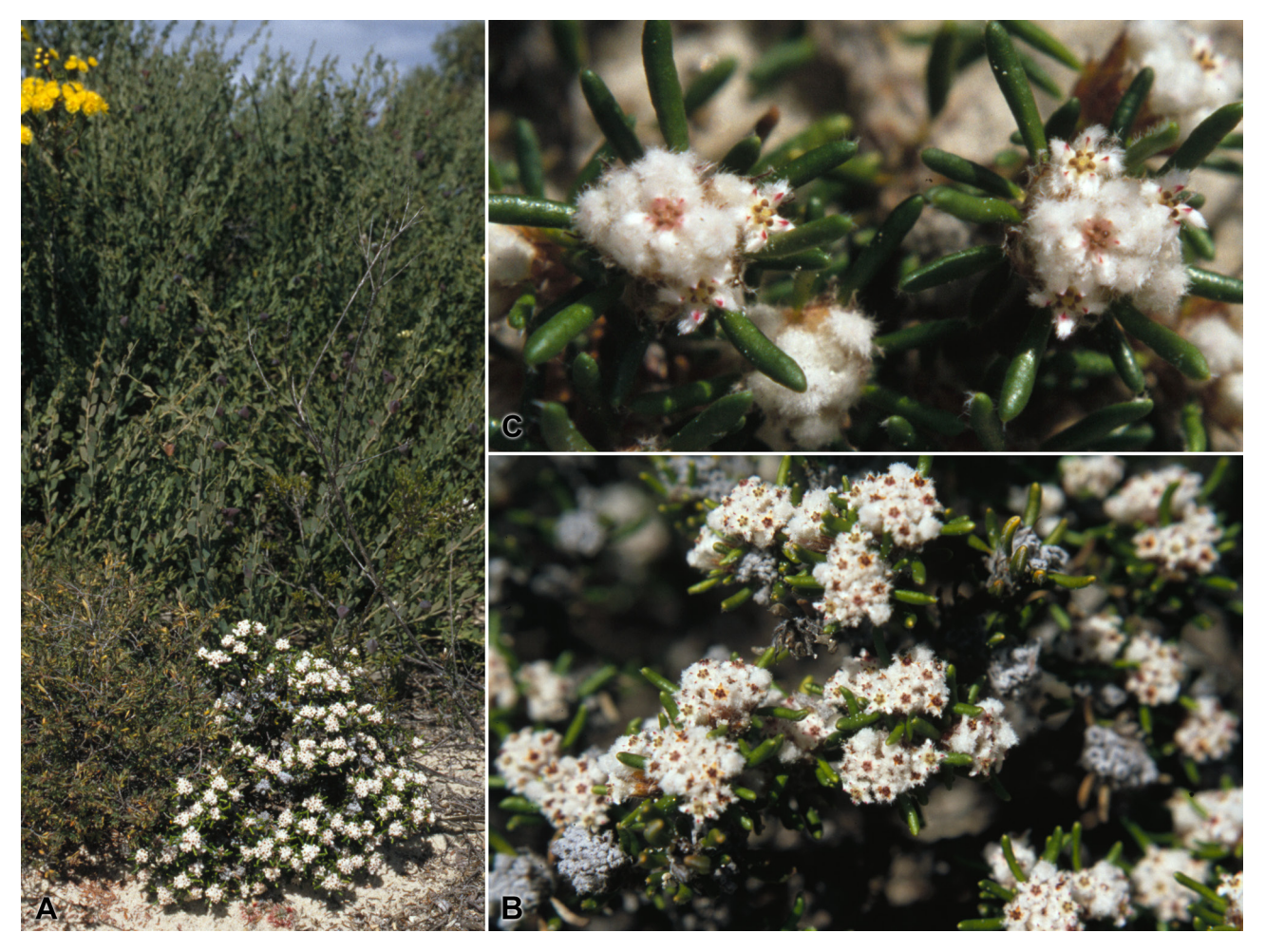
Fig. 1. Stenanthemum humile, growing in Kwongan bushland, Hi Vallee Farm, Badgingarra (W.A.). A Flowering plant; B close up of flowering branches; C flower-heads, not surrounded by white floral leaves. — J. Kellermann 195 (AD).

diameter. Sepals 0.7–1 mm long. Petals 0.5–0.6 mm long, indistinctly clawed. Disc inconspicuous. Ovary stellate-hairy; style 0.4–0.5 mm long. Fruits c. 2 mm long; seeds 1.2–1.3 mm long.