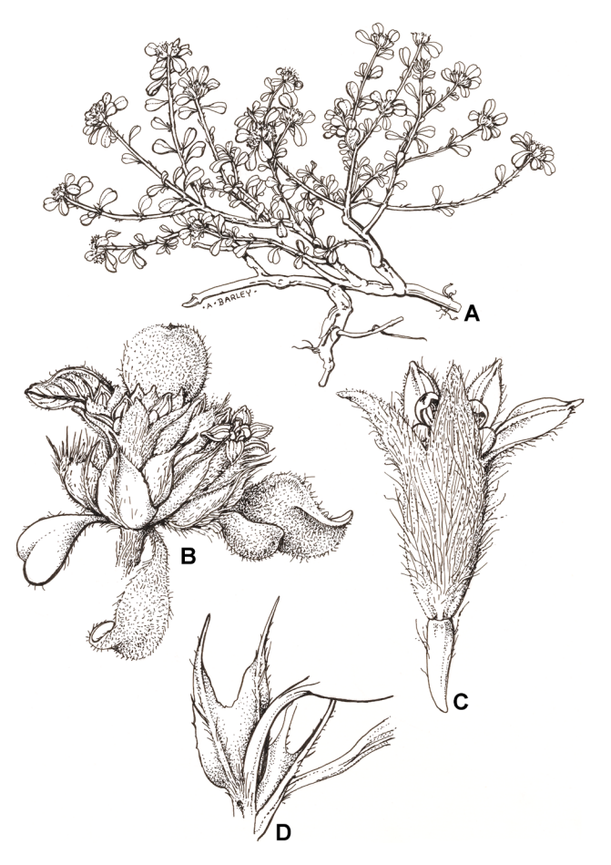
Fig. 3. Stenanthemum pimeleoides, illustrated from a specimen collected near Swansea (Tas.). A Habit ×0.6; B inflorescence with felty floral leaves ×3.7; C flower ×10; D connate pair of stipules with petiole ×10. — A.M. Buchanan 4796 (MEL). Line drawing by Anita Barley.

Phenology. Flowers Dec.-Feb.; fruits all year.