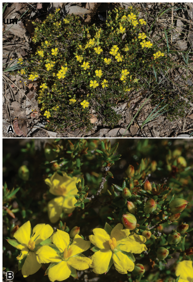
Fig. 2. Hibbertia exutiacies in the Victorian Midlands. A Habit; B flowers and buds. — R.W. Purdie 9766.

Variation. Throughout the range of the species, plants have a decumbent habit with wiry branches, except in the lower Flinders Ranges, S.A., where they have a distinctly more erect habit with rigid-woody branches (e.g. C.D. Boomama 241). These Flinders Ranges plants have flowers with commonly 4 stamens, but from Mambray Creek occasionally decumbent plants with 6 stamens have been recorded (e.g. D.J.E. Whibley 4394),