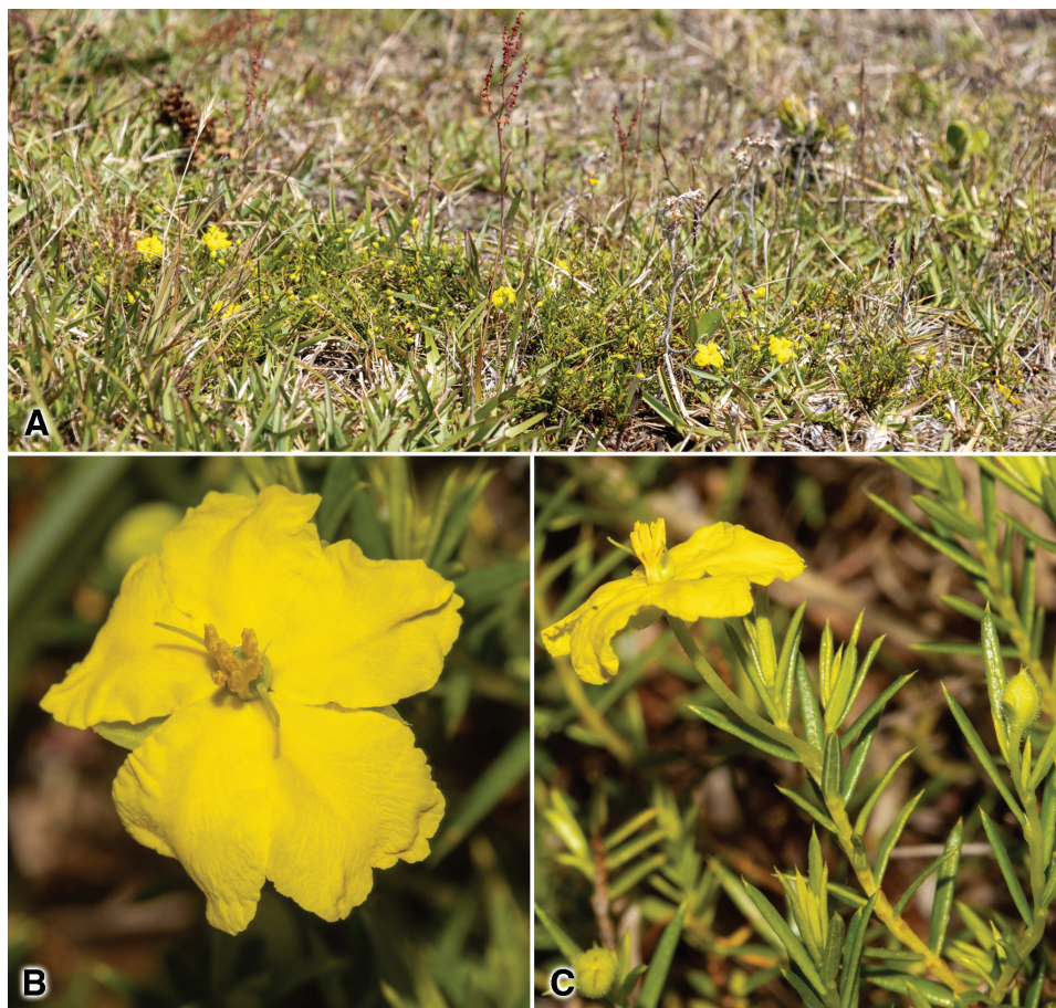
Fig. 3. Hibbertia prorufa near Cape Banks, Kamay-Botany Bay N.P., Sydney. A Habit; B, C close up of flowers.

Etymology. The epithet pro-rufa , Latin, “instead of rufa (the species)” refers to the close resemblance of this species to H. rufa , though there are fundamental differences between the two species.